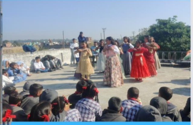
FOUNDATION DAY CELEBRATION