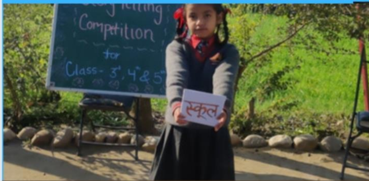
STORY TELLING COMPETITION