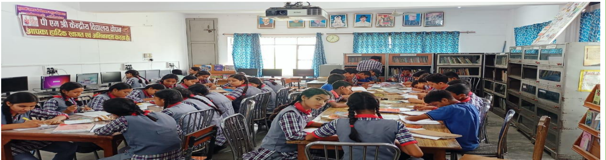
School Library: A school library is a designated space within a school where students, teachers, and sometimes parents or community members can access a wide range of educational resources, primarily books and other printed materials.