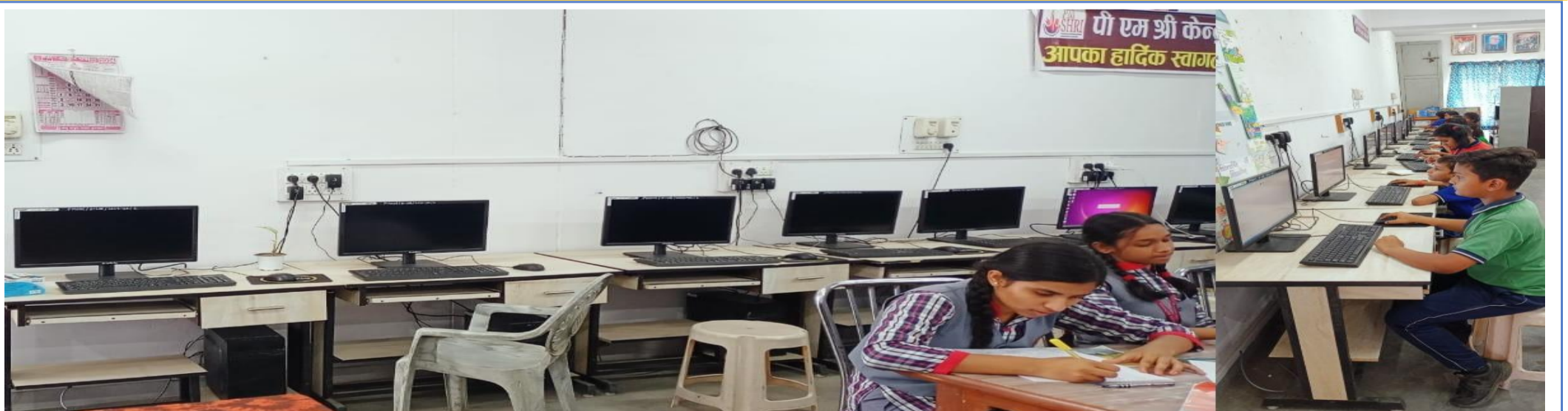
Digital Library: A digital library is a collection of digital resources that are organized, catalogued, and accessible electronically. Unlike traditional libraries that primarily house physical books and materials, digital libraries offer a wide range of digital content.