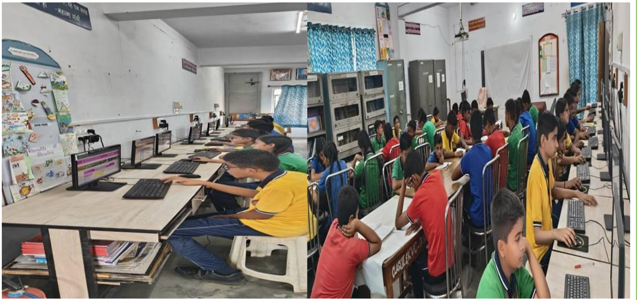
Digital Library Users: