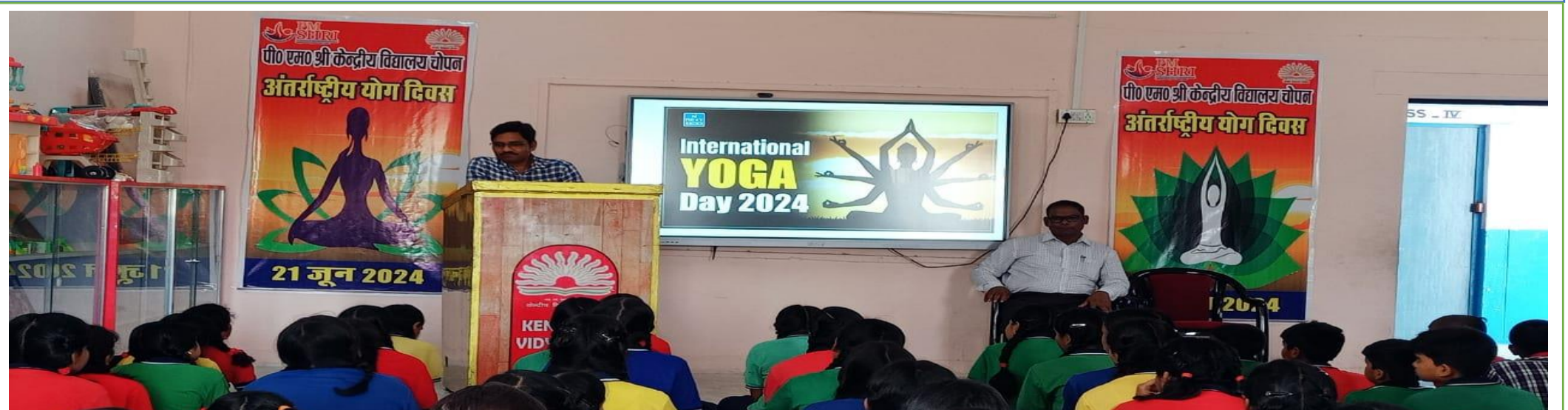
INTERNATIONAL YOGA DAY: International Yoga Day, celebrated annually on June 21st, is a global event recognized by the United Nations.