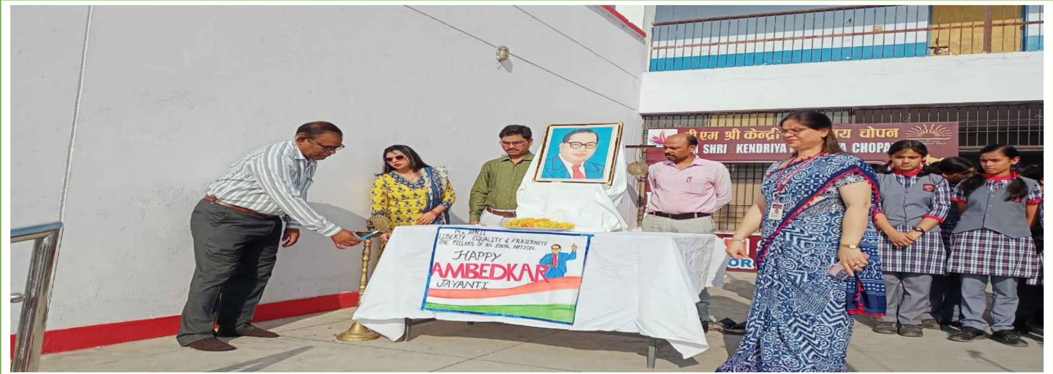
Celebrating B.R Ambedkar Jayanti: B.R. Ambedkar Jayanti, also known as Ambedkar Jayanti, is an annual observance in India held on April 14th to commemorate the birthday of Dr. Bhimrao Ramji Ambedkar. He was a key architect of the Indian Constitution.

It gives me immense pleasure to put forth this issue of the Newsletter of our vidyalaya for our well-wishers and beloved readers. The Newsletter chronicles the recent activities, events and happenings of the primary section & Secondary section of our Vidyalaya during the last quarter. It gives an opportunity to exhibit the talents of the teachers and students in the field of common minimum programme and co-curricular activities on one hand and gives our parents a glimpse of the activities of their wards on the other hand.