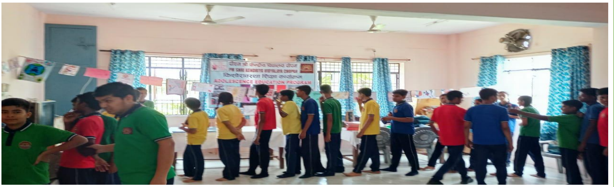
Adolescence education program: Adolescence Education Program (AEP) refers to an educational initiative aimed at addressing the specific needs and challenges faced by adolescents, typically those between the ages of 10 to 19 years.