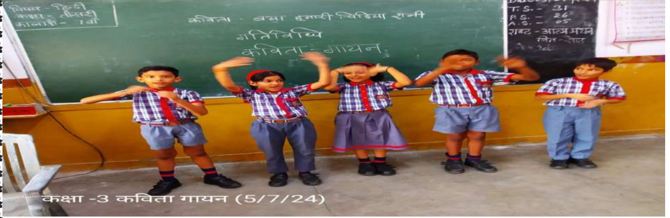
कक्षा -3 कविता गायन (5/7/24)