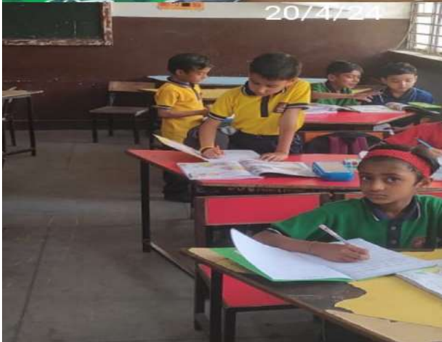
Hindi calligraphy class 2 नों से र्द रहता है। इसलिए 20/4/24

हिन्दी संलेख HUMISHA नीमा की घड़ी नीमा लोफर में ली बने स्कूल में लौटती है। इस समय पर पर सिर्फ वारी होती है। वे कहीं नहीं आती-जाती हैं। कभी बैठे-बैठे सब्जी काट रही होती हैं। उनके घुटनों में दर्द रहता है। इसलिए