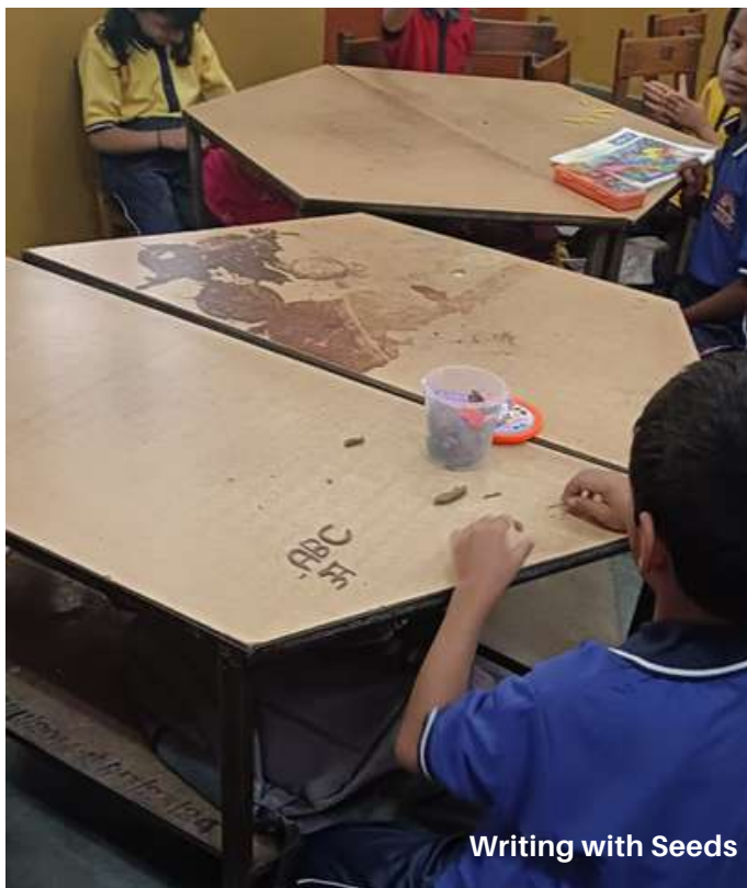
Writing with Seeds