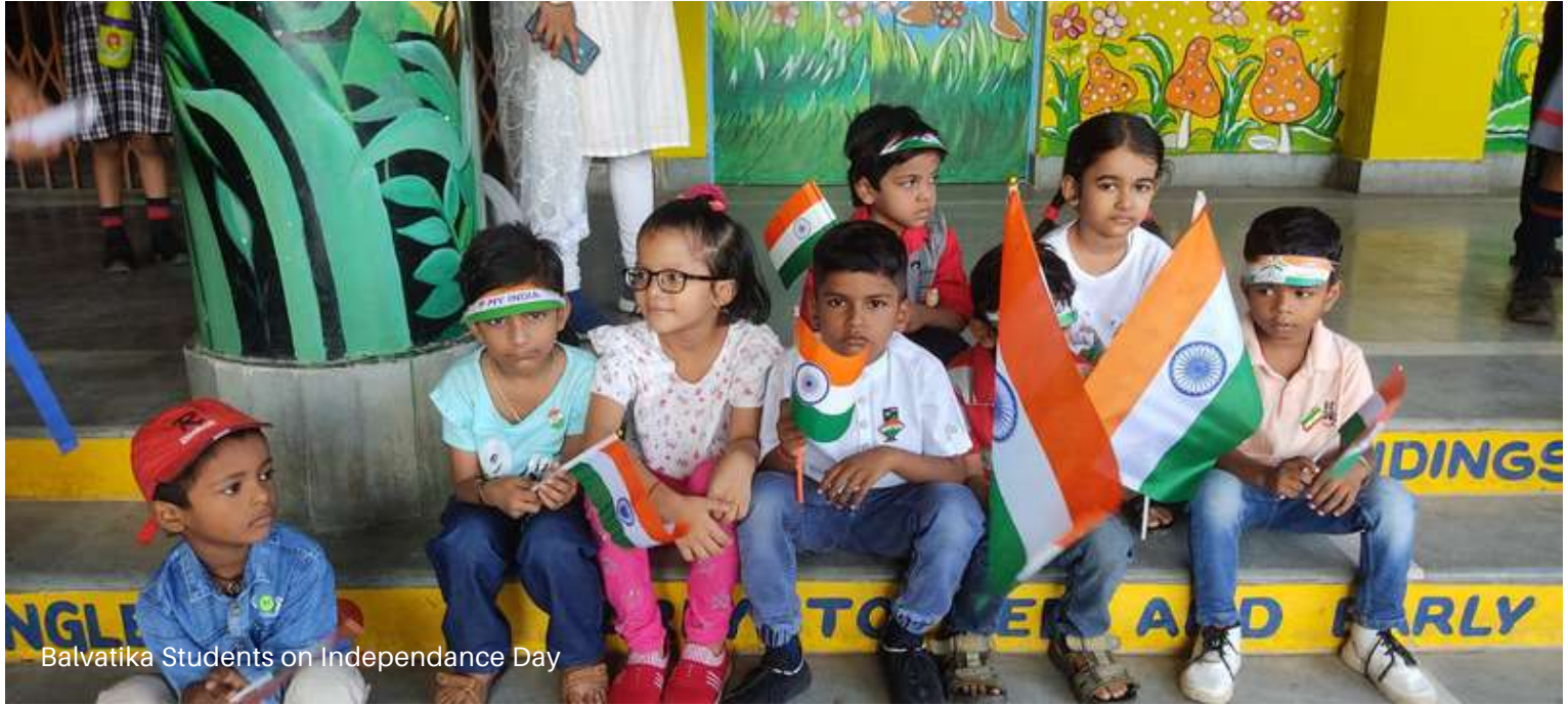
Balvatika Students on Independence Day