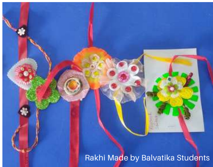
Rakhi Made by Balvatika Students