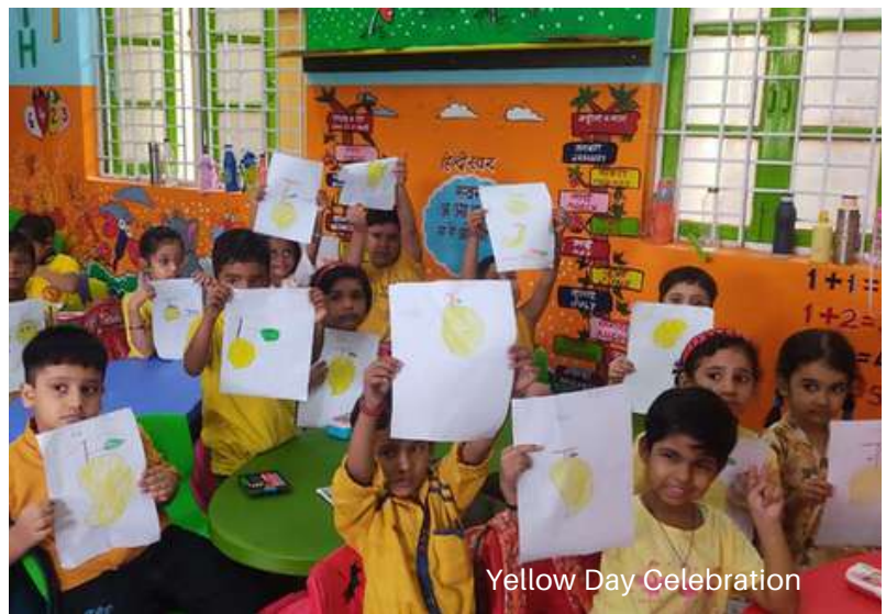
Yellow Day Celebration