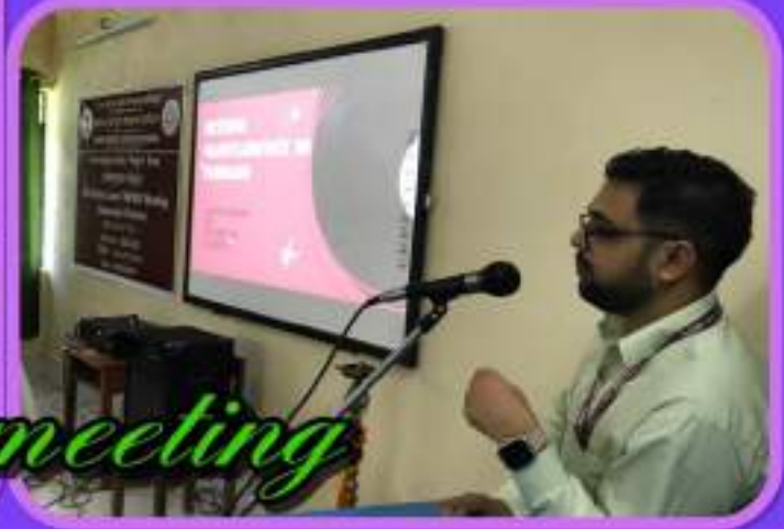
Cluster Level - "NIPUN" meeting