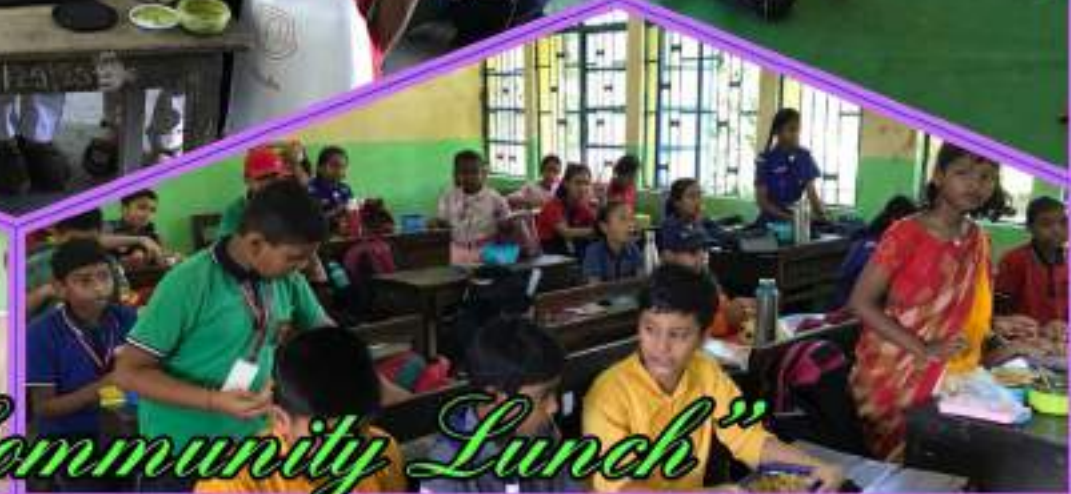
Education week "Community Lunch"