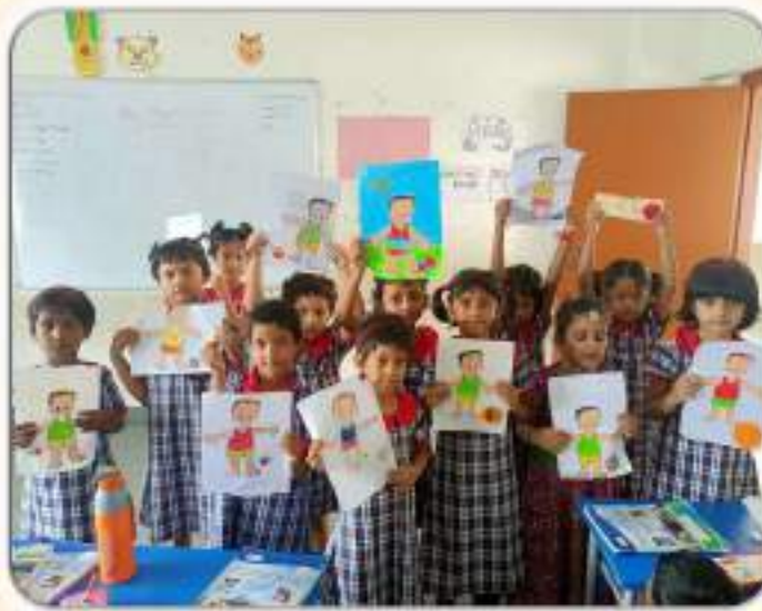
Hand on activity - Class I