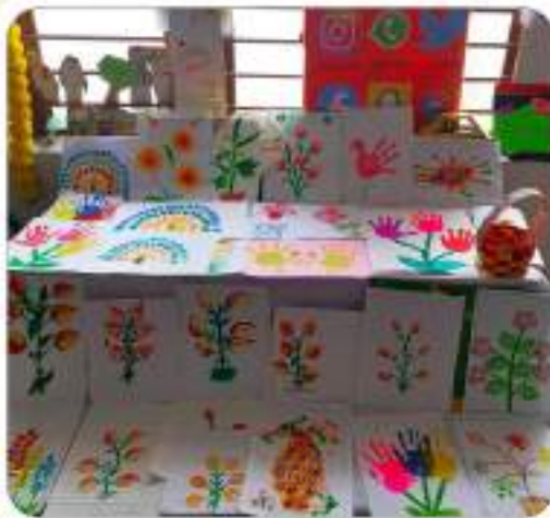
Thumb and Hand Printing

Co-curricular activities (CCAs) are a part of the curriculum at Kendriya Vidyalaya (KV) schools and are intended to help students develop their character and overall growth. CCAs can include a variety of activities, such as: Drawing and painting, mask making, thump printing, science experiments, dance, music, recitation, story telling, fancy dress etc.