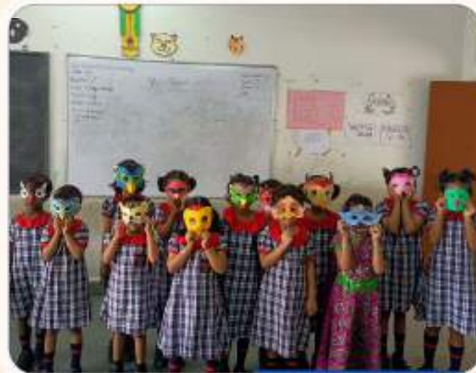
Bird Mask Making By Class I

Co-curricular activities (CCAs) are a part of the curriculum at Kendriya Vidyalaya (KV) schools and are intended to help students develop their character and overall growth. CCAs can include a variety of activities, such as: Drawing and painting, mask making, thump printing, science experiments, dance, music, recitation, story telling, fancy dress etc.