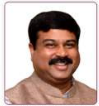
Shri Dharmendra Pradhan Hon'ble Minister of Education

To provide, establish, endow, maintain, control and manage schools, hereinafter called the 'Kendriya Vidyalaya' for the children of transferable employees of the Government of India, floating population and others including those living in remote and undeveloped locations of the country and to do all acts and things necessary for providing a conducive atmosphere in schools.