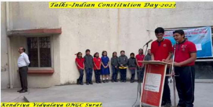
Kendriya Vidyalaya ONGC Surat

A living testament to the spirit of 'We, the people'