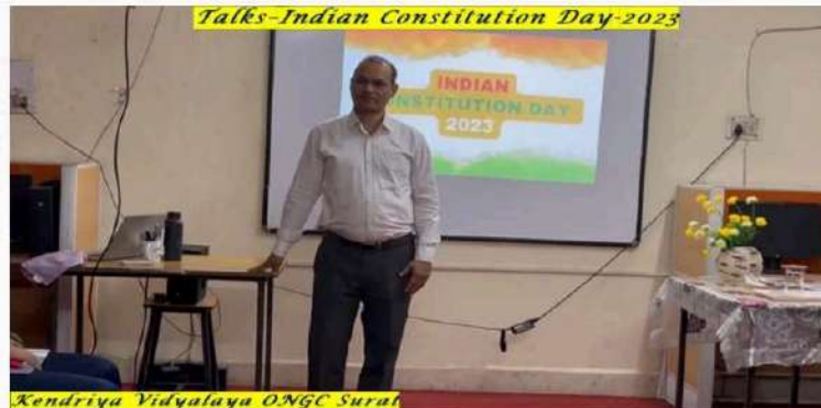
Kendriya Vidyalaya ONGC Surat