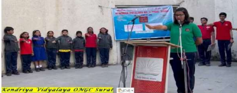
Kendriya Vidyalaya ONGC Surat

November 26, a date that resonates with the ideals of our nation.