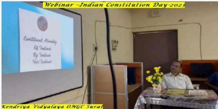
Kendriya Vidyalaya ONGC Surat