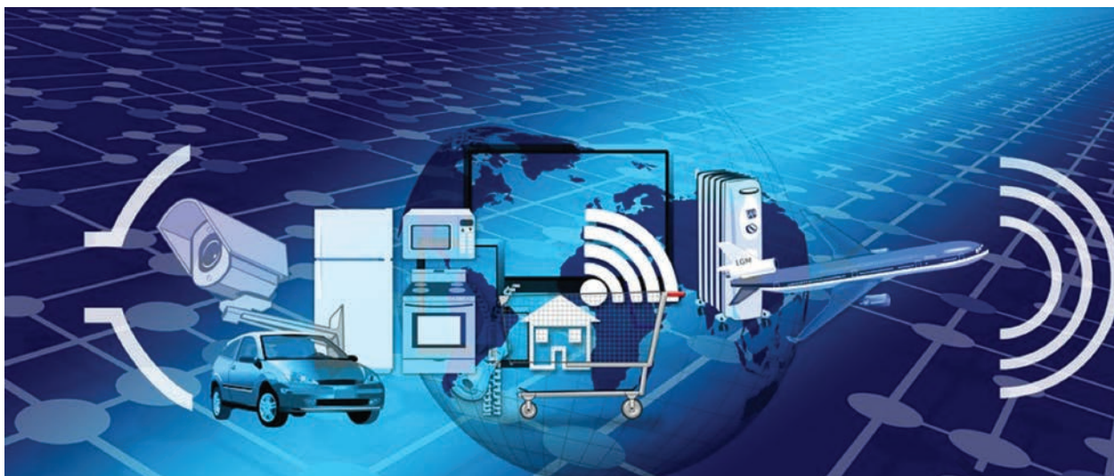
Figure 1.2: ICT Around Us

digital television. In addition to printed newspapers now we also have their electronic versions. Along with traditional radio, we also have online radio.