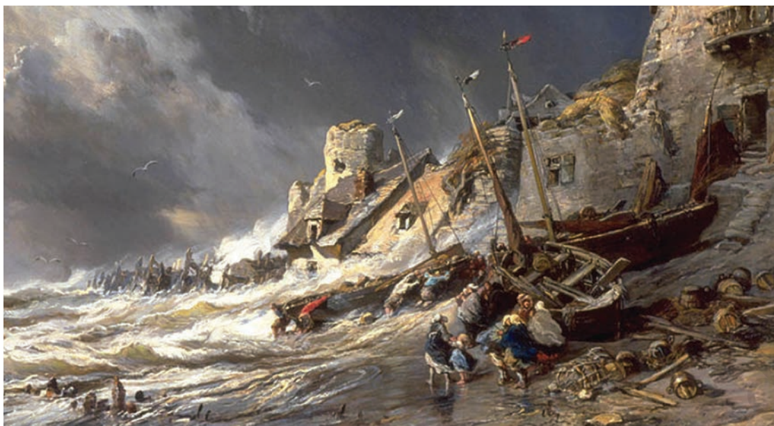
Figure 1.1: Coast Scene

Technology refers to methods, systems and devices, which are a result of scientific knowledge, being used for practical purposes. For example, Muskan went to an excursion to Bhubaneswar and visited the State Museum. She saw various mineral ores in the mineral section of the museum. She decided to capture photographs to share with others who may not have seen the ores. She borrowed her teacher's mobile and clicked pictures of the rare collection. She shared all the pictures on her blog along with a description of the ores. Many viewers commented and appreciated Muskan for sharing those pictures and description.