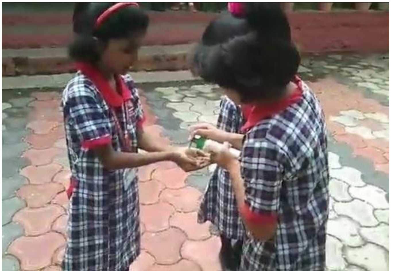
Day 11: Personal Hygiene Day Date: 11th September 2024 Venue: Kendriya Vidyalaya, Washim