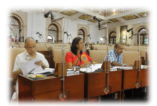
PANEL OF JUDGES