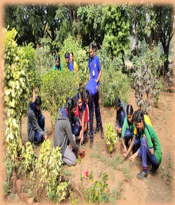
PM SHRI KENDRIYA VIDYALAYA HOSAPETE ECO CLUB ACTIVITIES