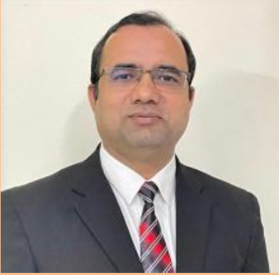
SHRI. DHARMENDRA PATLE HON'BLE DEPUTY COMMISSIONER KVS, REGIONAL OFFICE, BENGALURU