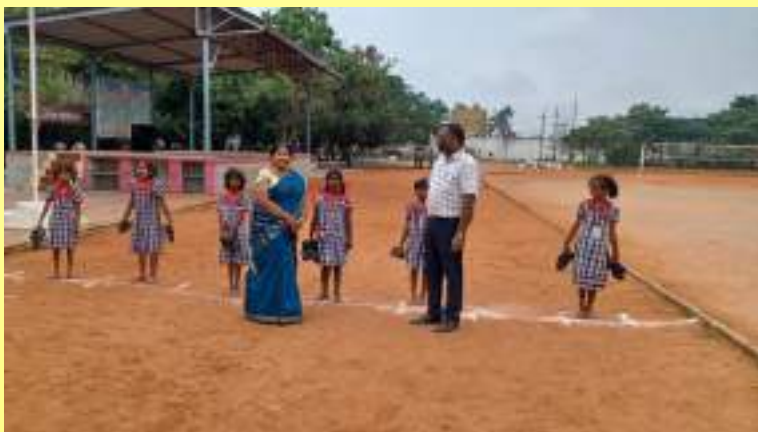
On your mark .....get set, GO.....