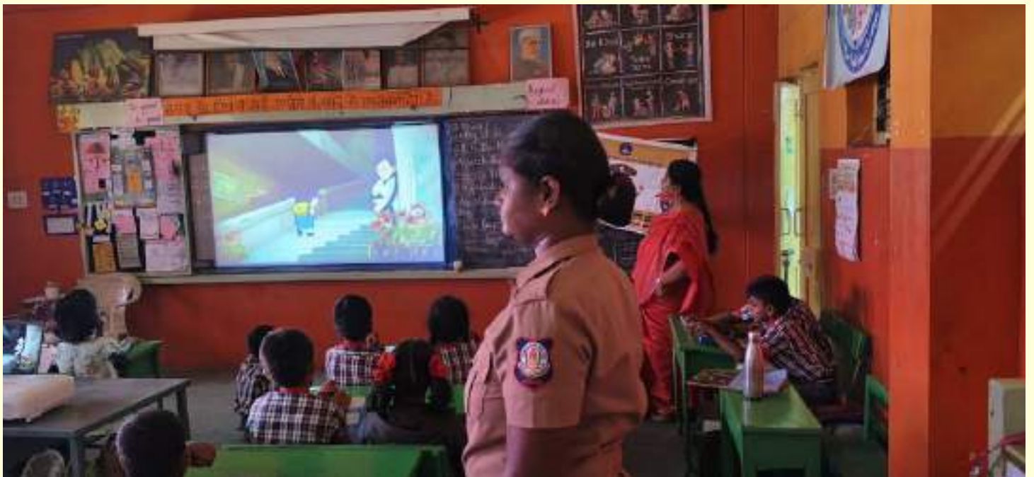
Ways to keep ourselves safe .A video session on children safety by staff of sulur police station 23/01/2024