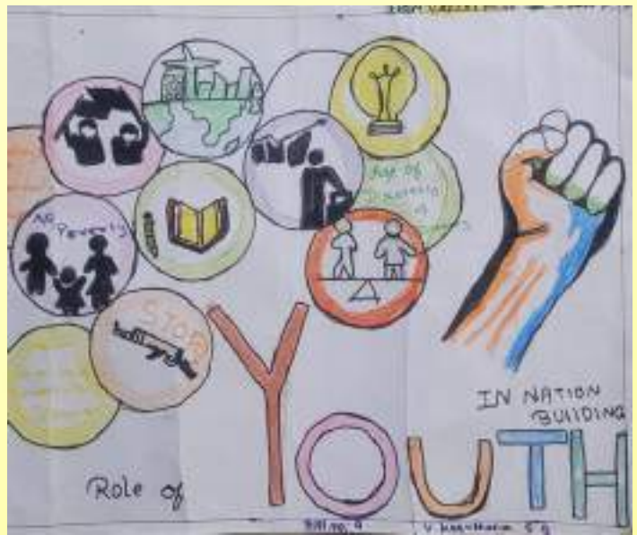
The youth are catalyst of change Poster making Day on 06/01/2024