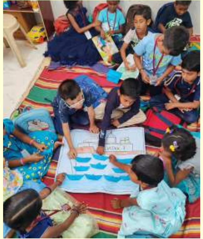
Blue day by Balvatika Blue.....bluer.....loving it.... my boat on water, whales,sky ....ohhh 19/01/2024