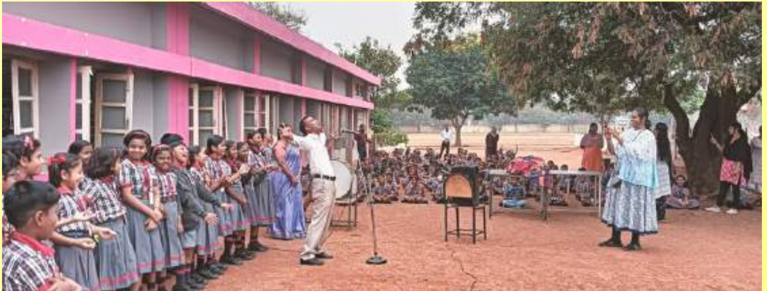
Inhale the future, exhale the past.