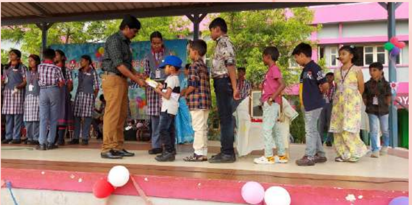
The time to be happy is now - feeling of joy in the air on children's day .

Celebration of Fancy Dress and Children's day on 14/11/2023