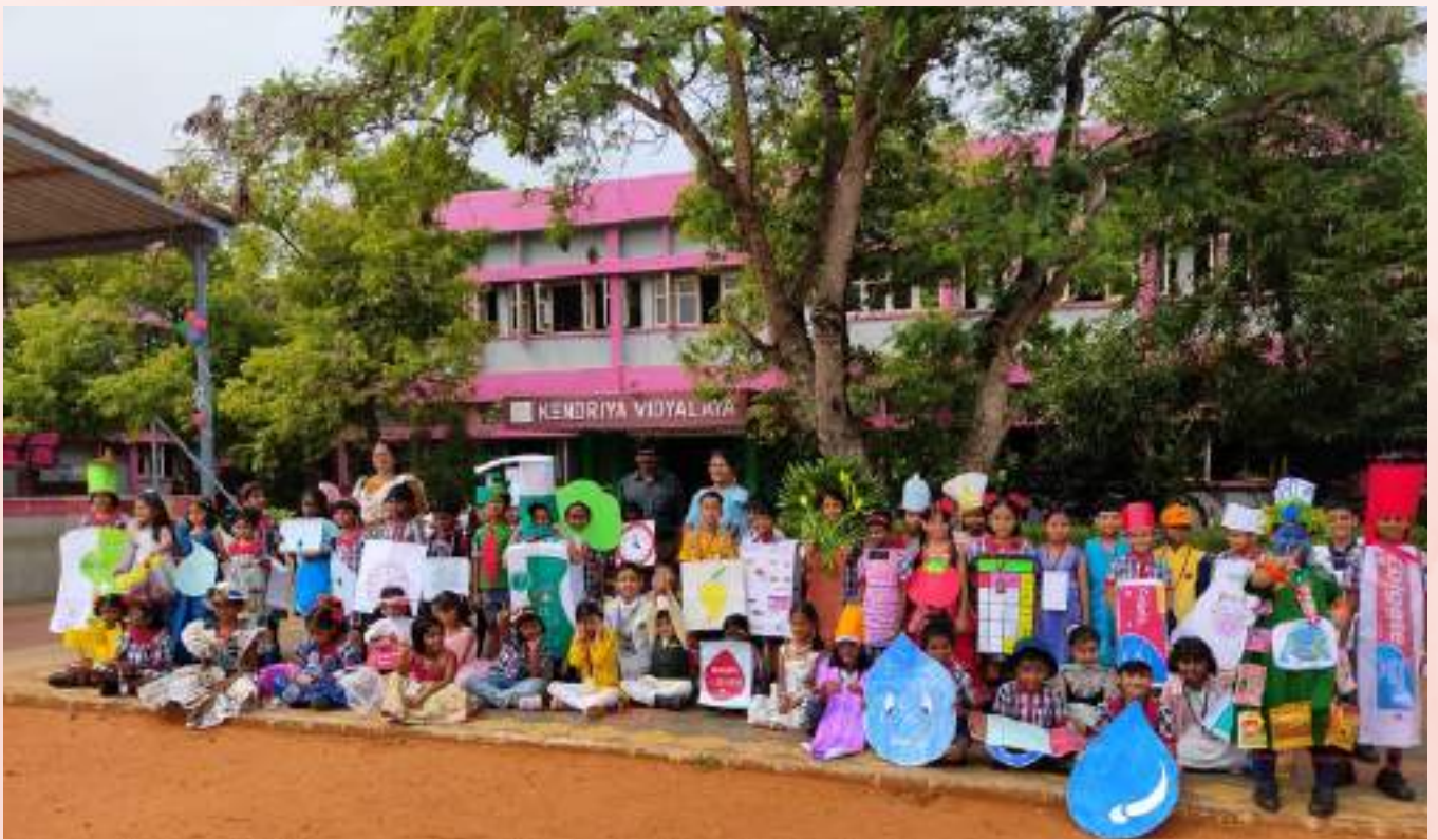
FANCY DRESS COMPETITION on the theme THINGS OF DAILY USE..Such a marvelous presentation.