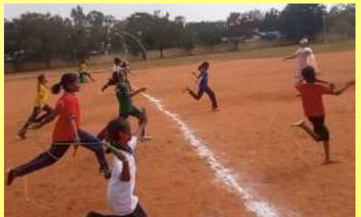
At last our field of maximum interest

many sports events and competitions were held between 08/01/2024 -11/01/2024