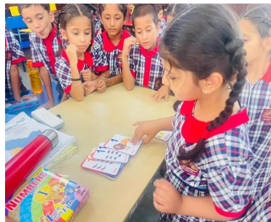
GENDER AND EQUITY /SELF DEFENCE/AEP/OTHER WORKSHOPS