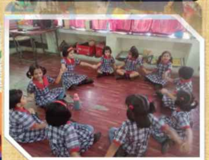
LEARNING BY DOING