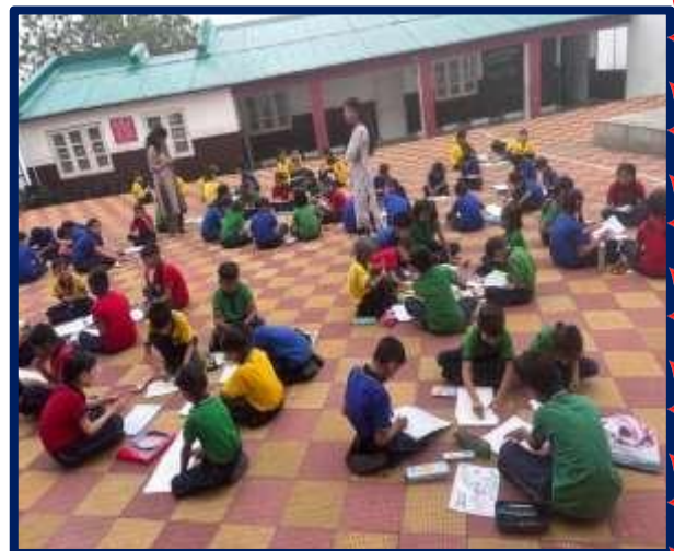
Drawing Competition and Community Lunch on 29.06.2024