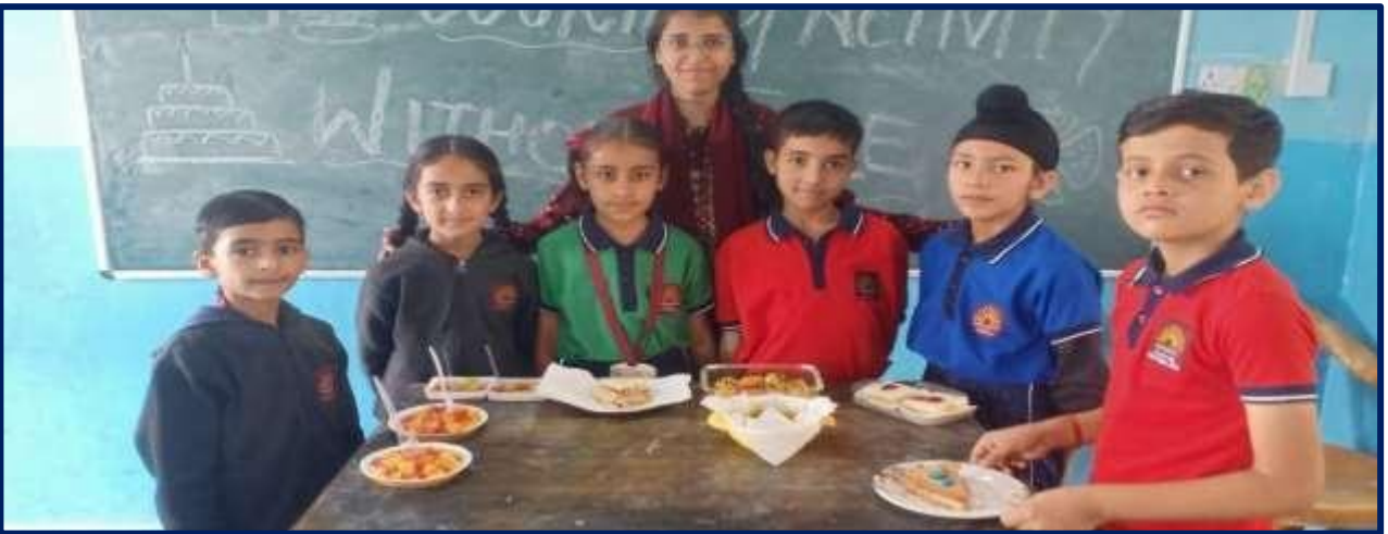
Cooking without fire activity on 27/04/2024