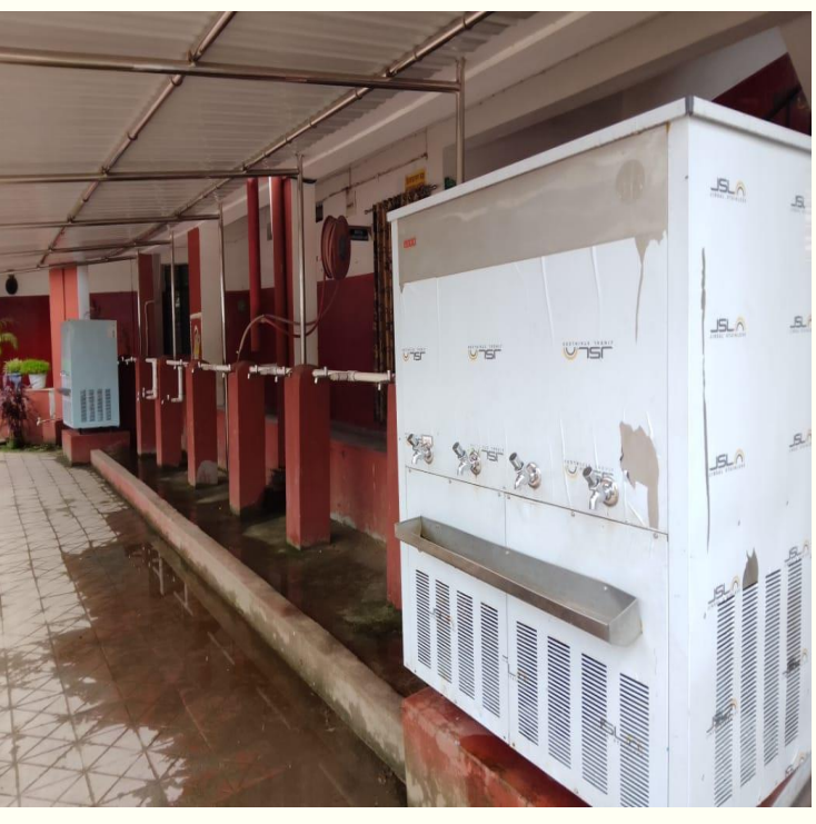
BEFORE AFTER AFTER