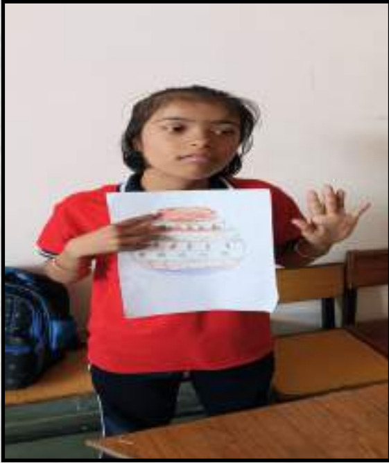
Use of Adaptive Tools