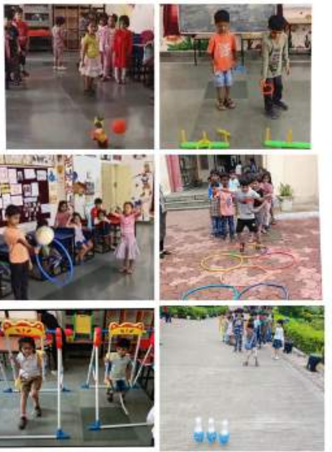
Outdoor Play Activities