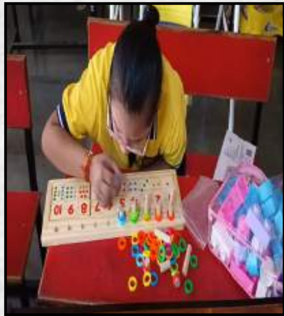
Fine and grasp motor activity