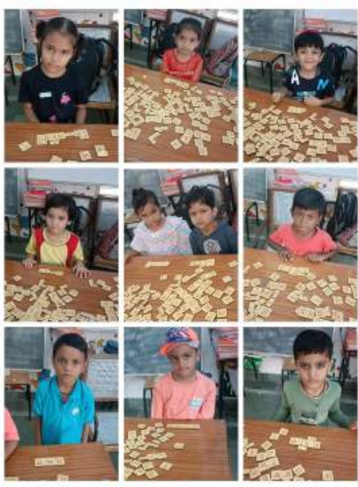
Foundational Literacy Activity