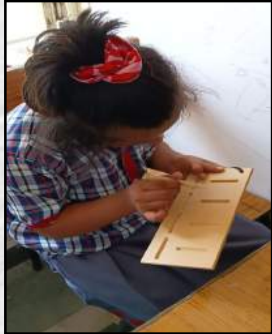
Building Line Patterns