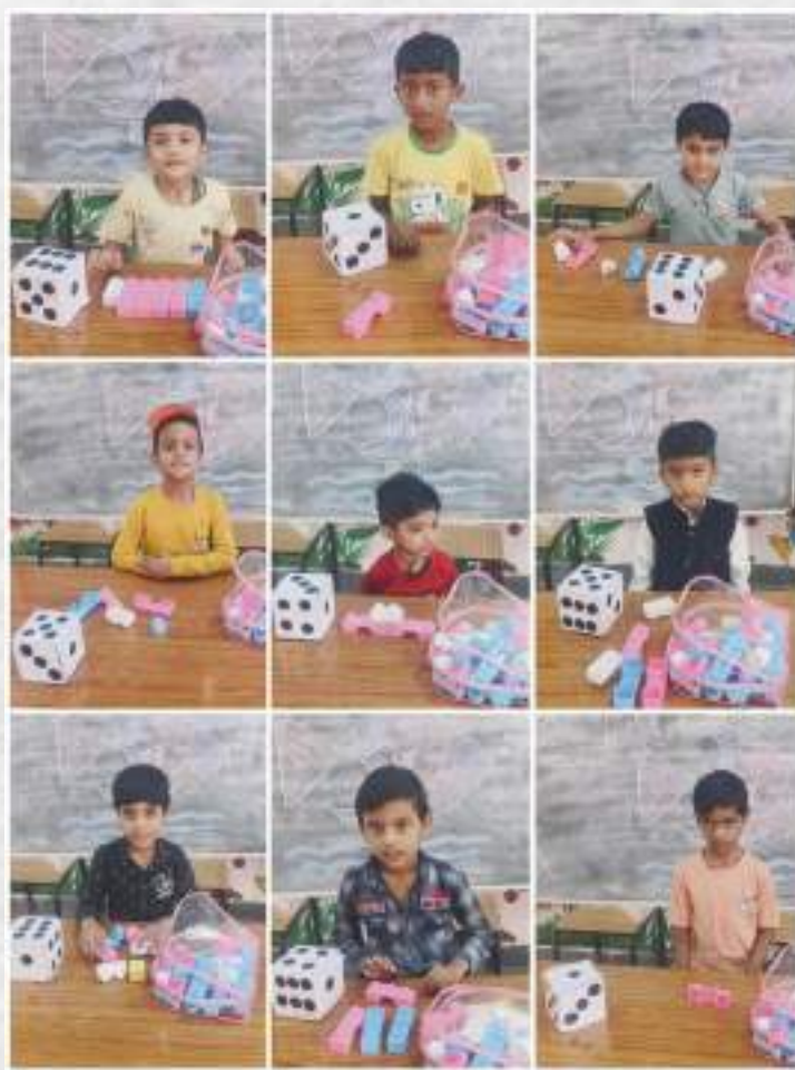
Foundational Numeracy Activity