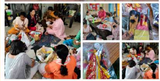
PUPPET MAKING WORKSHOP