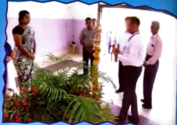
Academic Inspection - Guiding Lights.....