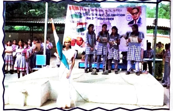
Justice, Liberty, Equality, Fraternity...