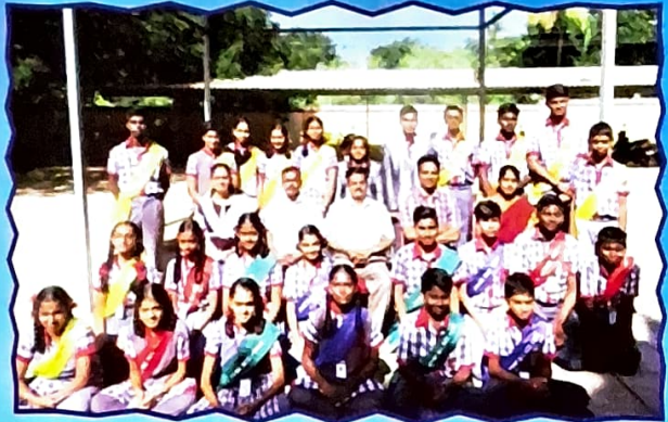
Students' Council - Crowning Glory