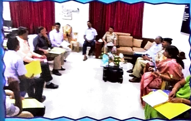
VMC - Effective Management