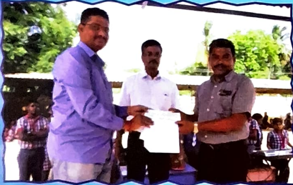
Help Age India - Social Responsibility