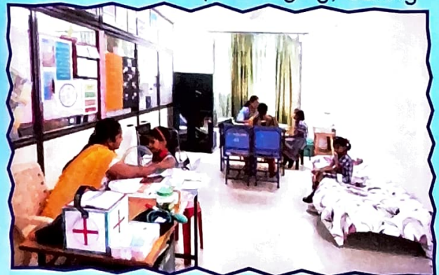
Dedication Beyond Measure