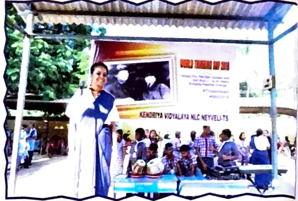
World Thinking Day