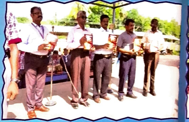
Vidyalaya Patrika Release