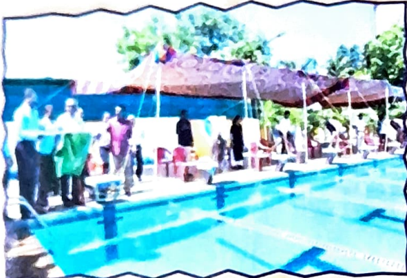
Regional Swimming Camp