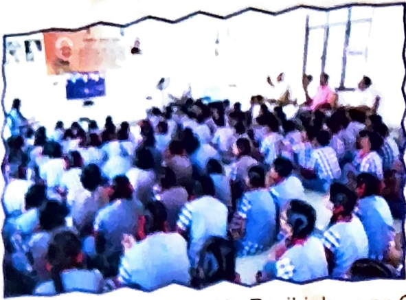
PM Modi's Parikicha per Charcha - Great Expectations