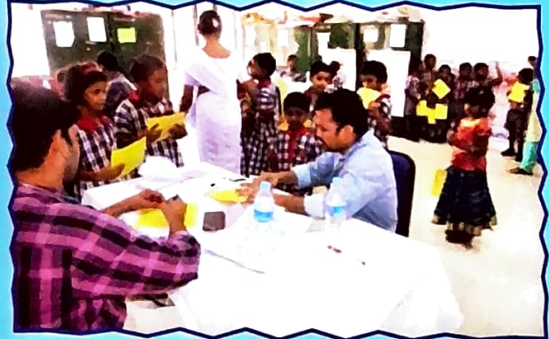
Medical Check Up - Obliging, Caring