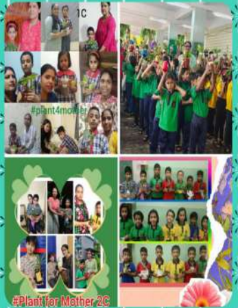
#Plant for Mother 2020