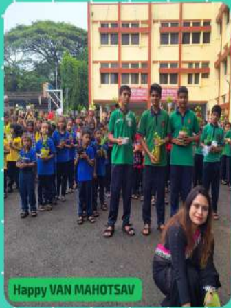
Happy VAN MAHOTSAV