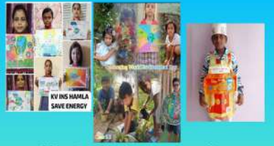
World Environment Day