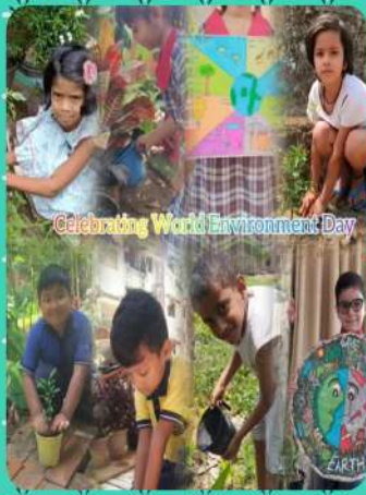
Celebrating World Environment Day