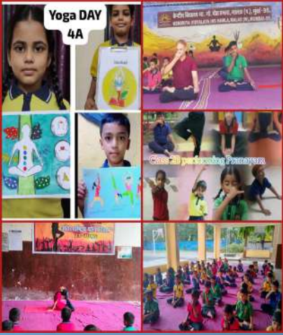
Yoga DAY 4A

"In the tapestry of life, school days are the bright threads that weave together our fondest memories."