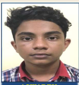
ASWADEV, VIII A(S2)

Regional Level(Under 14) 2nd position Basket ball