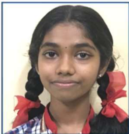
MAYOOKA, VIII A(S2)

Cluster level Kabbadi (under 17)- 1st position