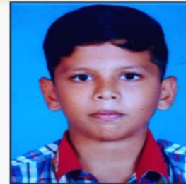
DEVASARANG B, IX A(S2)

1st in regional level Kabaddi (under 17)