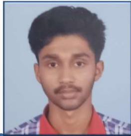
KASHINADHAN, XI A(S2)

U-17 Boys Regional Level Cricket 2nd Position