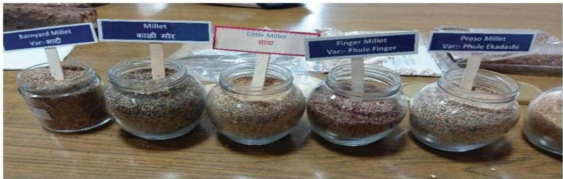
Fig. 14: Different kinds of millets commonly grown in India