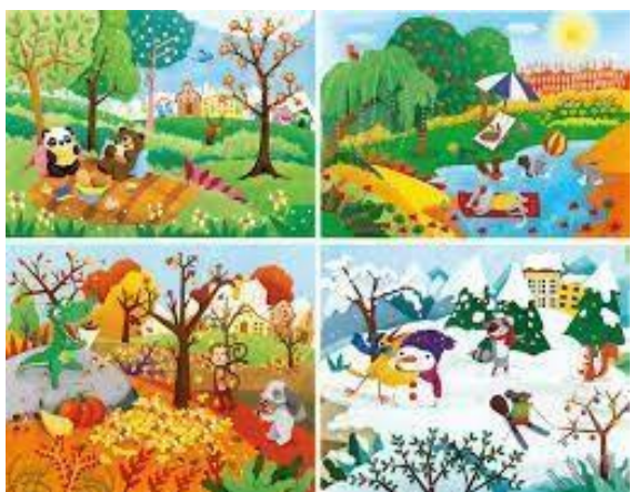
Order of Seasons