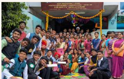
Regional Level Youth Parliament, 2025

PM Shri Kendriya Vidyalaya Coimbatore has won Second Prize in the Youth Parliament competition held on August 12-13 at CRPF Avadi, Chennai . First Prize went to KV Madurai No. 1, and Third Prize to KV Karaikudi.