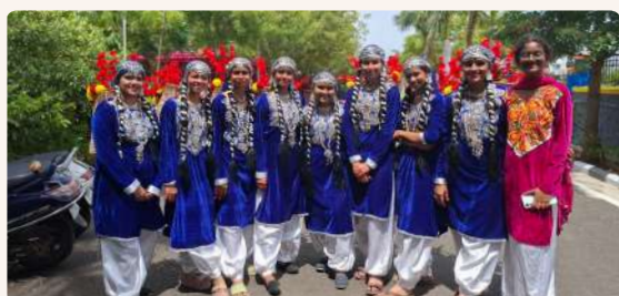
EBSB, Kala Utsav Group Dance, Madurai

On 8 th and 9 th September, our school's students participated in the regional level Kala Utsav, held in conjunction with the Ek Bharat Shreshtha Bharat program at PM Shri Kendriya Vidyalaya No.2 Madurai. We extend our congratulations to the Group Dance 1 st s , Display of Artifacts 2 nd , Visual Arts 3 Dimensional (Sculpture) 2 nd prize winners and all the other participants.