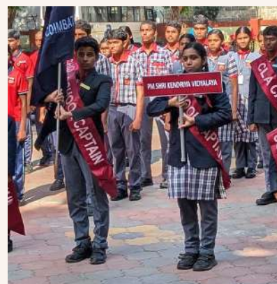
Investiture Ceremony, 2025-26