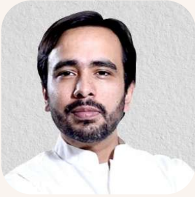
Shri Jayant Chaudhary Hon'ble Minister of State for Education