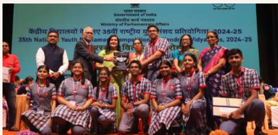
Regional level Trophy & Zonal Prize Certificate, New Delhi

A group of 8 students from PM SHRI Kendriya Vidyalaya Coimbatore had the incredible opportunity to visit the Indian Parliament in connection to the Youth Parliament Competition . Adding to the pride of the day, the team also received the Zonal Prize Certificate and the Regional Trophy for the academic year 2024-25 , a true recognition of the school's dedication and excellence at the regional and zonal level.