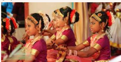
Annual Day, April 2025

In the month of April our school celebrated its Annual Day with vibrant cultural performances, dramas, and inspiring speeches. The event highlighted students' talents, achievements, and teamwork, making it a memorable and joyous occasion.