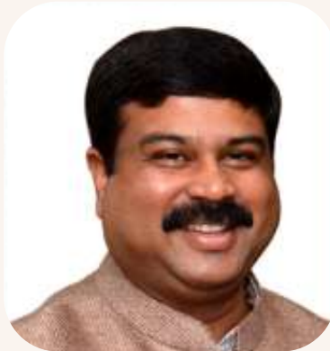
Shri Dharmendra Pradhan Hon'ble Education Minister, Chairman KVS