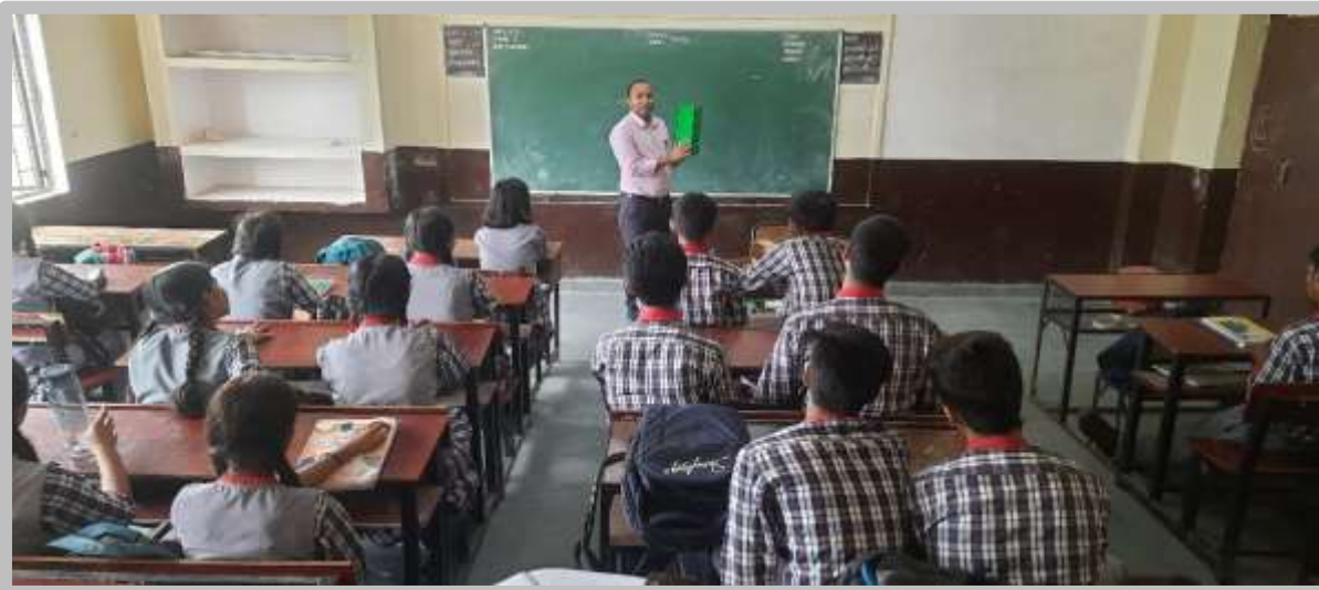
USE OF TLM IN MATHS TEACHING