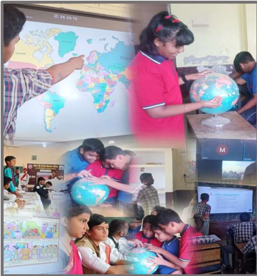
YOUTH PARLIAMENT, GLOBE- LONGITUDE & LATITUDE