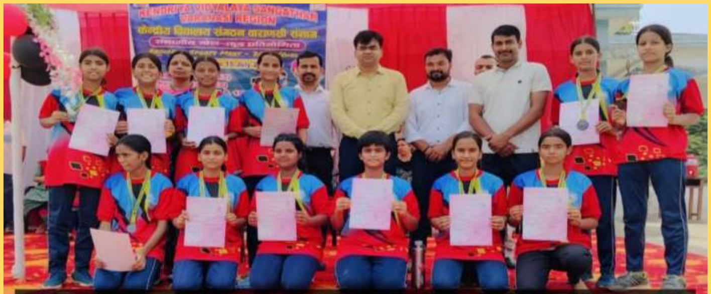
Kabaddi U-17 Girls Third Place in Regional Sports Meet 2024