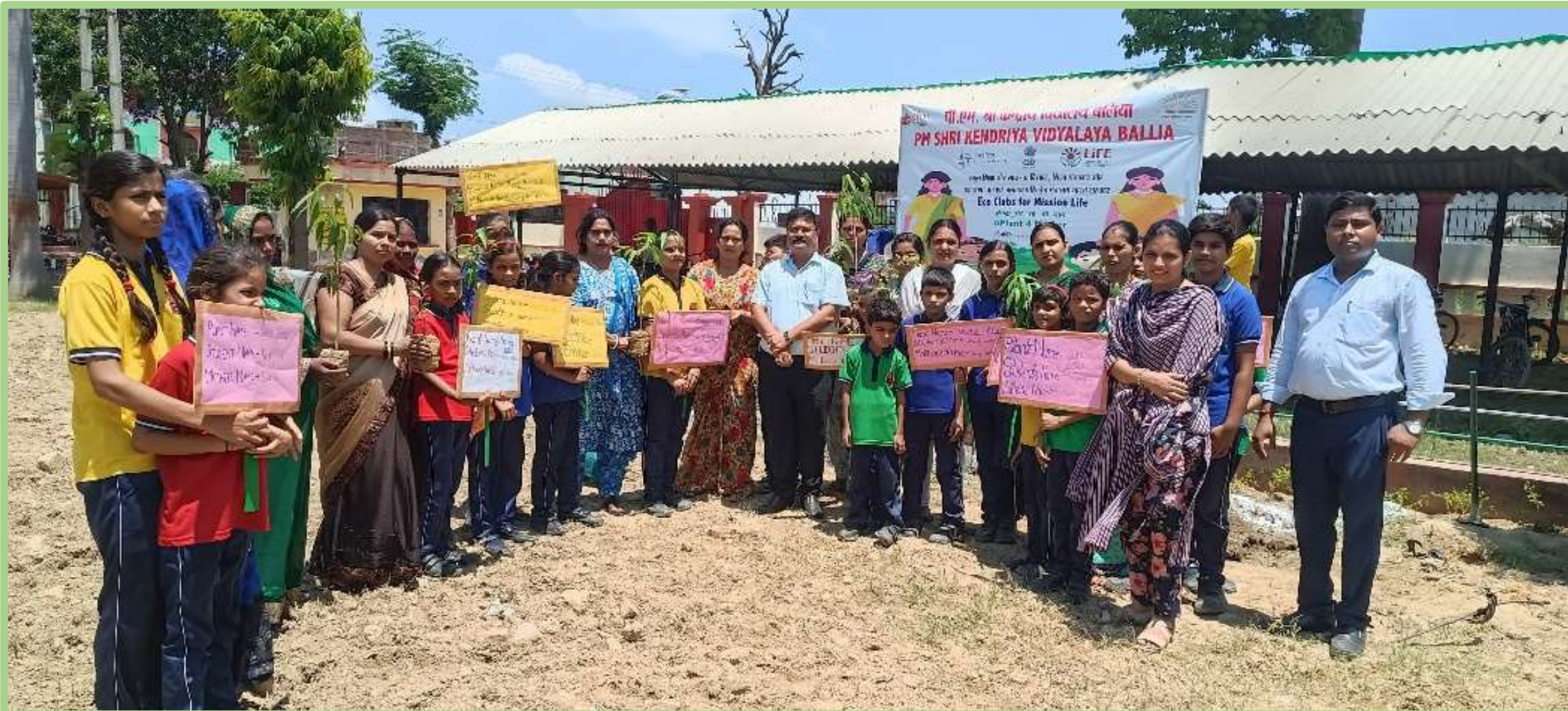
"Planting the seeds of a greener tomorrow: Students enthusiastically participate in a tree plantation drive , nurturing nature and fostering a sustainable future."