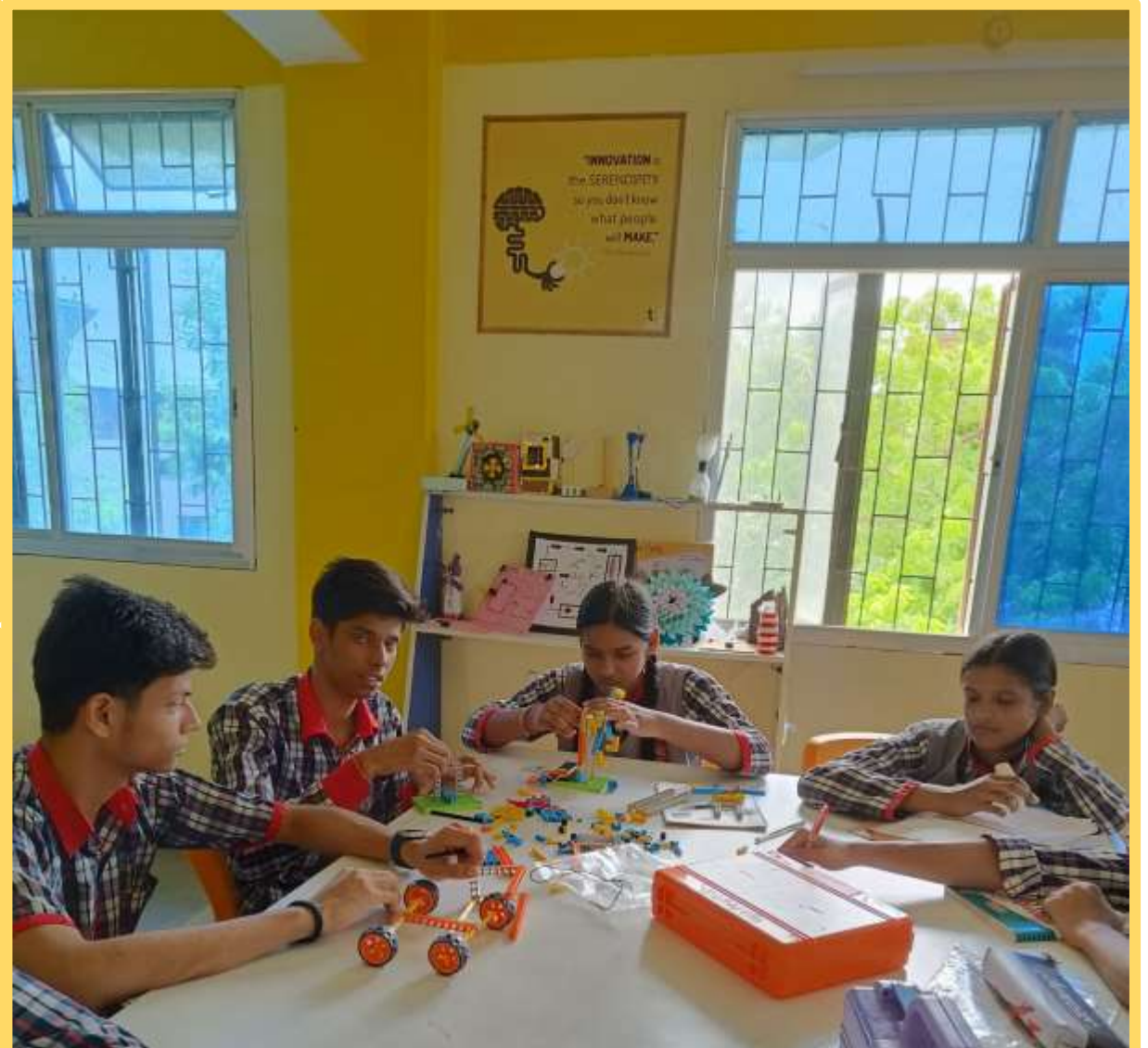
ATAL TINKERING LAB ACTIVITIES