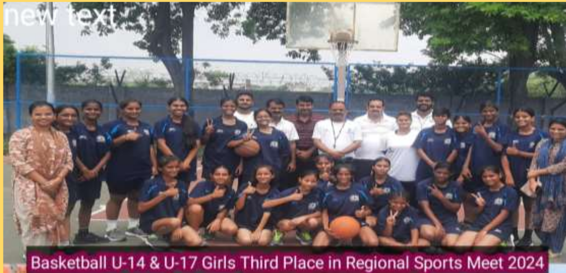
Basketball U-14 & U-17 Girls Third Place in Regional Sports Meet 2024