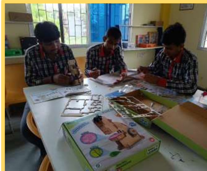
ATAL TINKERING LAB ACTIVITIES