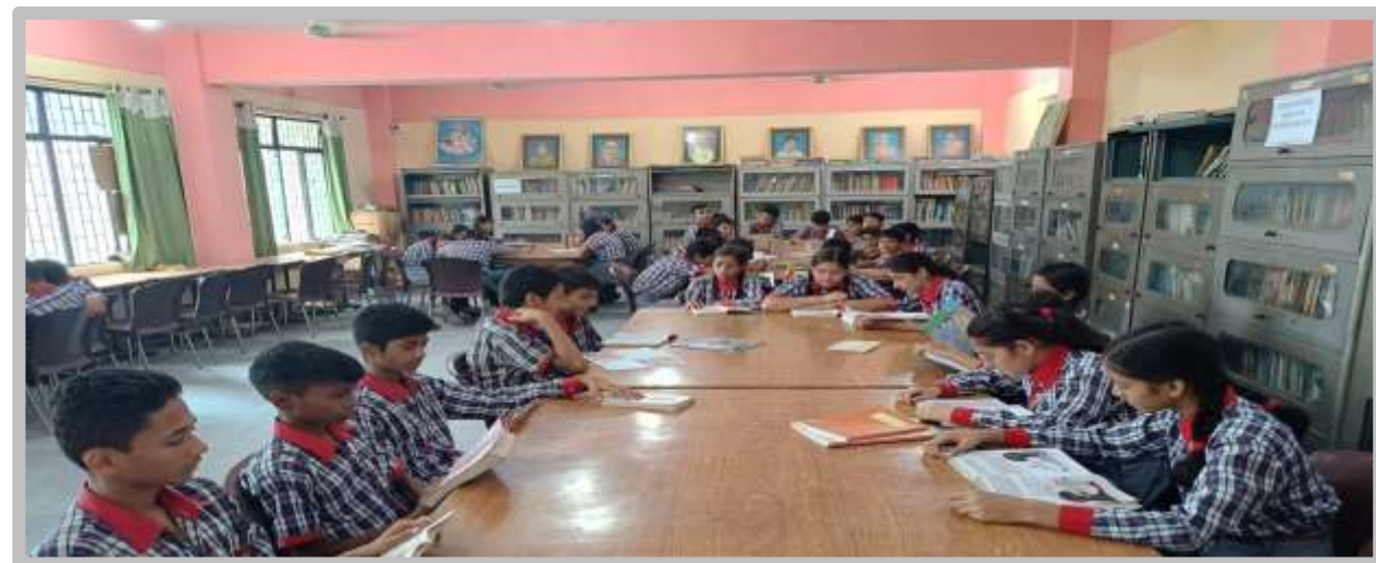
INCULCATING READING HABIT IN LIBRARY