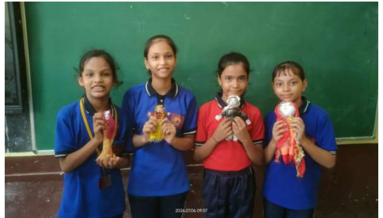
TOY BASED PEDAGOGY