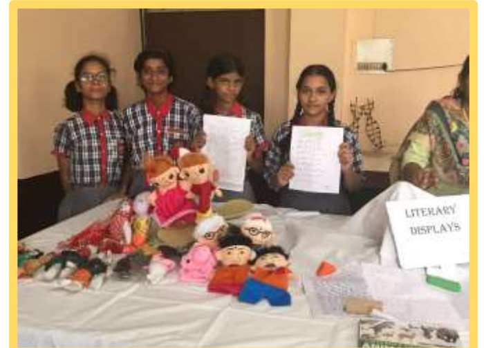
TEACHING LEARNING MATERIAL (TLM) DAY