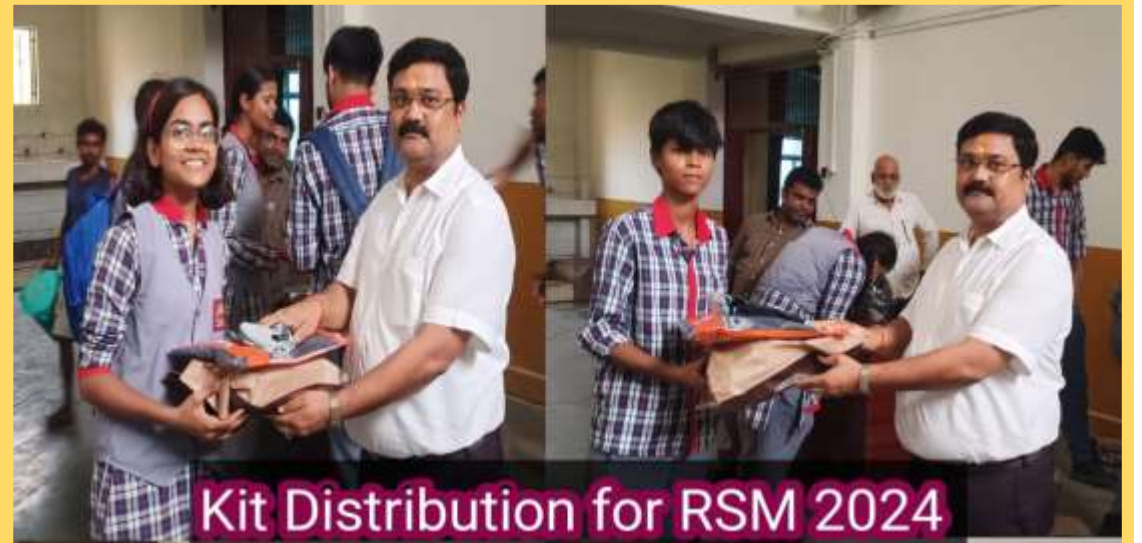
Kit Distribution for RSM 2024 By Principal Sir