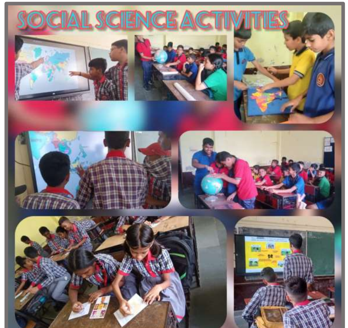
SOCIAL SCIENCE ACTIVITY (OCEANS & CONTINENTS)