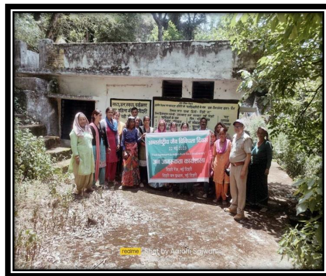
Figure 5: Programme organized under Uttarakhand Forest Divisions