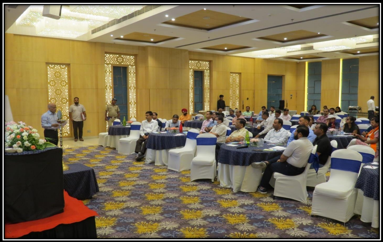
Figure 4: Participants of the programme