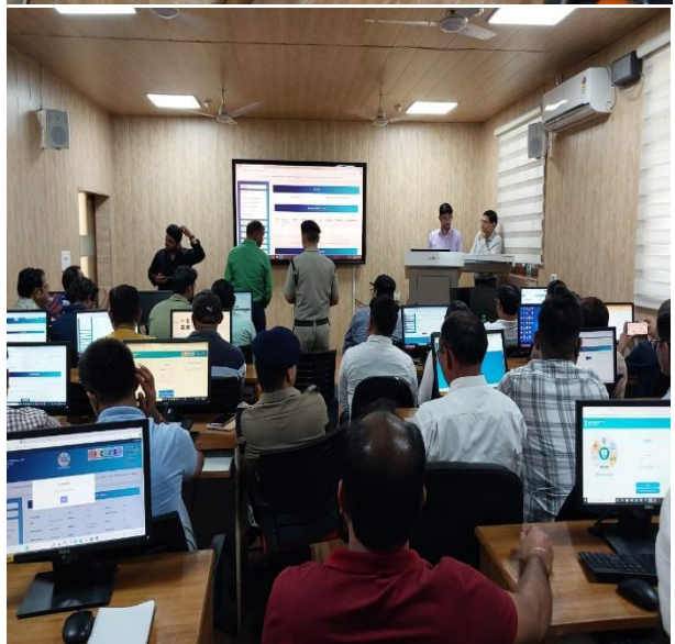
Glimpses of Day 3 Training