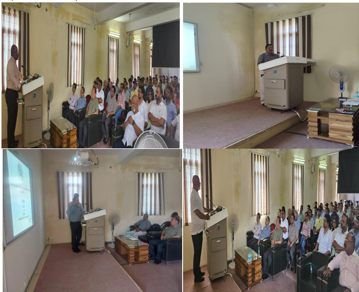
Glimpses of Day 1 Training