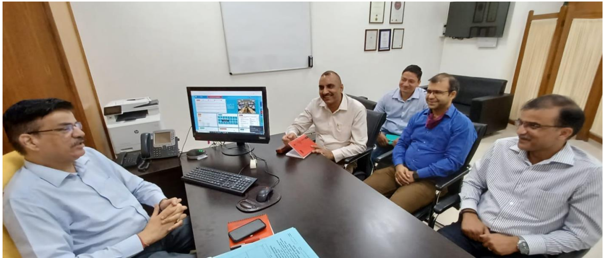
Pre-meeting discussion on e-Cabinet in the room of SIO Punjab at Punjab Civil Secretariat-I