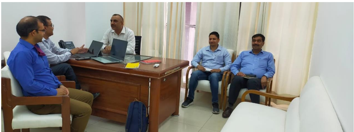
Set up e-Cabinet Solution by Uttrakhand Team in NIC Cell, CM Office Punjab