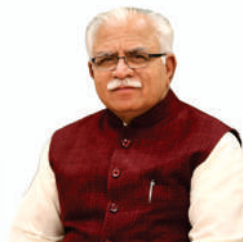
Manohar Lal Union Minister of Power and Housing & Urban Affairs