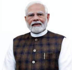
Narendra Modi Prime Minister