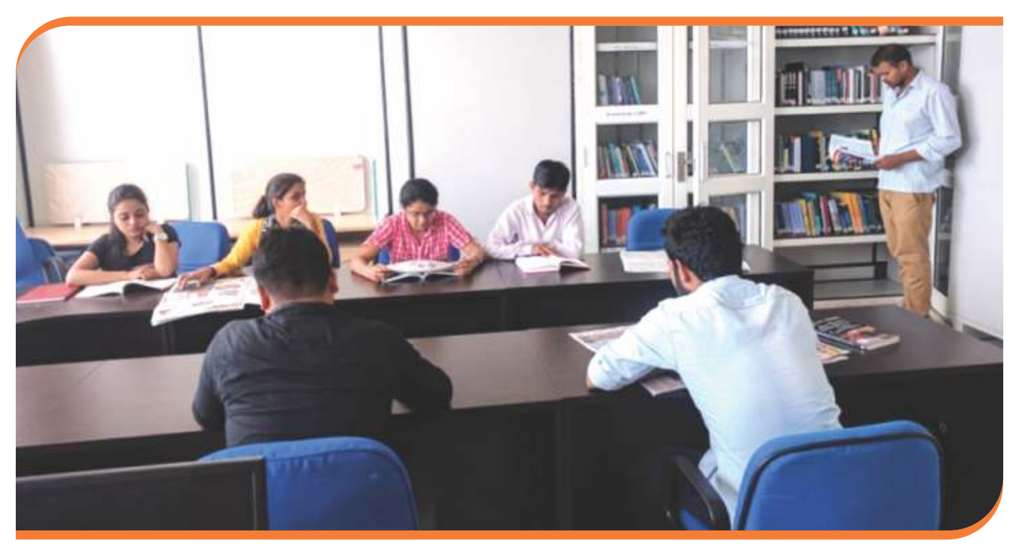
Library and Information Centre at ISLRTC