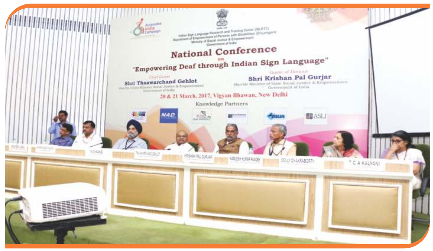
Dignitaries on the Dais during the National Conference by ISLRTC