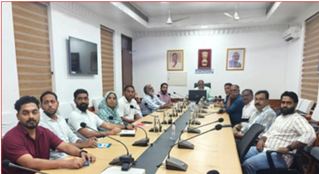
Photo: Participants during the programme.