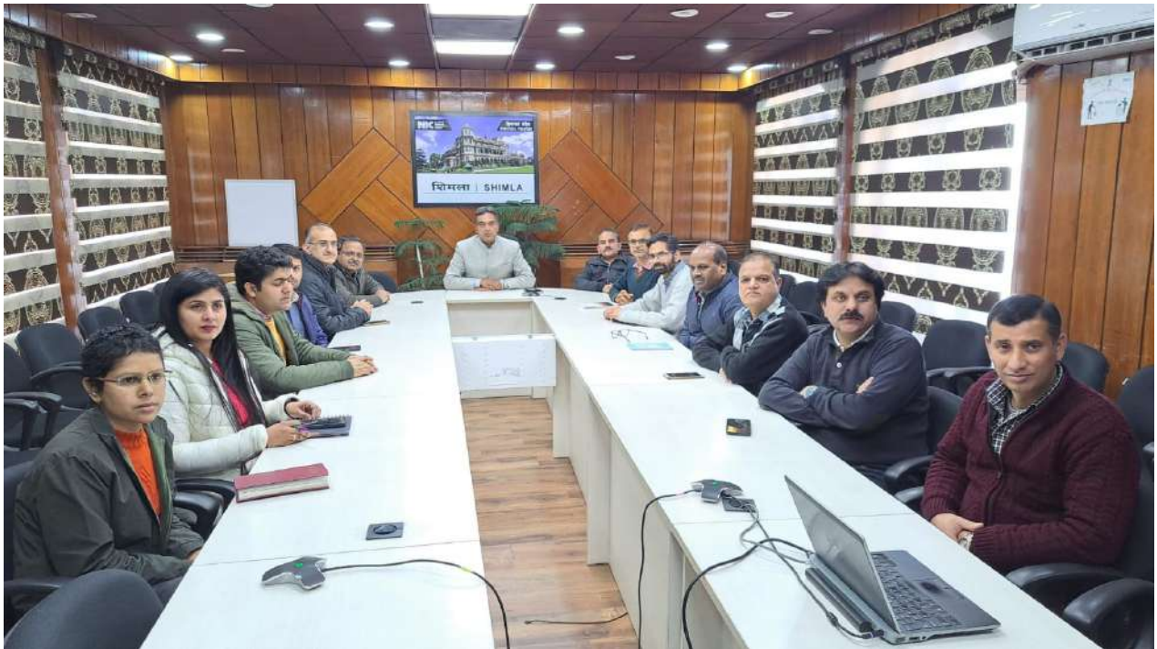
NIC HP SIO and State Centre officials connected through Video Conference