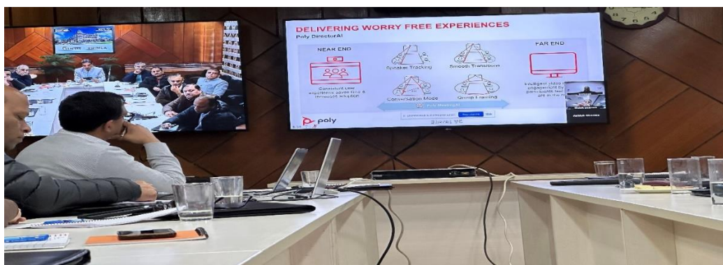
Polycom team presenting latest equipment for VC Systems