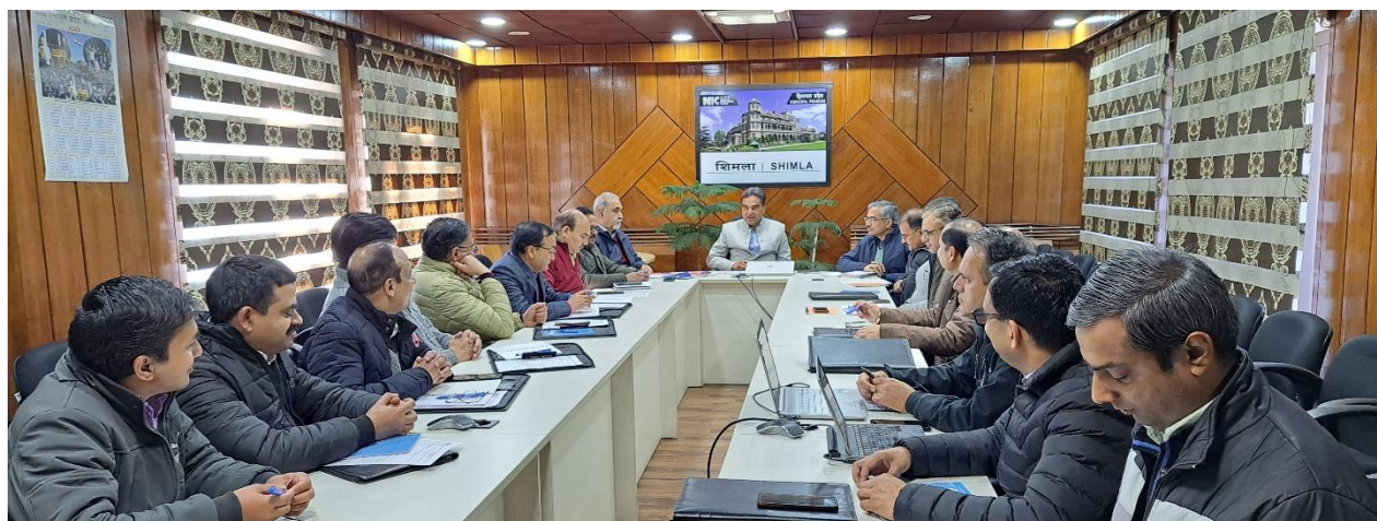
View of SIO HP, NIC DIOs, Group Heads and NIC State Centre officers in the Workshop

The DIOs workshop was held on 17th and 18th January, 2023. Besides reviewing the projects and activities of Districts, technical sessions were arranged through Microsoft, HP, Polycom, CDAC & EDB for the benefit of all NIC HP officers. The idea is to encourage technical expertise and knowledge of NIC officers.