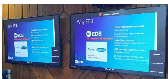
EDB team presenting PostgreSQL Solutions