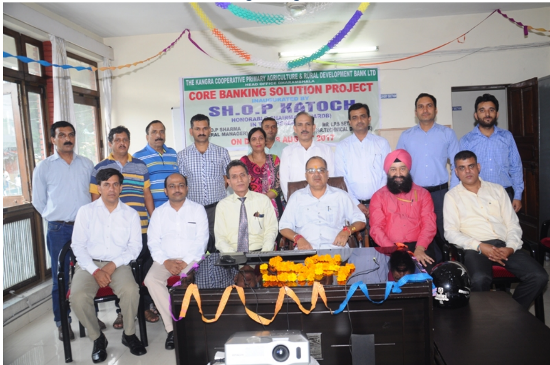
Group Photograph of the officers attending the Launch Ceremony