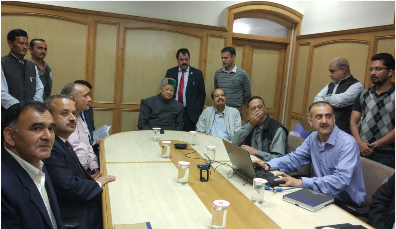
Sh. Virbhadra Singh, Hon'ble Chief Minister, Himachal Pradesh Launching the Online Donations to CM Relief Fund SW of NIC HP at Shimla