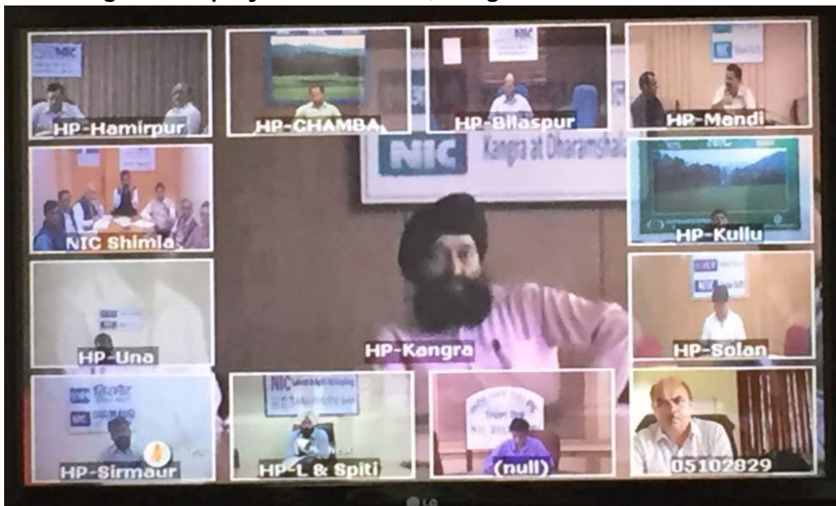
Video Conferencing Session in Progress-Remote Districts/Sites on TV