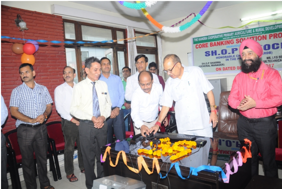
Chairman of the KPARDB Bank inaugurating the CCBS Solution at Dharamshala