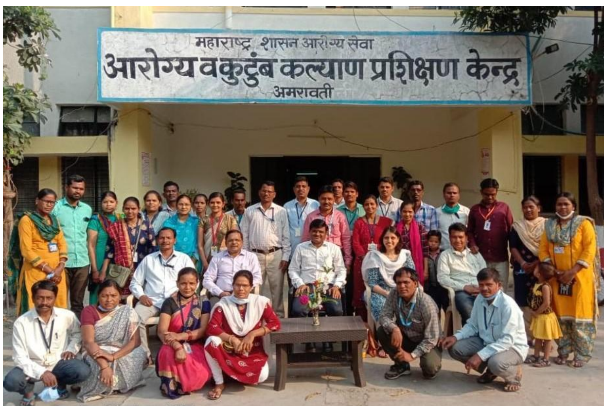
HRH Boot Camp at New Delhi – 27 th to 29 th September 2021