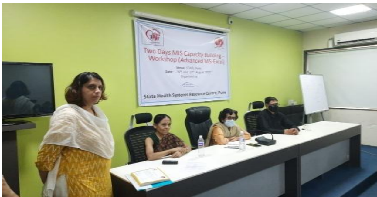
Capacity building of Counsellors in Melghat