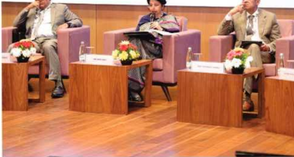
16-17 March 2024, Justice Hima Kohli participates as a panellist in the session on 'Protecting and Enforcing IP in New Digital Ecosystems' at the International Judicial Conclave on Intellectual Property Rights hosted by the High Court of Delhi

Large Language Models with billions/trillions of parameters have opened a new era in which generative AI models can write engaging text, paint photorealistic images and create videos.