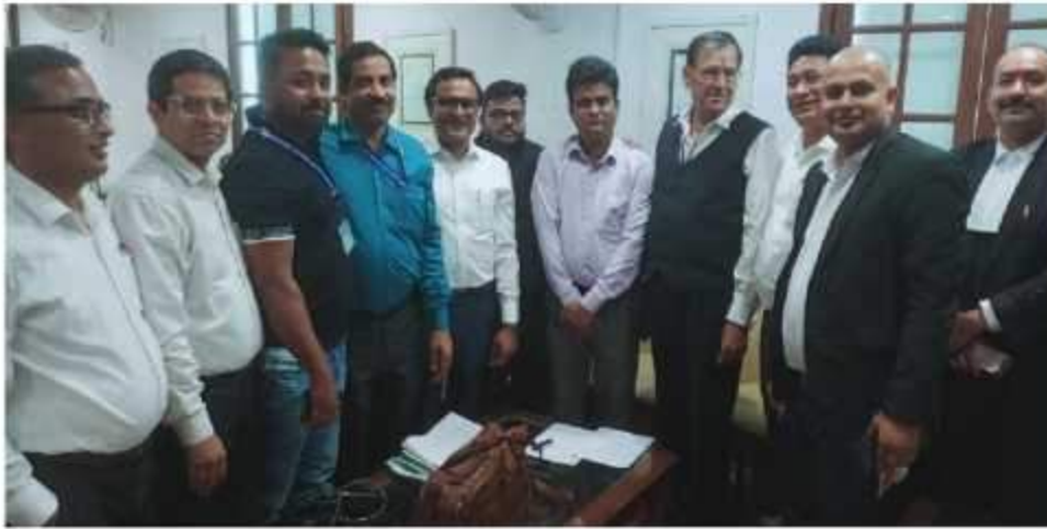
20-21 March 2024, the Supreme Court Bar Association organises a special camp drive for registration/ modification of Voter Identity Cards for its members with the assistance of the office of the Electoral Registration Officer, Assembly Constituency-40, Jam Nagar House, New Delhi