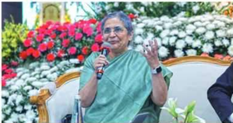
2 March 2024, Justice Bela M Trivedi, delivers an address during Session-I on 'Role of the district judiciary as the first responder of the judicial domain' at the All India District Judges' Conference, Kachchh, Gujarat

'We can perceive our commitments from the oath we take either during our appointments or elevations, that we will discharge our duties, dutifully and faithfully, without fear and favour, affection or ill will.'