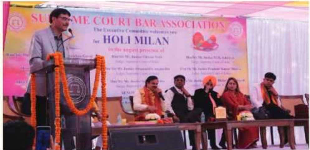
22 March 2024, the Supreme Court Bar Association hosts a Holi Milan Program on the Supreme Court Lawn

On 22 March, 2024 at 3:10 PM, the Supreme Court Bar Association hosted a vibrant Holi Milan Program in the lush environs of the Supreme Court Lawn. Among the esteemed guests were distinguished Judges of the Supreme Court of India including Justice B R Gavai, Justice Vikram Nath, Justice M M Sundresh, Justice Sanjay Karol, Justice Ahsanuddin Amanullah, Justice Prashant Kumar Mishra, Justice K V Viswanathan, Justice Sandeep Mehta, and Justice Prasanna Bhalachandra Varale.