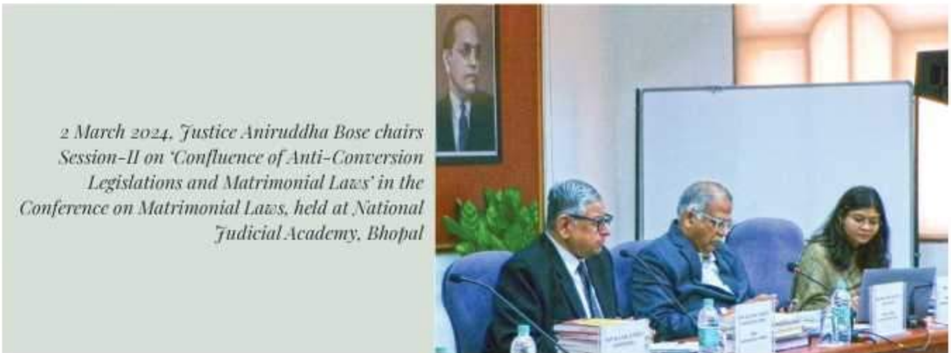
2 March 2024, Justice Aniruddha Bose chairs Session-II on 'Confluence of Anti-Conversion Legislations and Matrimonial Laws' in the Conference on Matrimonial Laws, held at National Judicial Academy, Bhopal