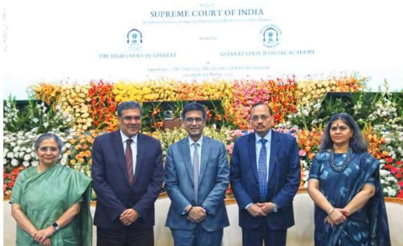
Left to Right: Justice Bela M Trivedi, Justice Sanjiv Khanna, the Chief Justice of India, Dr D Y Chandrachud, Justice Surya Kant and the Chief Justice of High Court of Gujarat, Justice Sunita Agarwal at the All India District Judges' Conference, Kachchh, Gujarat on 2 March 2024

The Chief Justice of India highlighted the vital role of the district judiciary as the backbone and central nervous system of the Indian judicial system. He emphasised the importance of addressing challenges faced by the district judiciary and encouraged direct conversations with judicial officers for solutions. He addressed the various concerns such as the adjournment