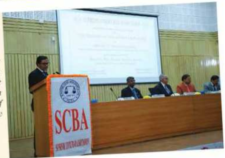
11 March 2024, the Supreme Court Bar Association hosts a lecture on 'The Mediation Act, 2023 and the Legal Profession' at V K Krishna Menon Bhawan, Indian Society of International Law