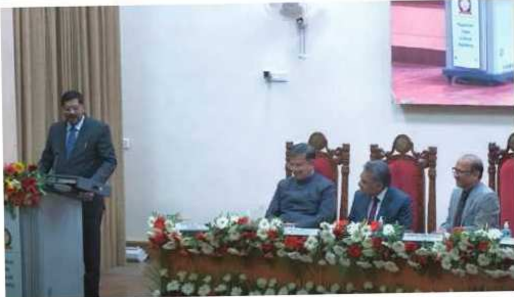
16 March 2024, Justice B R Gavai attends a One-Day Law Seminar on "Constitutional Governance in India – Dr B R Ambedkar Idea of Socio-Economic Justice and Social Engineering through Judicial Activism" at State Judicial Academy, Jodhpur, Rajasthan