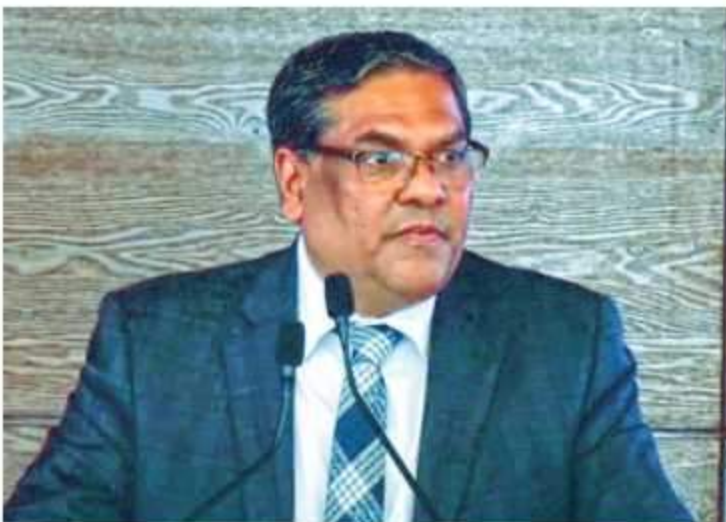
7 March 2024, Justice Sanjiv Khanna, Chief Guest, inaugurates the Master Class on Intellectual Property Adjudication - Judicial Perspectives organised by the High Court of Delhi and World Intellectual Property Organisation (WIPO) in New Delhi