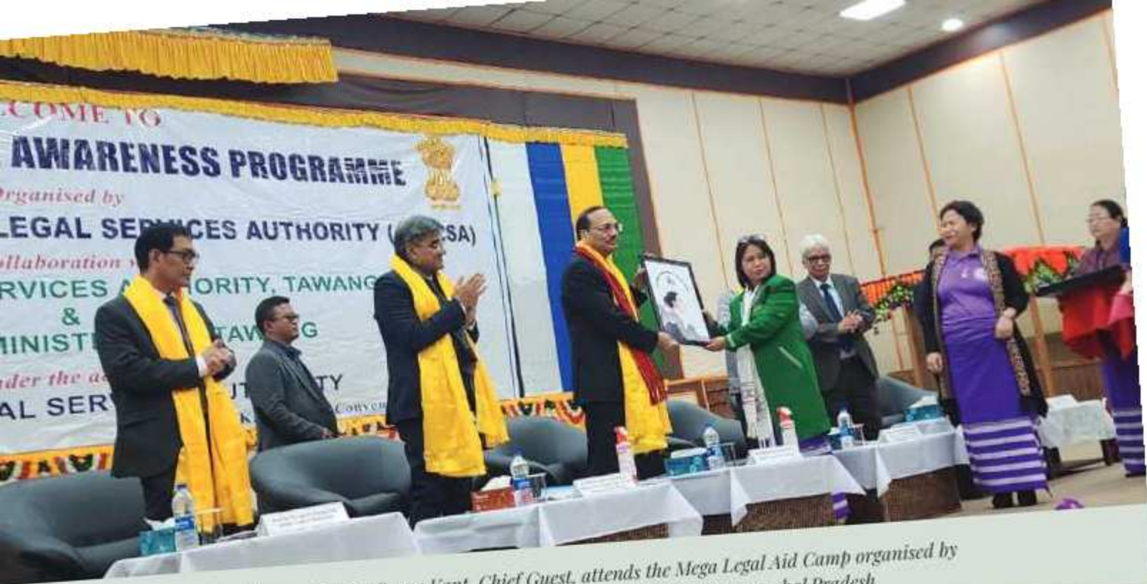
24 March 2024, Justice Surya Kant, Chief Guest, attends the Mega Legal Aid Camp organised by Arunachal Pradesh Legal Services Authority at Itawang, Arunachal Pradesh