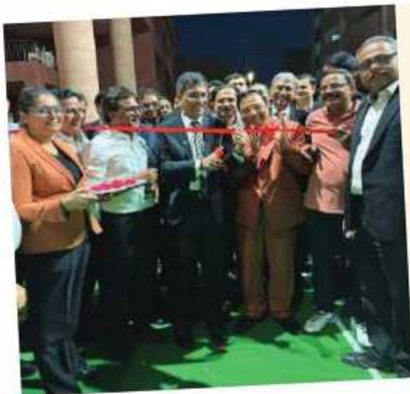
20 March 2024, the Chief Justice of India, Dr D Y Chandrachud, along with the Supreme Court Bar Association inaugurates the Badminton Court for the lawyers, in D-Block, Additional Building Complex, Supreme Court of India