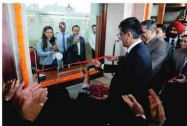
21 March 2024, the Chief Justice of India, Dr D Y Chandrachud, along with Justice Sanjiv Khanna, inaugurates the newly created Accessibility Help Desk, near e-Sewa Kendra, Supreme Court of India