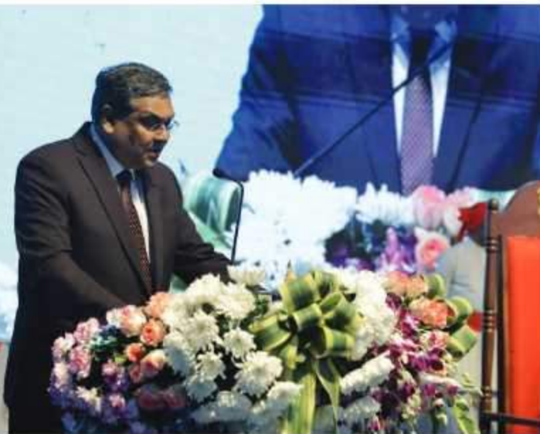
2 March 2024, Justice Sanjiv Khanna, addresses judicial officers during the inaugural session of the All India District Court Judges' Conference, Kachchh, Gujarat

Three sessions were organised to tackle critical aspects of the judicial system: (1) the role of the district judiciary as first responder of the judicial domain, (2) infrastructure and resources, and (3) the use of technology in the judicial processes.