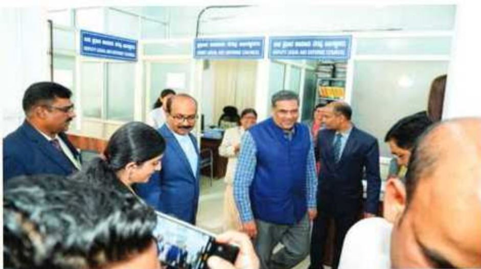
23 March 2024, Justice Sanjiv Khanna engages with the Chief, Deputy, and Assistant Legal Aid Defence Counsels alongside other panel lawyers and paralegal volunteers during his visit to the City Civil Court in Bengaluru