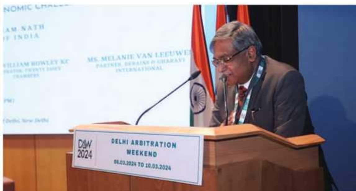
8 March 2024, Justice Vikram Nath, chairs Session-IV on 'Where do we stand?: Revisiting the Investor-State Dispute Settlement (ISDS) mechanisms in light of today's economic challenges' at DAW, 2024