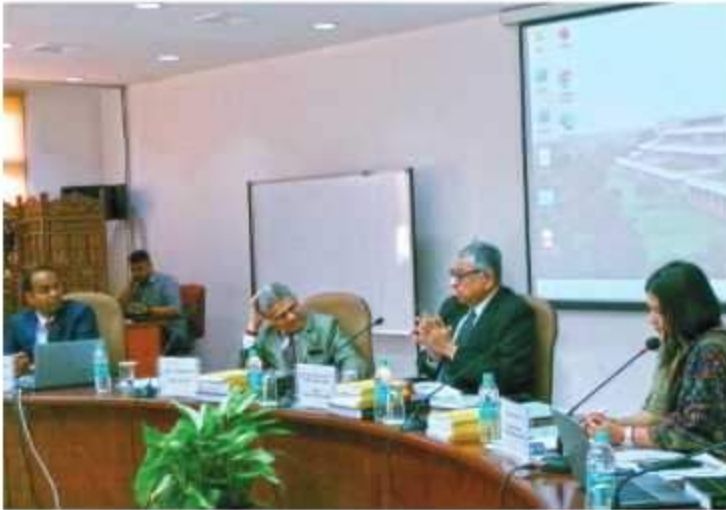
2 March 2024, Justice Aniruddha Bose chairs Session-I on 'Writ Jurisdiction- Nature, Scope and Limits' at the National Workshop For High Court Justices on Constitutional Remedies and Administrative Law, held at National Judicial Academy, Bhopal