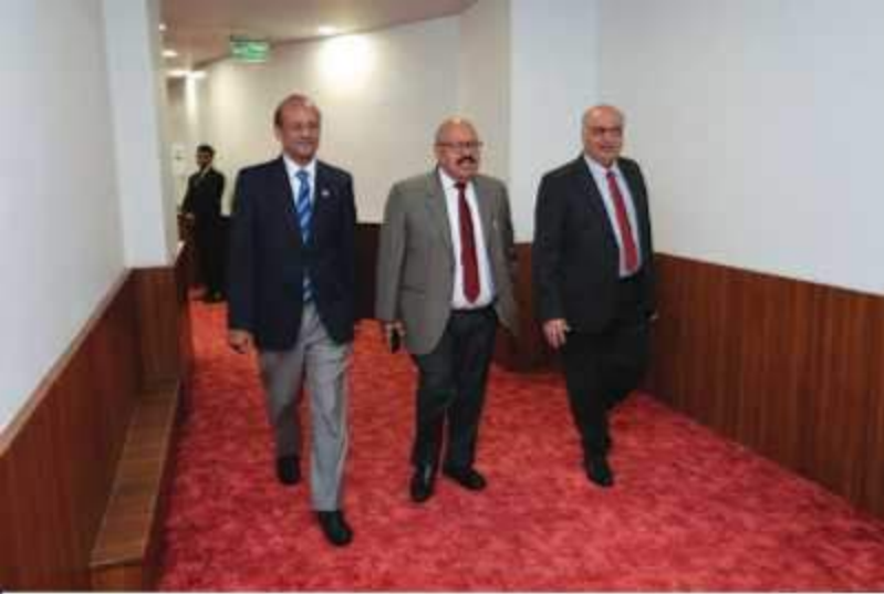
Left to right: Justice Rajesh Bindal, Justice Hrishikesh Roy, and Justice Ahsanuddin Amanullah proceeding to the Supreme Court Auditorium for the Inaugural Session of the DAW 2024, on 6 March 2024