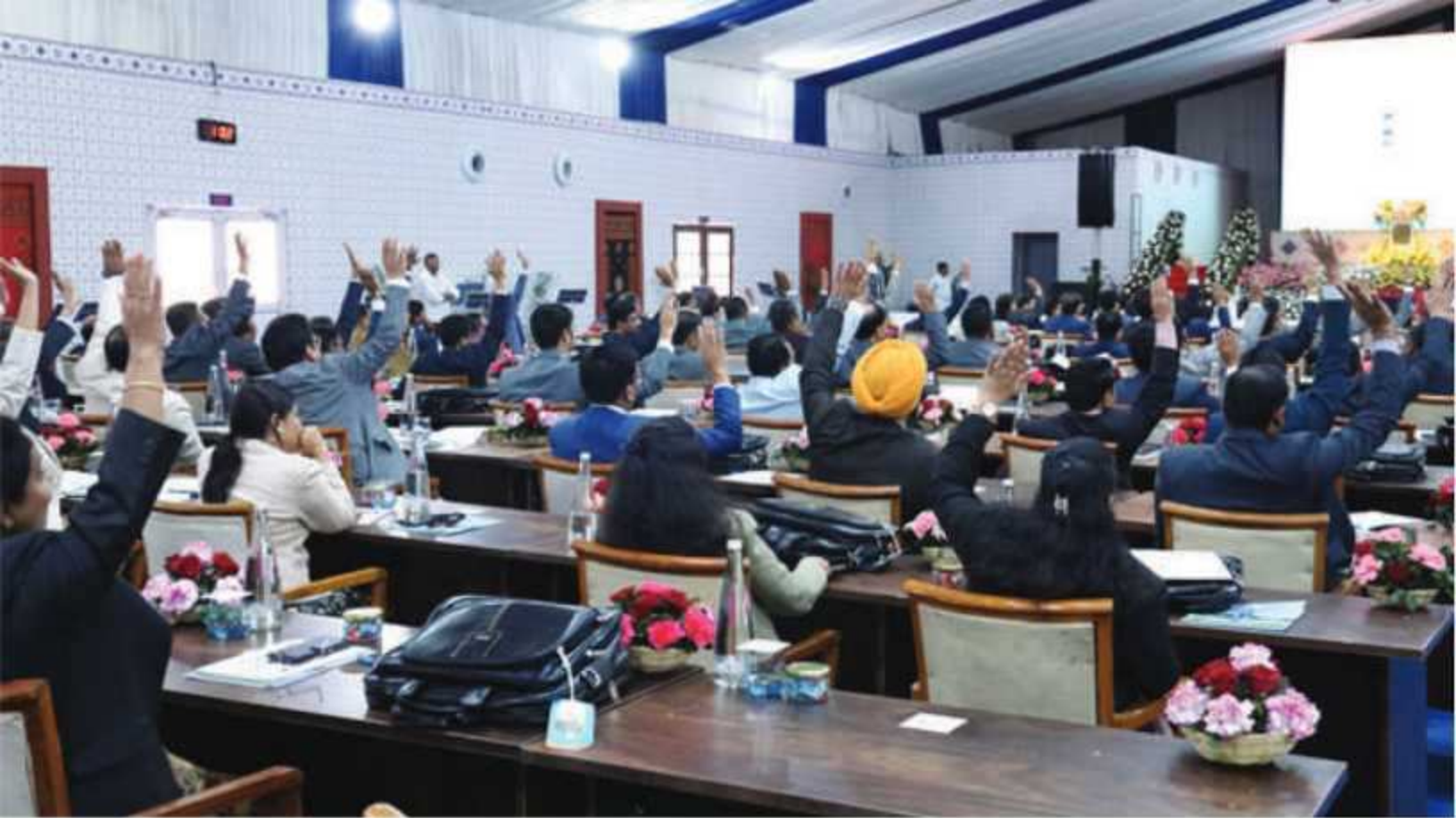
2 March 2024, Judicial officers interact with Supreme Court Judges at the All India District Judges' Conference, Kachchh, Gujarat