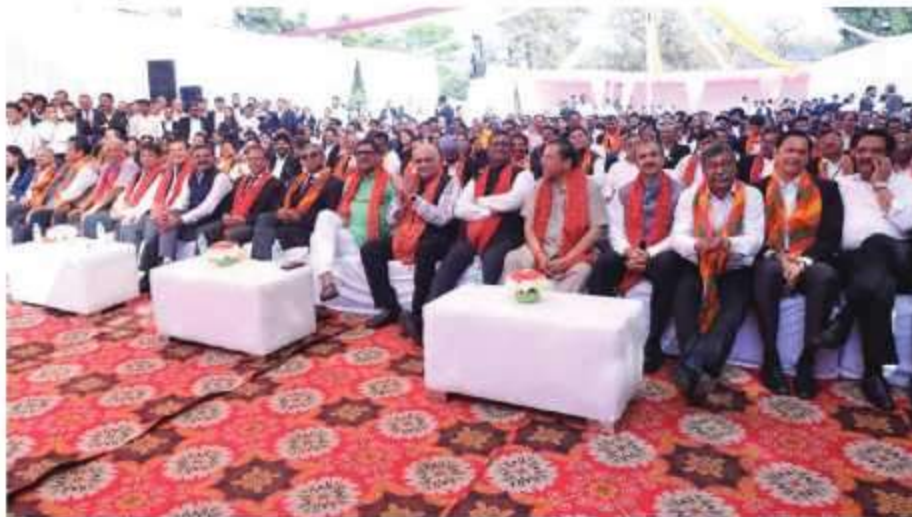
22 March 2024, Judges of the Supreme Court at the Holi Milan program organised by the Supreme Court Bar Association