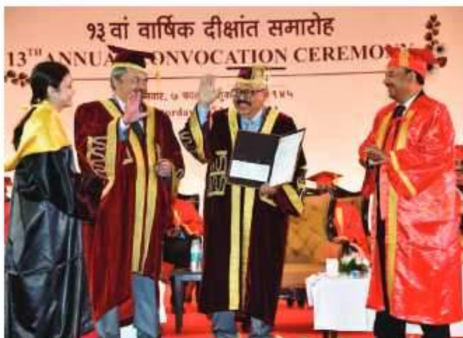
16 March 2024, Justice Hrishikesh Roy attends the 13th Convocation Ceremony of National Law Institute University (NLIU), Bhopal, held at the Justice J S Verma Memorial Convention Centre