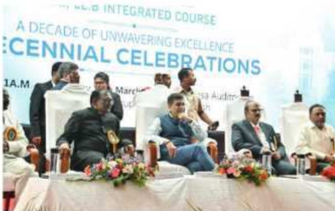
26 March 2024, Chief Justice of India, Dr D Y Chandrachud attended the decennial celebrations of the introduction of BA LLB course at Sri Venkateswara University's Department of Law, Tirupati. While addressing the students he reflected on his days at Delhi University and urged them to engage in discussions around global problems. He emphasised on the necessity of free and critical thinking in becoming efficient lawyers.