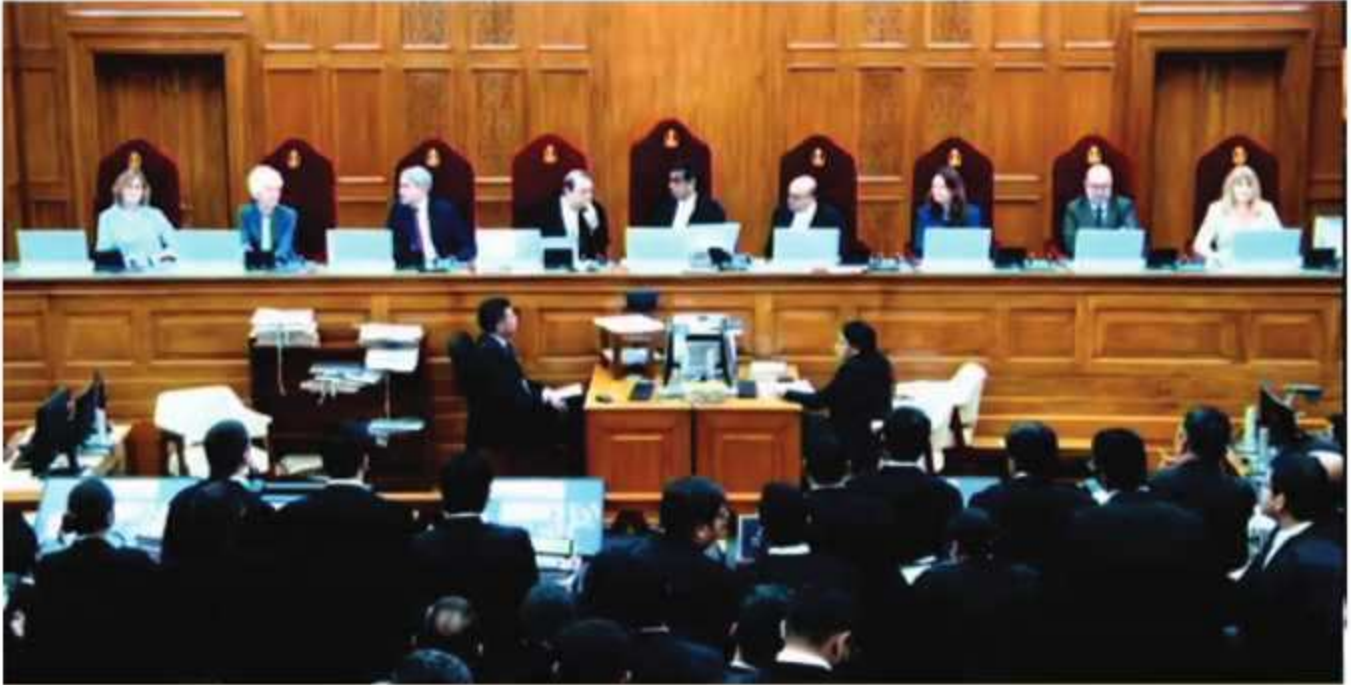
7 March 2024, the delegates for Bilateral Judicial Dialogue - Indo-German Conference, share the dias with the Supreme Court Judges as observers, during the Court proceedings