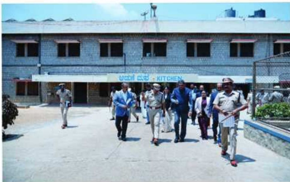
23 March 2024, Justice Sanjiv Khanna, Executive Chairman, NALSA visits the Parappana Agrahara Central Prison, Bengaluru. Justice Khanna also visits the barracks for the inmates, the prison hospital, the kitchen, the vocational training centre and the Legal Services Clinic etc. housing around 5000 inmates including convicts and undertrials

civil matters. Many recovery issues involving financial institutions, banks, government entities, and private companies were resolved before they reached litigation. In a significant achievement, a grand total of 3,11,98,807 cases were settled, comprising 38,67,082 pending cases and 2,73,31,725 pre-litigation cases, with the aggregate settlement amount reaching Rs. 17,482.47 crores.