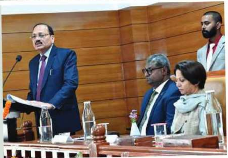
16 March 2024, Justice Surya Kant, Chief Guest, delivers a valedictory address at the 7th Edition of Arguendo at the University Institute of Legal Studies (UI.S), Panjab University (PU)