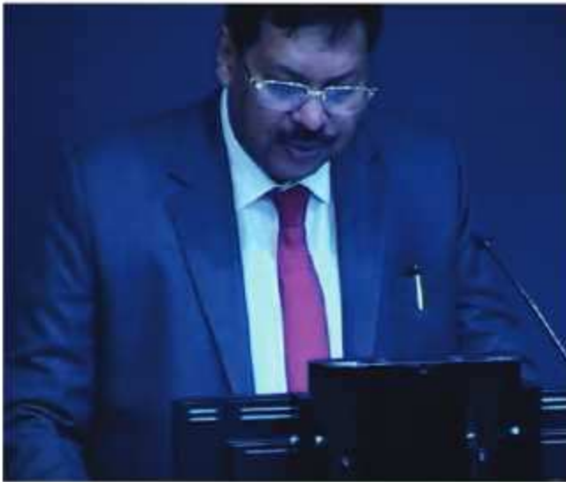
26 March 2024, Justice B R Gavai, delivers a lecture on '75 Years of Transformative Constitutionalism,' at the Columbia Law School, New York