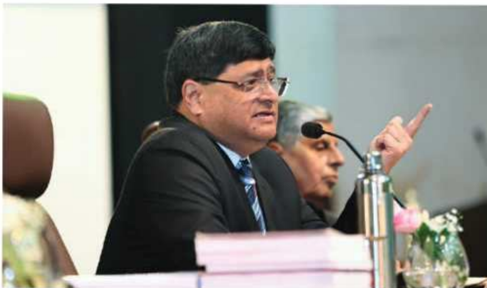
16 March 2024, Justice Sudhanshu Dhulia presides over Session-II on 'Elements of Judicial Behaviour' at the North Zone-II Regional Conference on 'Contemporary Judicial Developments and Strengthening Justice through Law and Technology, NJA, Bhopal

over Session-II on 'Elements of Judicial Behaviour' and Justice Dipankar Datta was the resource person in Session-III on the theme 'Judgment Writing Tool.' On 17 March 2024, Justice Bindal presided over Session-IV on the theme 'Overview of E-courts Projects' as the resource person.