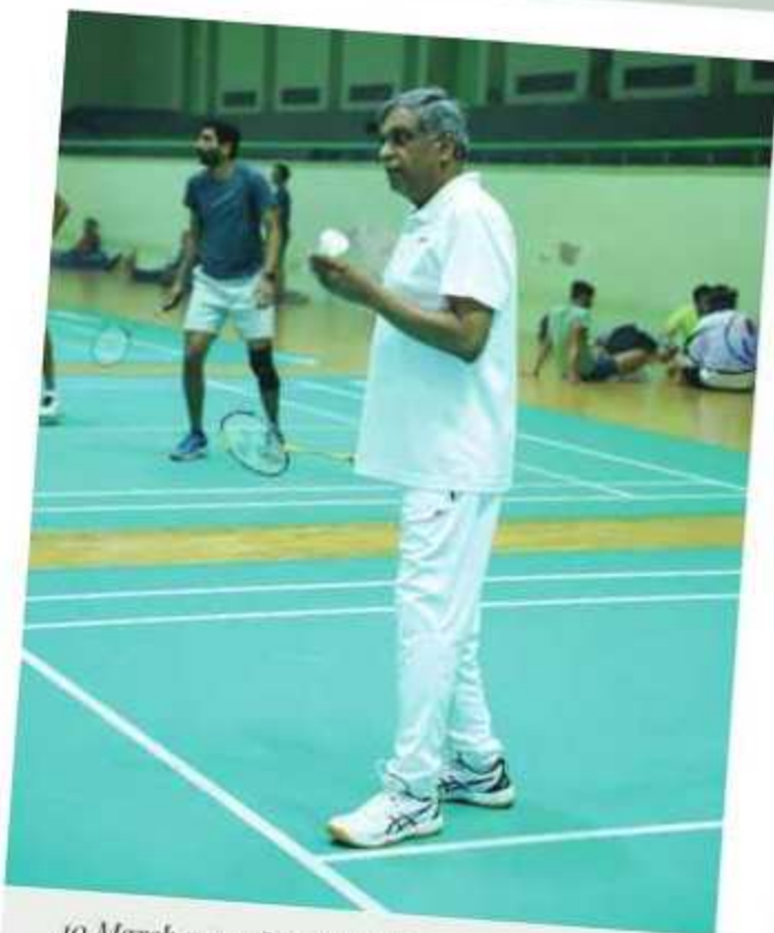
10 March 2024, Justice Vikram Nath playing a friendly Badminton (Doubles) match during the Badminton (Singles and Doubles) competition held at Siri Fort Sports Complex