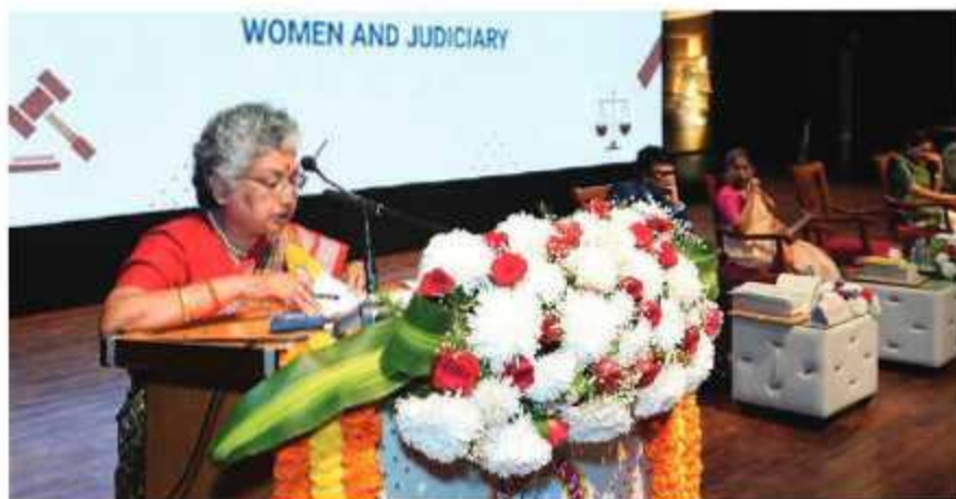
23 March 2024, Justice B V Nagarathna, presides over Session - I on 'Women and Judiciary' at the 21st Biennial State Level Conference of Judicial officers organised by Karnataka State 'Judicial Officers' Association held at Dr Babu Rajendra Prasad International Convention Centre, GKVK, Yelahanka Road, Bengaluru