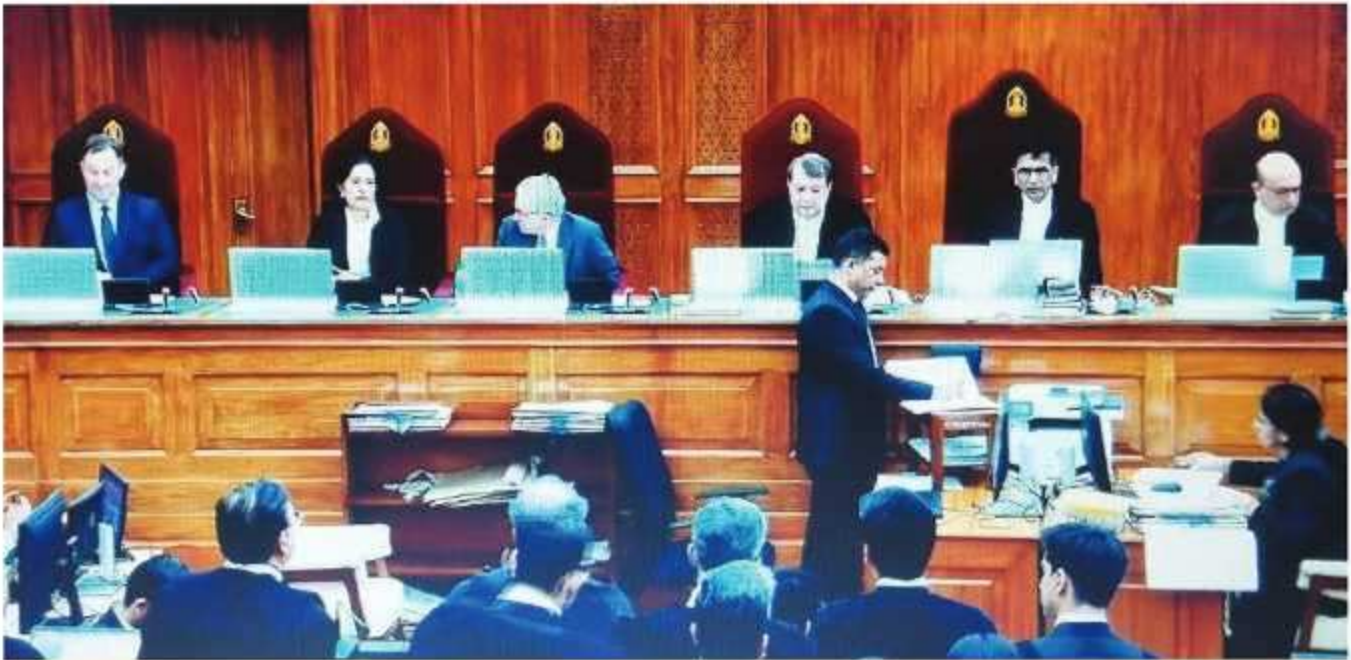
15 March 2024, the delegates for 12th Indo-British Legal Forum Meet, share the dias with the Supreme Court Judges as observers, during the Court proceedings