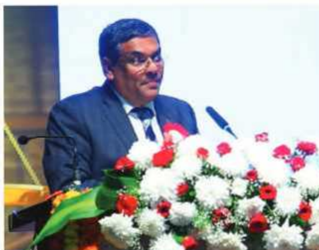
24 March 2024, Justice Sanjiv Khanna, delivers the valedictory address at the 21st Biennial State Level Conference of the Judicial Officers organised by Karnataka State 'Judicial Officers' Association held at Dr Babu Rajendra Prasad International Convention Centre, GKVK, Yelahanka Road, Bengaluru