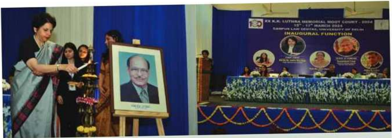
15 March 2024, Justice Hima Kohli, Chief Guest, attends the 20th K K Luthra Memorial Moot Court Competition, 2024 at Campus Law Centre, Delhi University