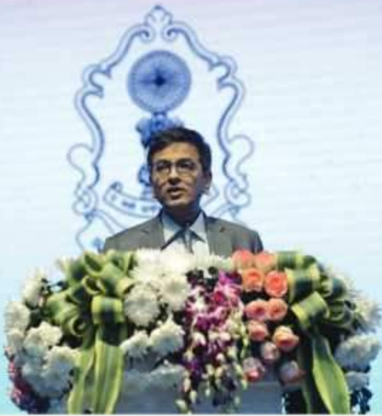
2 March 2024, the Chief Justice of India, Dr D Y Chandrachud, addresses judicial officers during the inaugural session of the All India District Judges' Conference at Kachchh, Gujarat

"Today is an extraordinary day for me personally, this is because I am present amongst the judicial officers of the district judiciary from across the country. The District Judiciary has always been said to form the backbone of our legal system. It is not just a backbone, the district judiciary, I believe, is the central nervous system of the Indian judiciary. The District judiciary represents the eyes, the ears, and the voice of the Indian Judicial system. Together, the Supreme Court, the High Courts and the District Judiciary represent the soul of the Indian Judiciary and our commitment to the rule of law."