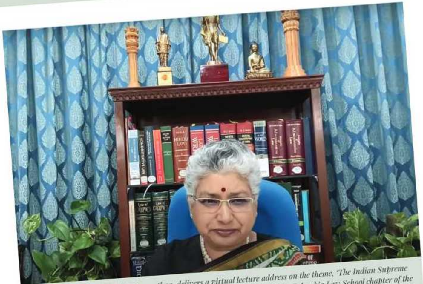
25 March 2024, Justice B V Nagarathna, delivers a virtual lecture address on the theme, 'The Indian Supreme Court and Social Justice: A 75-Year History' in the Symposium organised by Columbia Law School chapter of the American Constitution Society