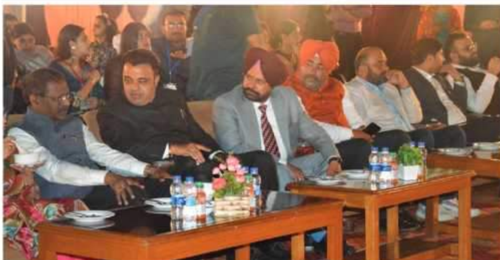
16 March 2024, Justice C T Ravikumar, Chief Guest, attends the inaugural ceremony of National Law Fest, Rayat College of Law, Ropar, Punjab