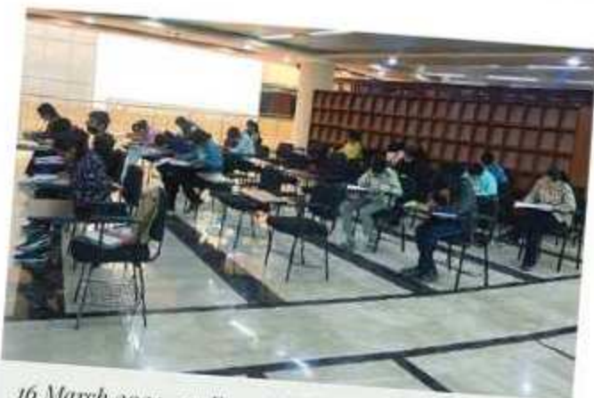
16 March 2024, an Essay Writing competition held at the Supreme Court Judges' Library for the children of Supreme Court employees