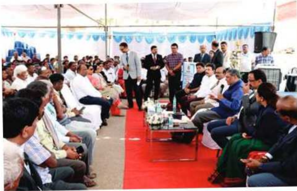
25 March 2024, Justice Sanjiv Khanna, Executive Chairman, NALSA, inaugurates Legal Services Clinic at the Panchayat Bhatvan in Jalige Village, Kundana Hobli, Devanahalli Taluk, Bengaluru Rural District. Justice Khanna informs the villagers about the diverse legal services available through Legal Services Institution including the NALSA Helpline and the National Lok Adalats and exhorting them to resort to ADR mechanism to solve disputes