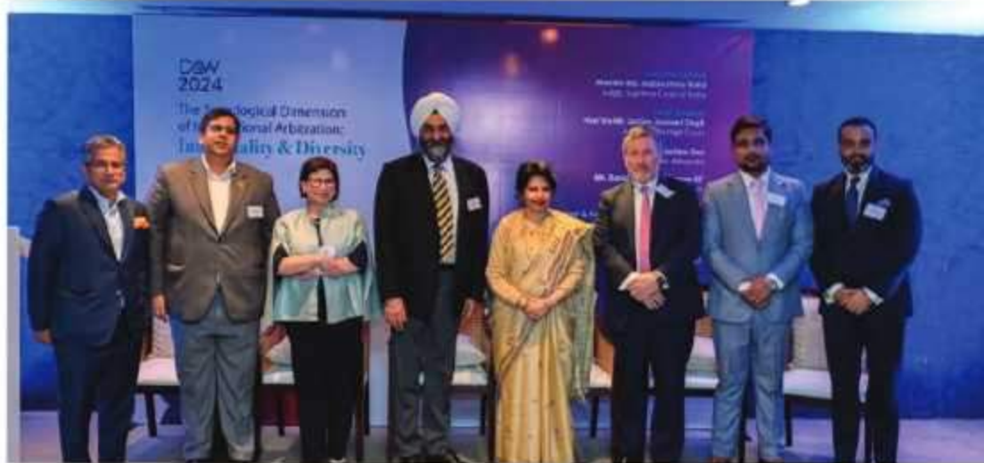
5 March 2024, Justice Hima Kohli, delivers a keynote address in the Pre DAW Session - II on 'Sociological Dimension of International Arbitration: Impartiality and Diversity'

On 6 March 2024, the Chief Justice of India, Dr D Y Chandrachud gave the plenary address in the inaugural session of the DAW conducted at the Auditorium Hall of the Additional Building Complex of the Supreme Court. During the inaugural ceremony, the Chief Justice also released the Delhi Arbitration Review, the official