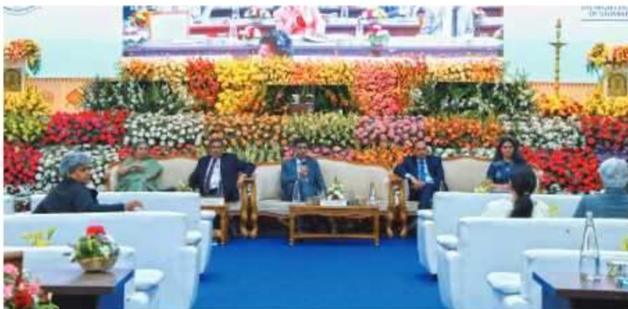
2 March 2024, the Chief Justice of India, Dr D Y Chandrachud alongside Supreme Court Judges and the Chief Justice of High Court of Gujarat, engages with the judicial officers during Session-I of the All India District Judges' Conference, Kachchh, Gujarat

'We can perceive our commitments from the oath we take either during our appointments or elevations, that we will discharge our duties, dutifully and faithfully, without fear and favour, affection or ill will.'