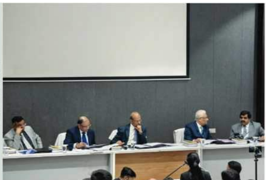
31 March 2024, Justice Rajesh Bindal, delivers a valedictory address and adjudicates the final round of the 2nd NFSU National Technological Moot Court Competition 2024, organised by the National Forensic Sciences University, Gandhinagar