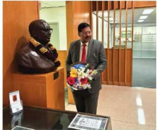
26 March 2024, Justice B R Gavai, visits the Dr Ambedkar statue at Columbia Law School, New York highlighting Dr Ambedkar's academic achievement at the institution where his sculpture now stands as a tribute