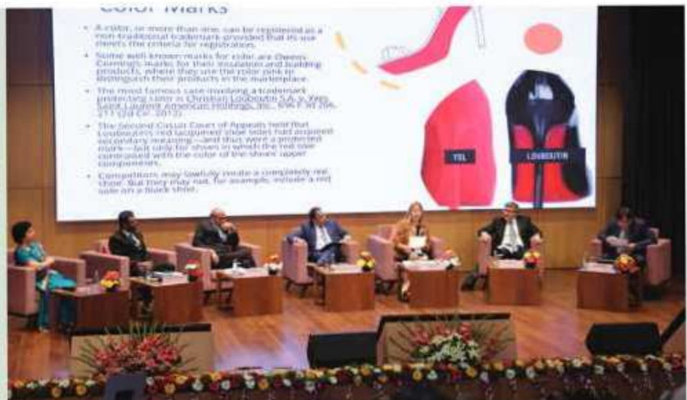
16-17 March 2024, Justice K V Viswanathan participates as a panellist in the session on 'New Frontiers of Trademark Law' at the International Judicial Conclave on Intellectual Property Rights hosted by the High Court of Delhi