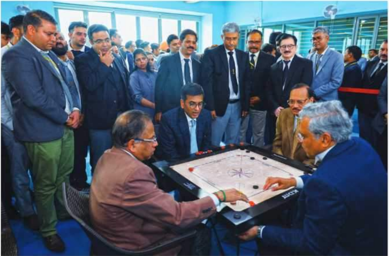
20 March 2024, the Chief Justice of India, Dr D Y Chandrachud alongside Judges of the Supreme Court engage in a friendly Carrom match during the Carrom (Male and Female) competition at the Additional Building Complex of the Supreme Court