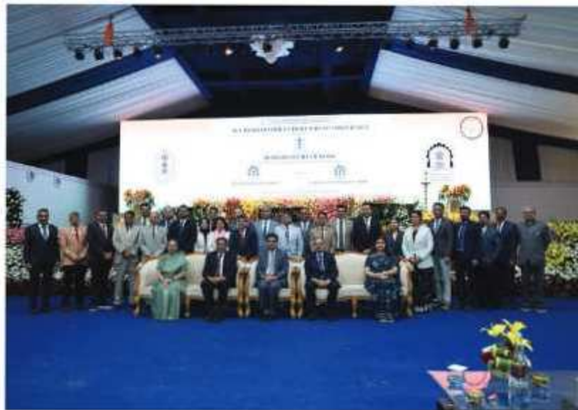
Group photo featuring the Chief Justice of India, Dr D Y Chandrachud, the Judges of the Supreme Court, the Chief Justice of High Court of Gujarat, Registry officers, Supreme Court of India and others at the All India District Judges' Conference, Kachchh, Gujarat