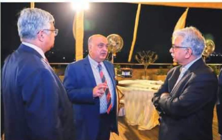
16 March 2024, Justice Ahsanuddin Amanullah, at the International Judicial Conclave on Intellectual Property Rights, hosted by the High Court of Delhi