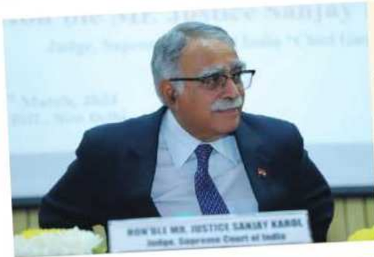
11 March 2024, Justice Sanjay Karol, Chief Guest, attends a lecture on 'The Mediation Act, 2023 and the Legal Profession,' organised by the Supreme Court Bar Association (SCBA) at V K Krishna Menon Bhawan, Indian Society of International Law, New Delhi