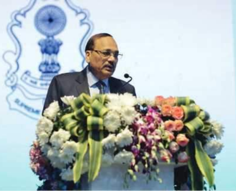
2 March 2024, Justice Surya Kant, addresses judicial officers during the All India District Court Judges' Conference, Kachchh, Gujarat

"In our judiciary set-up, the district judiciary acts as a primary interface between litigants and justice delivery and it is here that the majority of the cases are reshaping and adjudicating.. Judges must constantly and compulsorily continue to improve their judicial and administrative skills to discharge functions efficiently."