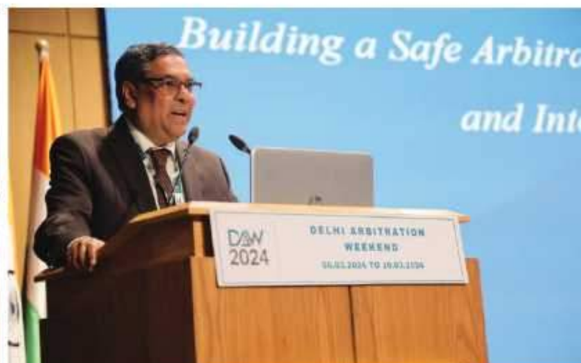
10 March 2024, Justice Sanjiv Khanna, addresses the audience on 'Building a Safe Arbitration Seat: Harmonising National Interest and International Expectations' at the closing session of DAW, 2024