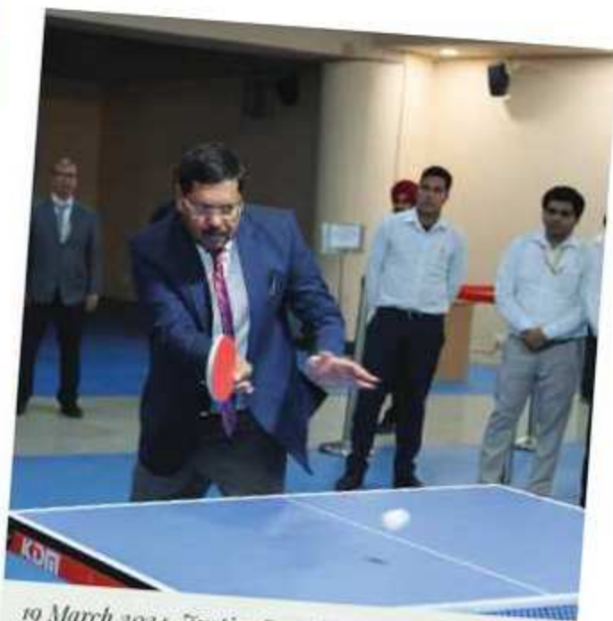
19 March 2024, Justice B-R Gavai playing a friendly Table Tennis match during the Doubles Table Tennis (Male) competition, at the Additional Building Complex of the Supreme Court