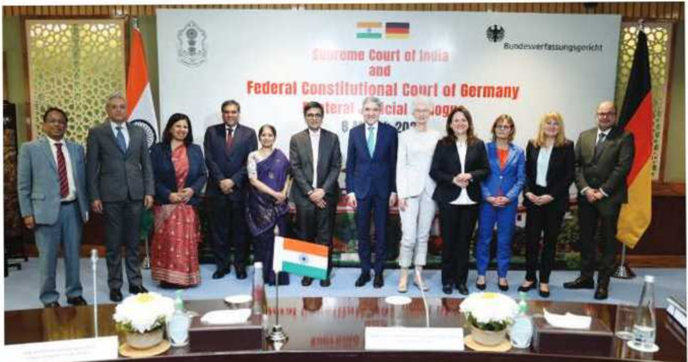
8 March 2024, the Chief Justice of India, Dr D Y Chandrachud, Justice Sanjiv Khanna, Justice P S Narasimha, and Justice K V Viswanathan, along with other dignitaries at the Bilateral Judicial Dialogue - Indo-German Conference held at the Supreme Court of India, New Delhi