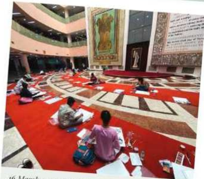
16 March 2024, Painting/Drawing Competition held at the Supreme Court Judges' Library for the children of Supreme Court employees