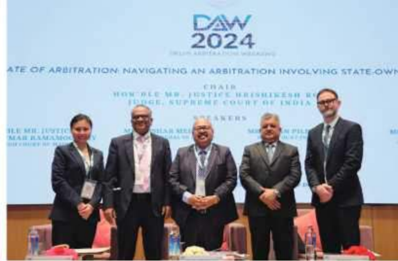
8 March 2024, Justice Hrishikesh Roy, chairs Session-I on 'The State of Arbitration: Navigating an Arbitration Involving State-owned Entities' at DAW, 2024