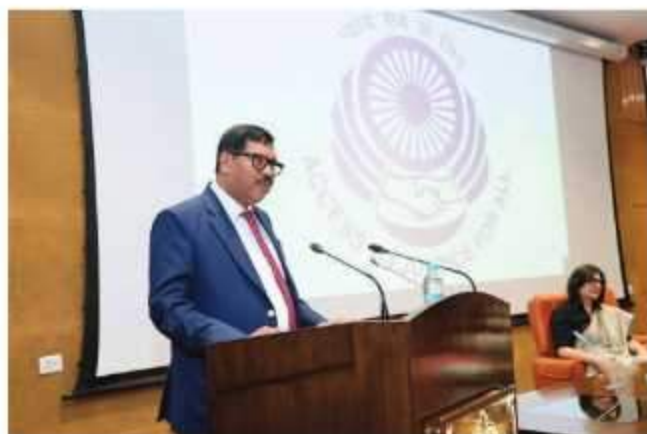
19 March 2024, Justice B R Gavai, chairs a workshop for Panel Lawyers of the Supreme Court Legal Services Committee (SCLSC) organised by SCLSC at the Additional Building Complex, Supreme Court of India

Justice B R Gavai, Chairman, Supreme Court Legal Services Committee (SCLSC), chaired a training workshop held for the Advocates-on-Record (AOR) Panel of the SCLSC on 19 March 2024. The workshop aimed to enhance AORs' grasp of utilising digital tools in their practice, thereby improving the efficacy and accessibility of legal services. Justice Gavai emphasised the importance of establishing a video conferencing platform to facilitate communication between legal aid counsels and incarcerated individuals. Furthermore, the workshop addressed concerns regarding the quality of legal aid and outlined the strategies for promptly identifying and resolving legal aid challenges.