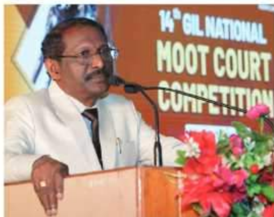
10 March 2024, Justice C.T. Ravikumar, Chief Guest, delivers a valedictory address at the 14th GIL National Moot Court Competition, 2024 organised by the Geeta Institute of Law, Panipat