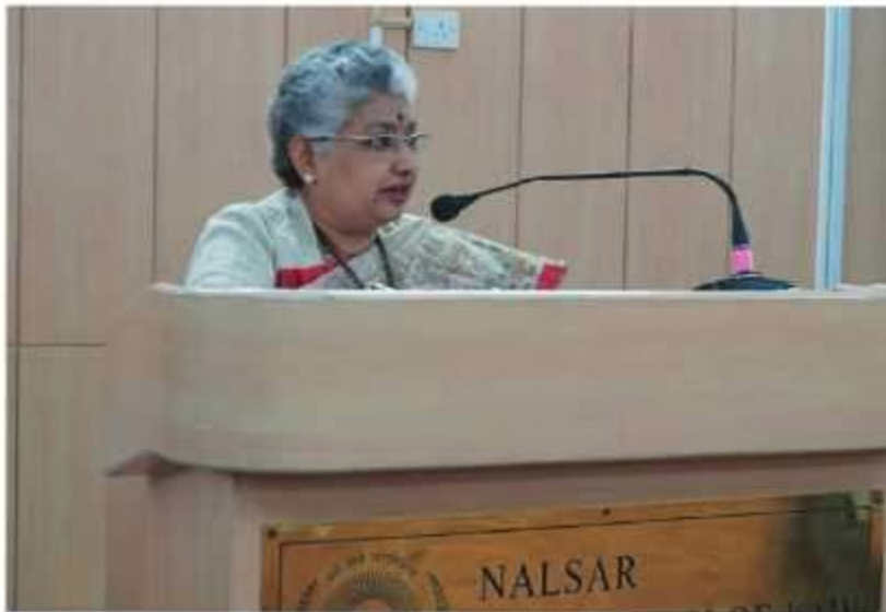
30 March 2024, Justice B V Nagarathna, delivers an inaugural address on 'Supreme Court in 2023' at the 'Courts and the Constitution-2023 in Review Conference' organised by the NALSAR University of Law, Bengaluru