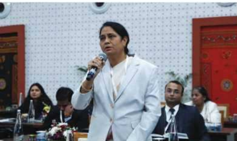
2 March 2024, a judicial officer presents her insights and suggestions in Session-II, focusing on 'Infrastructure and Resources – improving the work culture' at the All India District Judges' Conference, Kachchh, Gujarat