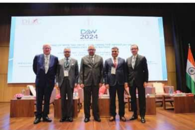
10 March 2024, Justice Aniruddha Bose, chairs Session-V on 'Keeping Up with the Tech – Exploring the Interplay of Technology and Arbitration' at DAW, 2024