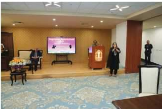
23 March 2024, Justice Hrishikesh Roy, attends the Antakshari (Male and Female) competition at the Congregation Hall, Supreme Court