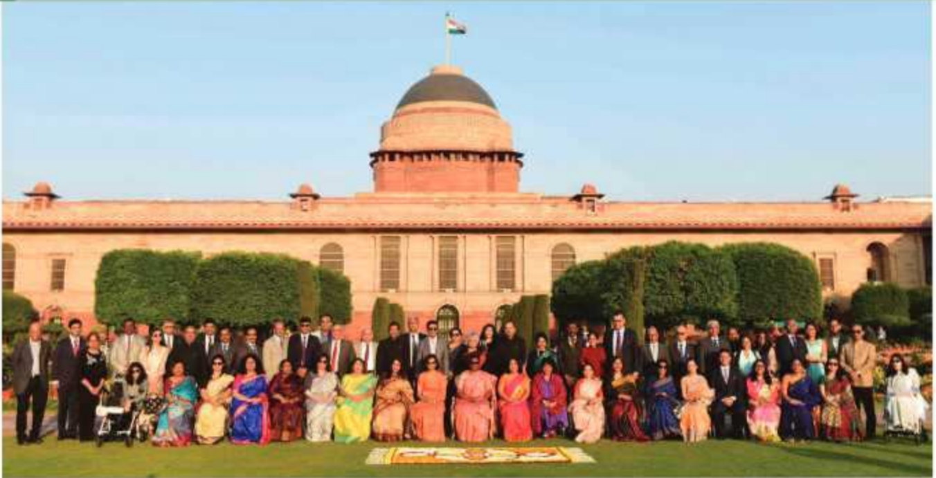
4 March 2024, the Chief Justice of India, Dr D Y Chandrachud, along with other Supreme Court judges, and their families, visit the Amrit Udyan at the Rashtrapati Bhavan