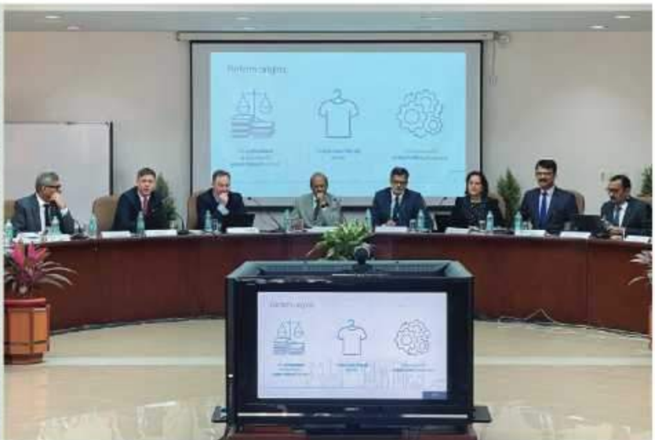
10 March 2024, Justice Rajesh Bindal presides over Session-II on the theme "Security Concerns: Institutional and Individual" as a resource person in the International Conference of the National Judicial Academy (NJA) on "The implications and ramifications of Information and Communication Technology (ICT) on Re-engineering Judicial Process through Information and Communication Technology (ICT)" organised in collaboration with the Ministry of Justice (MoJ), United Kingdom, at Bhopal