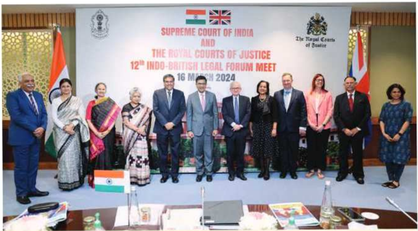
16 March 2024, the Chief Justice of India, Dr D Y Chandrachud, Justice Sanjiv Khanna, and Justice B V Nagarathna along with other dignitaries at the 12th Indo-British Legal Forum Meet held at the Supreme Court of India, New Delhi