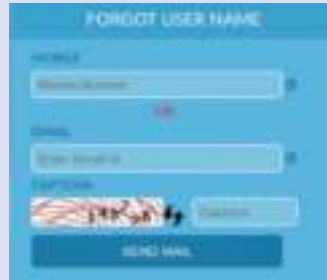
Fig 9 Forgot user name screen

In case a User has forgotten his User Name he used to register on this website, he can press the 'Forgot username' option on Log in screen to retrieve the same at Fig 1 as provided. This opens a new screen which requires User to fill in his registered mobile number and registered e-mail address. A User needs to enter the captcha code shown and press the Send Mail button to receive the User name on his registered e-mail address.