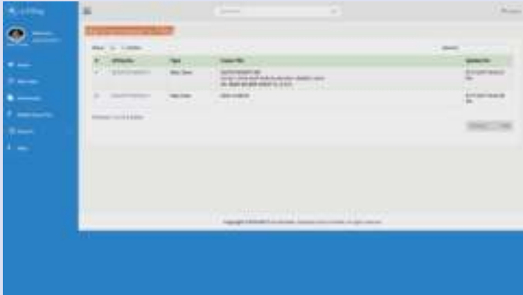
Fig 54 Idle/unprocessed cases screen

The cases for which an e-filing number has been generated but user has not taken any action are reflected in this section. If a case e-filed has incurable defects, it may be shown in this section. (fig 52)