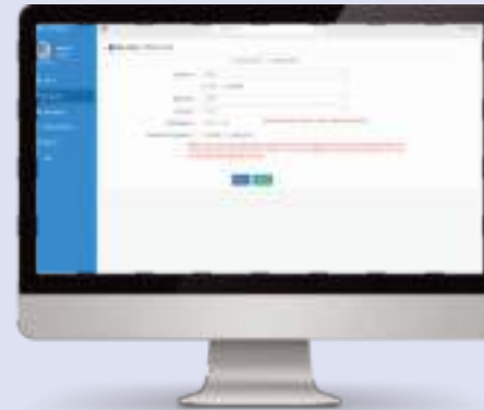
Fig 11 New Case> Where to file screen for High Court

On clicking 'New case' option in the left panel of the Dashboard screen, a screen 'Where to file' will be shown.