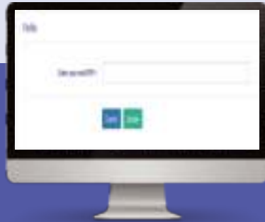
Fig 61 OTP validation to change email id of user