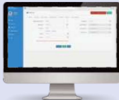
Fig 17 New Case > Subordinate court details

After completing 'Extra information', 'the Subordinate court' screen will open. A User must fill all mandatory fields and then submit the form such as name of subordinate Court, Case Registration number (CNR), type of case, case no/filing no, year of filing, name of Judge who passed the judgement that is being challenged in new case being e-filed, date of impugned decision, CC applied date and CC ready date as shown in fig 17.