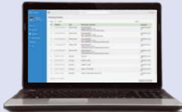
Fig 48 Case status> e-filed cases pending scrutiny screen

A user can check the cases e-filed by him which are pending scrutiny of the concerned court registry where it is been filed. The page displays e-filing number, CNR number and cause title of case and date when updated by the E-filing Admin (fig 46)