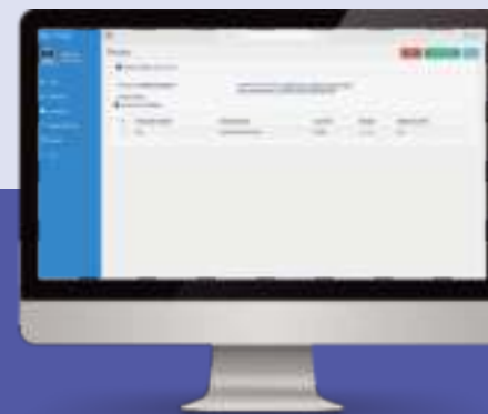
Fig 39 Preview of miscellaneous document to be filed

After paying deficit court fees, user is directed to view the 'Preview' page (fig.39) where he can check the details for correctness before pressing the 'Final submit' button and 'edit' it if required. Where Aadhar is chosen to e-sign, the Aadhar e-sign process including OTP validation process will follow. User then presses the 'final submit' button to finally e-file the deficit court fees (fig. 40).