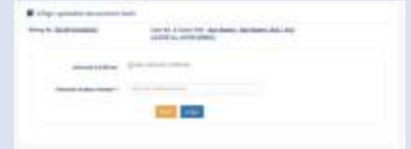
Fig 34 e sign the uploaded miscellaneous documents

User then would be asked to e-sign the uploaded miscellaneous document either using Aadhar or digital token. In case Aadhar is chosen to e-sign, a certificate will be generated showing document uploaded and its hash value which will then be signed using Aadhar.