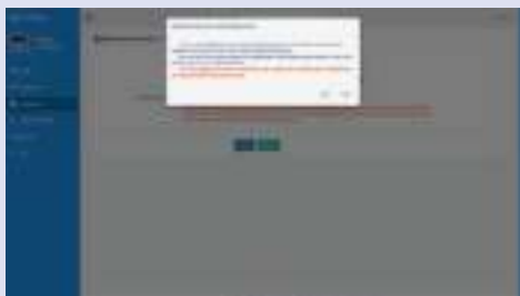
Fig 29 (a) Registration information of advocate

User is required to fill in the requisite details on the 'Where to file' section such as CNR number, court establishment details, and submit the form after signing the document either using Aadhar or Digital token. By clicking 'Submit' button the user would be taken to next 'E-File Miscellaneous Documents' page to upload the misc document.