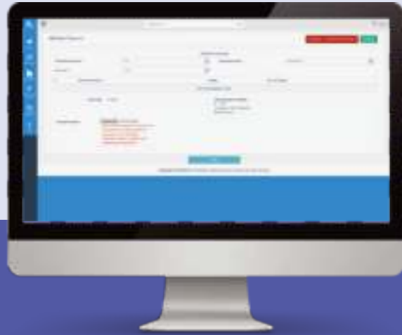
Fig 21 Submit court fees screen

A user is required to pay the applicable court fees by clicking on pay court fees tab as shown in fig 21 below. The court fees can be paid either using the payment gateway or uploading the scanned payment receipt. User can make the payment of court fees using the payment gateway integrated into the website through net banking/credit cards/debit cards.