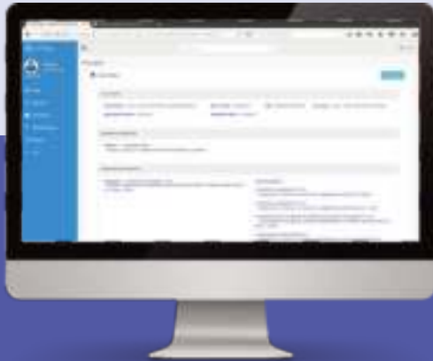
Fig 58 Case status screen

A user can access the case status of a successfully e-filed case by clicking 'My e-filed cases'/clicking option of case status on left panel of dashboard once a CNR number is issued for an e-filed case. A screen is displayed as shown below showing all details of a case, names of parties and their advocates and interim orders passed in a case.(fig 56)