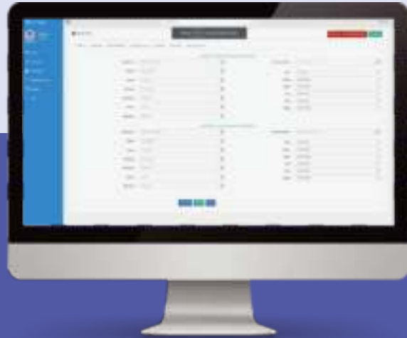
Fig 16 New Case > Fill form > Extra Information Tab

Any Extra information about a Petitioner and/or Respondent in a new case to be e-filed can be submitted in the 'Extra Information' tab such as Passport number, nationality, occupation, PAN number, contact details. After details are added, User clicks on 'Save' to submit the information. Pressing 'Previous' button will take a user to Respondent tab and pressing 'Next' to the Subordinate Court Tab as shown in Fig 16 below.