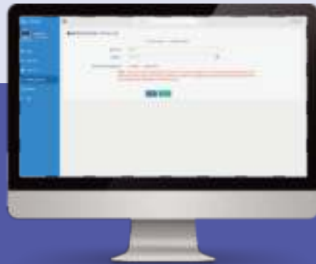
Fig 37 Deficit court fees screen

In the deficit court fees tab on left side panel of dashboard, User is required to fill the CNR Number of the case, and details of court establishment where the case has been filed. (fig 37)