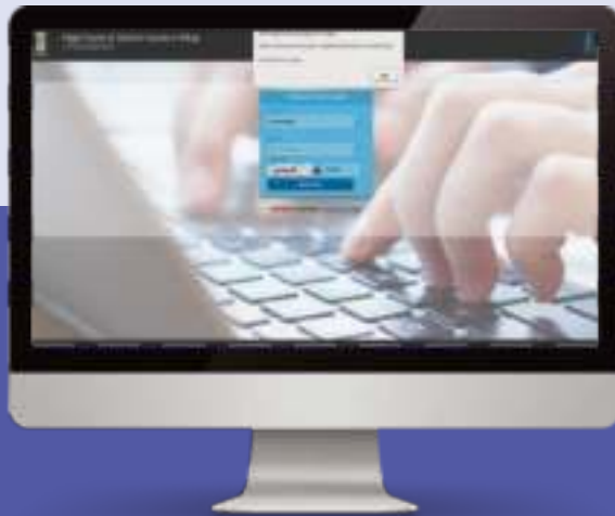
Fig 10 Message confirmation for retrieval of user id.

On pressing Send Mail button in fig 9 a screen notification appears showing user name has been successfully mailed at user's registered mail id as shown in fig 10.