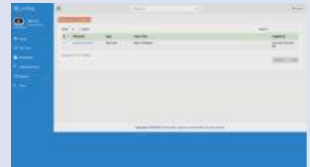
Fig 53 My cases > Rejected cases

All such cases which are rejected by the filing section of the concerned court and in which defects are not of curable nature are shown under rejected matters page. The page shows its e-filing number, type of case, cause title and date of last update. (fig 51)