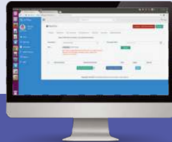
Fig 20 New case>upload documents screen

User can then click on 'pay & view court fees' and pay applicable fees by clicking the 'court fee' button and upload the physically signed oath document, by clicking 'proceed to Affirmation' button