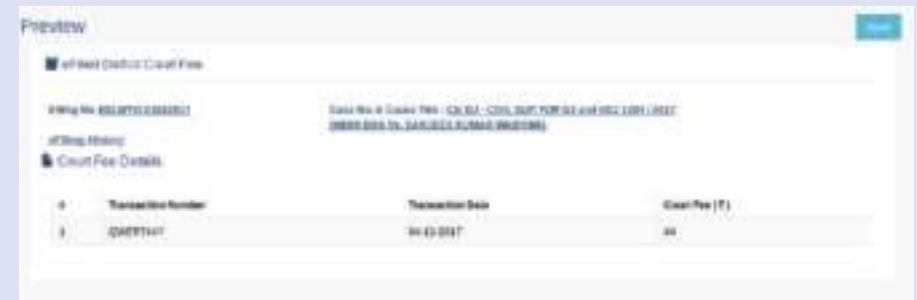
Fig 57 Screen showing details of deficit court fees

A user can view details of an e-filed deficit court fees by clicking on e-filing number of concerned case. (fig 55)