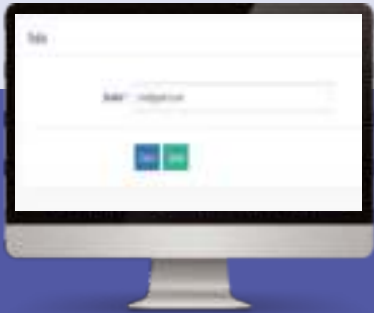
Fig 60 Update email id of a user

An OTP message will be sent to the user on his email which he must input in the OTP validation page (fig 59) to update the new e-mail address input by user (fig 58.)