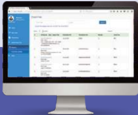
Fig 41 Report of court fees filed by a user

The court fees report can be filtered using the relevant period of time by selecting the 'From Date' and 'To Date' fields provided therein. The report will display case details, deficit court fees paid along with receipt, and transaction ID.