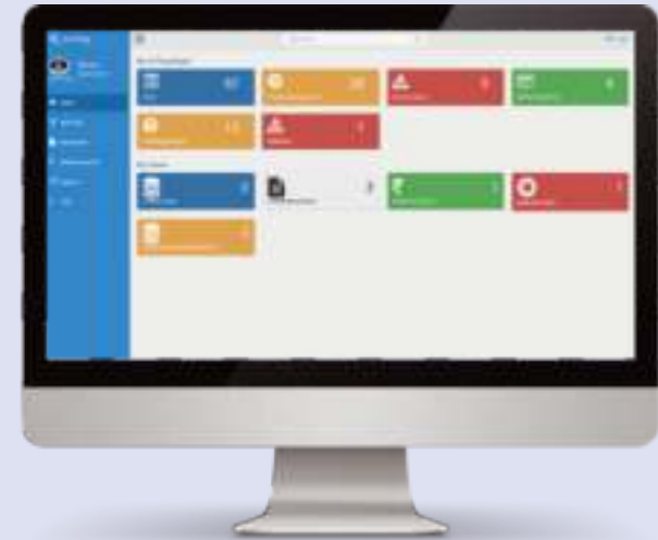
Fig 6 Registered User e-filing status page (Dashboard)