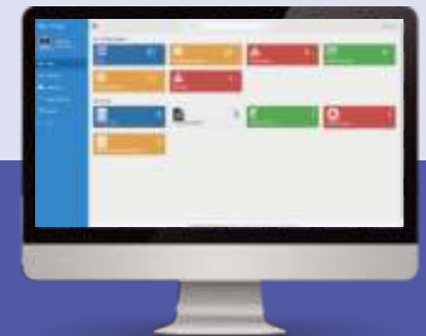
Fig 43 Dashboard screen