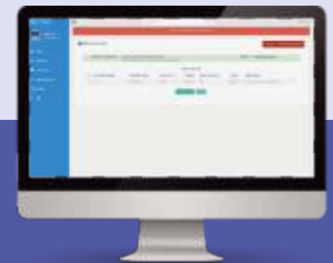
Fig 40 Pending document to e-sign deficient court fees