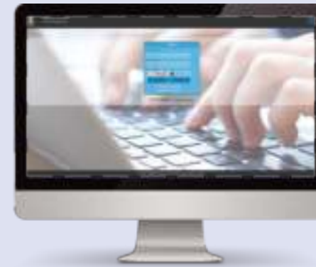
Fig 42 Home page of e-filing

When a user accesses efilng.ecourts.gov.in, he reaches the Home page of e-filing facility (fig 1.). User is required to submit his user id and password. On correctly submitting his user id and password, he is directed to the dashboard screen. (fig 6.)