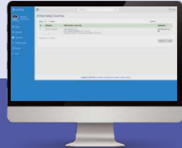
Fig 52 My cases > deficit court fees filed

A user can access the cases where he has filed any deficit court fees by clicking on the 'E-filed deficit court fees' tab under 'My cases' category on the dashboard. User can then view the e-filing number, CNR no. and cause title and last updated date. By clicking on a case user wants to view, deficit court fees paid in the case is shown. (fig 50)