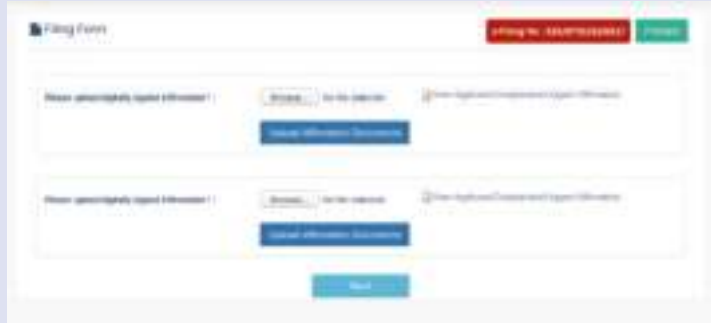
Fig 26 Affirmation through digitally signed document.

The screen showing option to digitally sign affirmation if a user has chosen digital signature token to sign the affirmation is shown at fig 26(below).