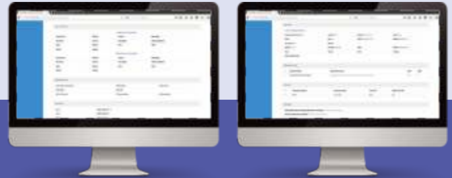
Fig 27 (a) Preview of forms filled by user to file new case