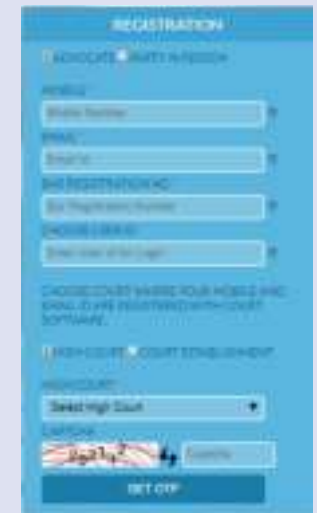
Fig 2 Registration form for Petitioner in person

All the fields are mandatory. After filling the form, user must fill the captcha code show in the captcha box and then click 'Get OTP'. Two different OTPs gets generated and are sent to the registered mobile number and email address submitted at time of registration by the User. A user then needs to follow steps explained in 3.3 -3.4 to complete the registration process.