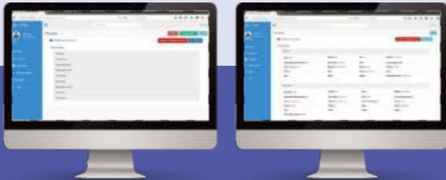
Fig 27 Preview of forms filled by user to file new case

When a user presses the 'Preview' button at top right corner as shown in fig 26 above, the 'Preview' screen appears with saved data in all forms filled by a user in a new case to be filed. (Fig 27 below)