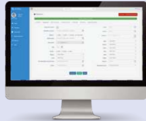
Fig 13 New Case>Filing form –Petitioner (Organization)