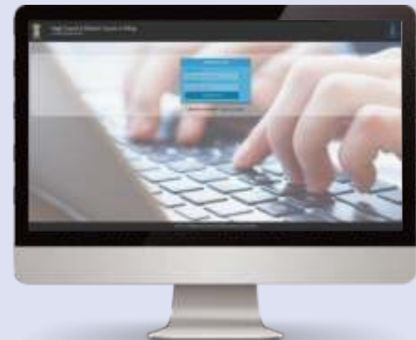
Fig 4 Validate OTP screen

Once the OTP gets validated, or in other words, if the OTP entered by a User matches with OTP generated by the e-filing system, the Registration process proceeds further.