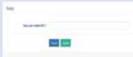
Fig 63 OTP validation to update mobile number of a user

On clicking the 'Update' button, the changed address will be updated in a user's profile