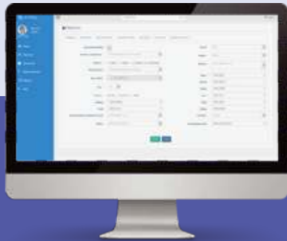
Fig 12 New Case> Filing form -Petitioner