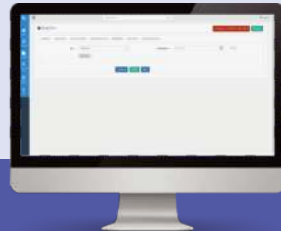
Fig 18 New case > Act-Section screen

Fill in all mandatory fields and then submit the form by clicking the 'Save' button. If user wants to add more than one Act then he needs to click on 'Add More' Button. If user wants to delete a particular Act & Section he must press 'Delete' option next to relevant Act and Section to be deleted.