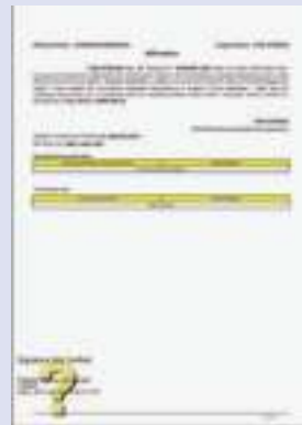
Fig 22 Sample affirmation page

After 'proceed to affirmation' button is pressed in upload document screen, affirmation is complete when applicant submits e-signed affirmation in pdf and advocate uploads e-signed affirmation in pdf. E-signatures can be made using Aadhar number or digital token. A sample affirmation page is shown in fig 22.