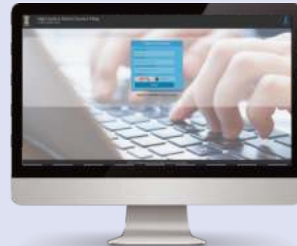
Fig 8 Forgot password screen

User then types the captcha code and presses 'Change Password' Option to complete the process of changing his password.