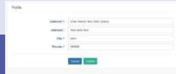
Fig 64 Updating address of user in his profile

Through a similar process (as shown in fig 57), address of a user can be edited in his profile by clicking on edit button next to address. A new screen is displayed as below in fig 62.