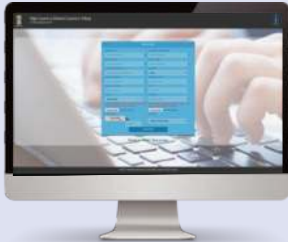
Fig 5 Registration form with user data

Identity proof (ID Type). Image of the ID card can be uploaded (less than 50KB) using the Browse button to select the file from a User's system. All fields are mandatory except other contact number. User finally enters the captcha code given in box and press the Register' button to complete the Registration process.