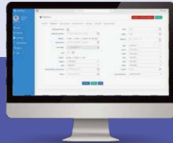
Fig 15 New Case> Filing Form>Respondent details