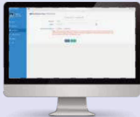
Fig 29 File misc documents page

In case a user intends to e-file documents in an already filed case in a court (both in cases where the case was e-filed or physically filed), it can be filed using this e-filing facility. To do so, a User must click on 'Documents' link after logging in to this facility from the dashboard screen's left panel (as in fig 6 above & fig 29 below). On clicking the 'Documents' link, a new screen opens, the 'Where to file' page (fig 29). The system will automatically cross-check registration information of an advocate to enable e-filing through the website.