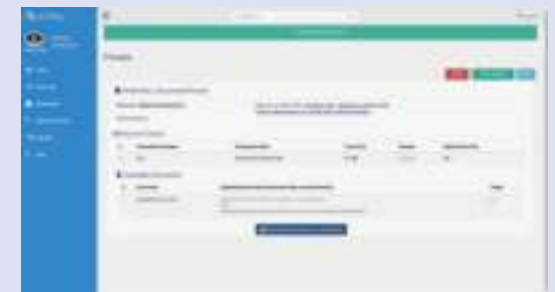
Fig 36 Preview misc document to be e-filed

A preview screen will open asking user to click on 'Final submit' button to e-file miscellaneous document. (fig 36)