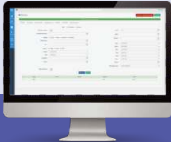
Fig 19 New case>Extra party

If extra party has been added successfully a message appears at top of screen 'extra party details added successfully'.