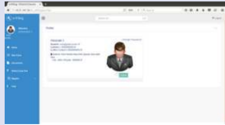
Fig 59 Edit profile page

A user may upload his (passport size) photo by selecting the upload button with a click on 'upload' check box. The contact details can be edited by clicking on 'edit' icon given next to each detail. (fig 57)