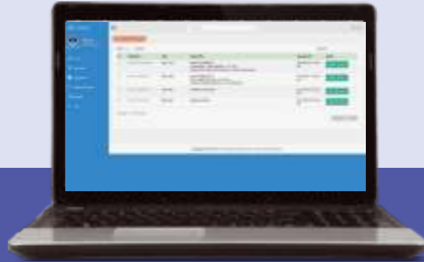
Fig 47 E-filing status>Deficit court fees

A user can check if the fees paid by him for e-filing a case is deficit or not by pressing the 'Deficit court fees' tab under 'My e-filing status' on Dashboard. The cases listed there have been accepted by the E-filing Administrator after these have been finally e-filed by a user. User can pay the deficit court fees shown therein by pressing relevant 'Make Payment' button. (fig 45)