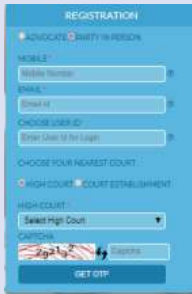
Fig 3 Registration form for Petitioner in person

NOTE: In case an Advocate is filing case using e-filing system as a Petitioner in Person, he needs to make a separate registration as a Petitioner in Person with separate email address and mobile number despite he is already registered as an Advocate in the e-filing system.