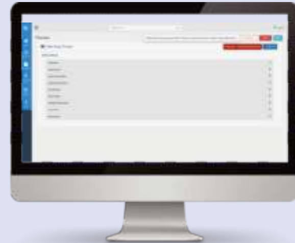
Fig 28 Warning alert at final submit

In case any information is not complete, a warning button at the top right corner of preview screen (fig 28 below) will show the information that must be filled by a user before pressing Final Submit.