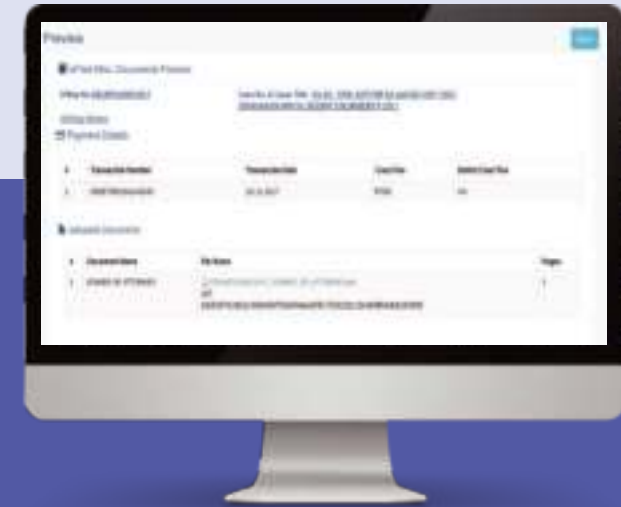
Fig 56 Screen showing details of an e-filed miscellaneous document

Similarly a user can view an e filed miscellaneous document by clicking on its e-filing number at any place in the e-filing system. (fig 54)