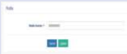
Fig 62 Update user mobile number

Similarly, to edit mobile number, a user must select the edit icon next to his Mobile number (fig 57). A new page appears on screen, where the new mobile number must be filled. (fig.60). On clicking the 'Update' button, OTP will be sent to a user on his new mobile number, which he needs to fill in the OTP validation page. (fig 61).