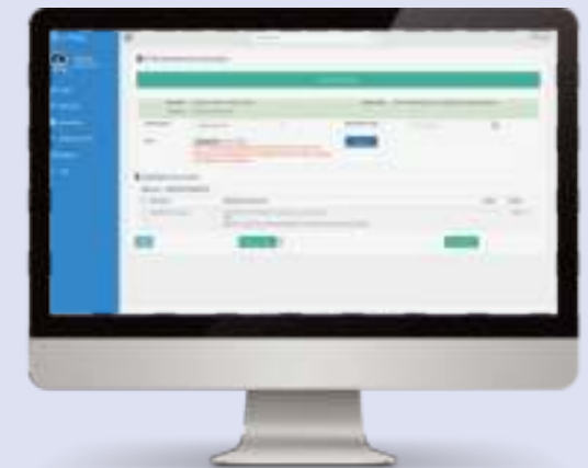
Fig 31 Uploaded miscellaneous document screen

The user can select the type of document to be filed from the drop down menu, and select the file to be filed from his system by pressing the browse button. After selecting the file and typing the document title, user must press the 'upload' button to upload the pdf document which is uploaded with an automatic hash value generated. Uploaded document is shown in screen (Fig 31) in the list displayed below. If user wants to delete any file than it can be deleted by clicking the delete icon.