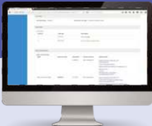
Fig 58 (a) Case status screen