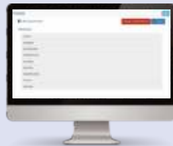
Fig 55 Screen showing details of an e-filed case

E-filed cases can be accessed by clicking on the e-filing number at any place in the e-filing facility website. (fig 53)