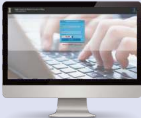
Fig 7 Forgot password screen

In case a registered user forgets his password, the same can be retrieved by clicking on 'Forgot password' link in Log in screen shown in Fig 1 which is first screen that shows when a User accesses the website of e-filing system at https://efiling.ecourts.gov.in clicking on Forgot password option opens a Forgot password screen shown in Fig 7.