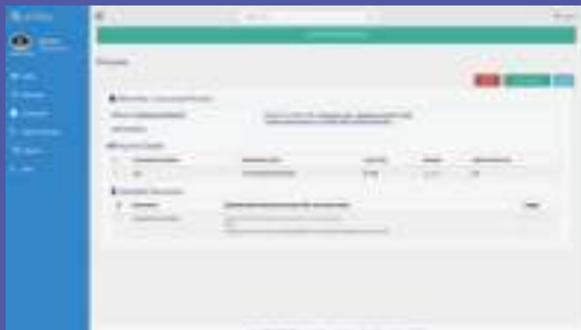
Fig 33 Screen showing the uploaded miscellaneous document court fees to e-file document

After making payment of court fees to e- file miscellaneous document, user shall be displayed a screen showing uploaded miscellaneous document along with its hash value, court fees paid etc. (fig 33).