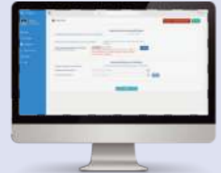
Fig 24 Applicant affirmation (physically signed) signed using Advocate's Aadhar