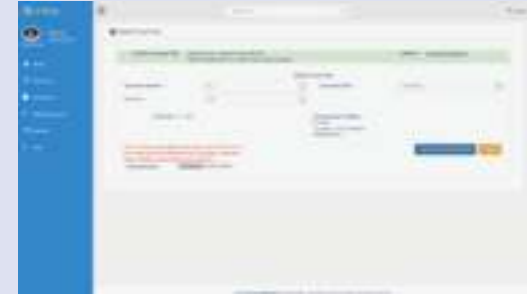
Fig 38 Pay deficit court fees screen

User will be directed to a page that asks user to mention the amount of deficit court fees to be paid. On inserting the value, user can make the payment by clicking the 'Make Payment' button. (fig 38). A User may cancel the transaction, using the 'cancel' button.