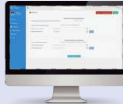
Fig 23 Applicant affirmation signed using his Aadhar

In case applicant provides Aadhar number for signatures, fig 23 shows screen as will then appear. If applicant does not wish to provide Aadhar number, he can physically sign and upload his document of affirmation and Advocate can submit his Aadhar to sign as shown in fig 24 below. Please note that a user is required to accept the consent form to use Aadhar for e-signing.