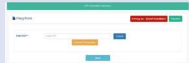
Fig 25 OTP validation to confirm submission of Affirmation

Where Aadhar is submitted for e-signing the affirmation, an OTP will be received on user's registered mobile number with UIDAI for authentication. Once correct OTP is entered for validation as shown in Fig 25 below, a message showing Affirmation is submitted successfully is displayed on screen. Once it is successfully validated, affirmation is e-signed using Aadhar.