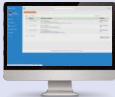
Fig 51 My cases > E-filed document

A user can access any document successfully e-filed by him (for which CNR number has been allotted) using this facility by clicking the e-filed document tab under 'My cases' category on the dashboard. The screen will display case details and document filed and last update date. (fig 49)