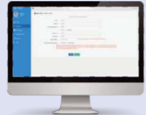
Fig 11(a) New Case> Where to file screen for Lower Court