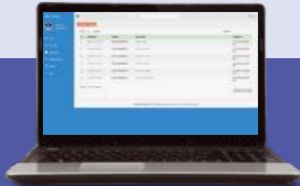
Fig 50 E-filed cases Tab on dashboard

Clicking on the e-filed cases Tab, opens a page where user can view list of cases e-filed by him successfully along with e-filing number, CNR number, cause title, and date when it was updated last. (fig 48)