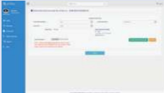
Fig 32 Submit court fees to e-file document

The user can submit Court Fee by clicking 'Pay Court Fee' button to e-file a miscellaneous document (fig 32).