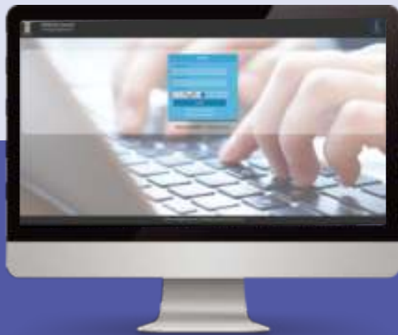
Fig 1 Home page of e-filing -Log in screen

Fig. 1 below displays how the main page of the e-filing facility will appear to a user.