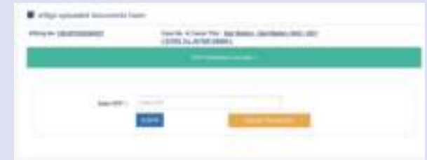
Fig 35 OTP validation for filing of miscellaneous documents

After last step, in case Aadhar is used to e-sign the uploaded document, another page will open asking advocate to input the OTP received on his registered mobile number and press 'submit' button. If OTP matches, e-filing process takes user to preview screen. (fig 35).