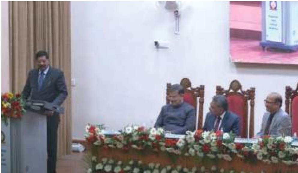
16 March 2024, Justice B R Gavai attends a One-Day Law Seminar on "Constitutional Governance in India – Dr B R Ambedkar Idea of Socio-Economic Justice and Social Engineering through Judicial Activism" at State Judicial Academy, Jodhpur, Rajasthan