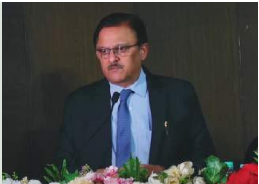
23 March 2024, Justice Abhay S Oka attends the valedictory ceremony of the 12th Justice P.N Bhagwati International Moot Court Competition on Human Rights at the Bharati Vidyapeeth New Law College, Pune