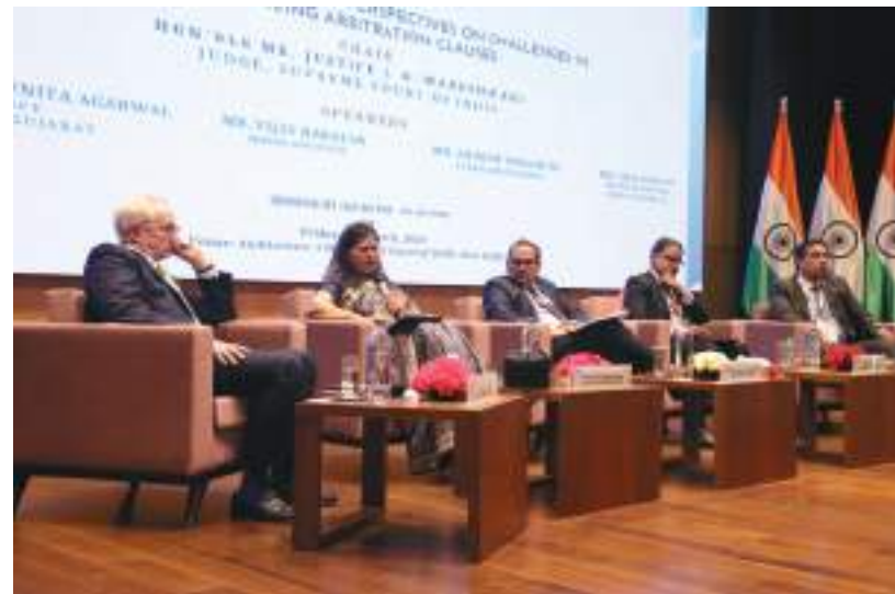
8 March 2024, Justice J K Maheshwari, chairs Session-III on 'Back to the Basics: Global Perspectives on Challenges in Enforcing Arbitration Clauses' at DAW, 2024