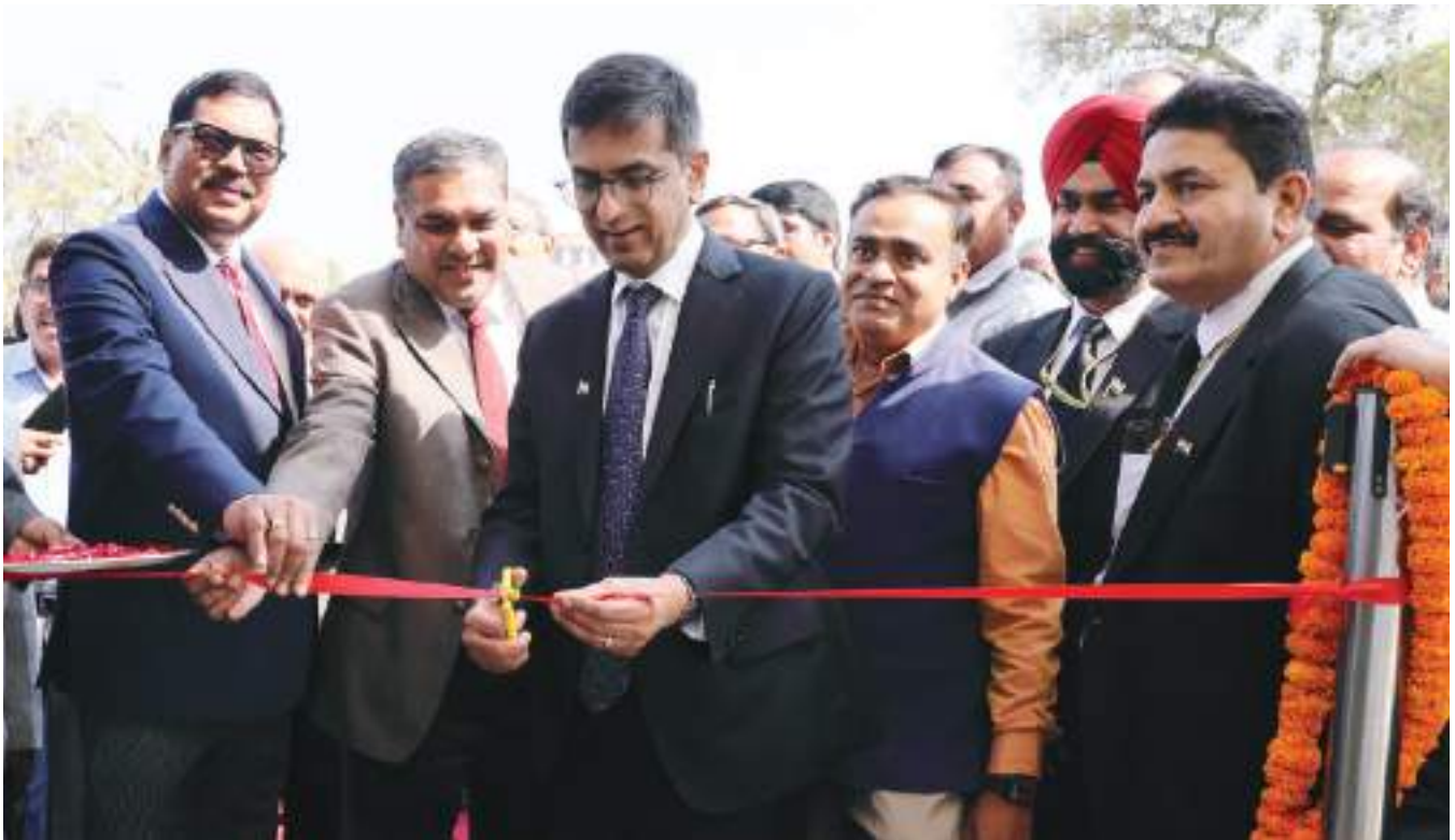
21 March 2024, the Chief Justice of India, Dr D Y Chandrachud, along with Justice Sanjiv Khanna, Justice J B Pardiwala, Justice Sanjay Kumar, Justice Ahsanuddin Amanullah, Justice Manoj Misra, and Justice Satish Chandra Sharma heading to inaugurate the Accessibility Help Desk, near e-Sewa Kendra, Supreme Court of India