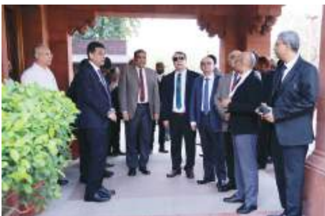
21 March 2024, the Chief Justice of India, Dr D Y Chandrachud, along with Justice Sanjiv Khanna, Justice J B Pardiwala, Justice Sanjay Kumar, Justice Ahsanuddin Amanullah, Justice Manoj Misra, and Justice Satish Chandra Sharma heading to inaugurate the Accessibility Help Desk, near e-Sewa Kendra, Supreme Court of India