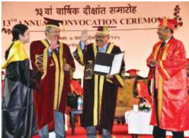
16 March 2024, Justice Hrishikesh Roy attends the 13th Convocation Ceremony of National Law Institute University (NLIU), Bhopal, held at the Justice J S Verma Memorial Convention Centre