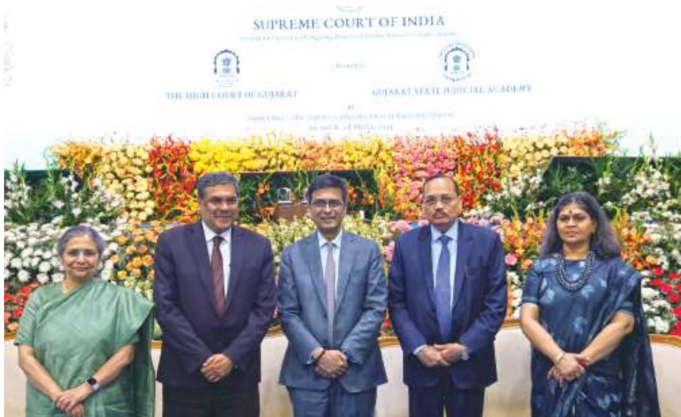
Left to Right: Justice Bela M Trivedi, Justice Sanjiv Khanna, the Chief Justice of India, Dr D Y Chandrachud, Justice Surya Kant and the Chief Justice of High Court of Gujarat, Justice Sunita Agarwal at the All India District Judges' Conference, Kachchh, Gujarat on 2 March 2024

The Chief Justice of India highlighted the vital role of the district judiciary as the backbone and central nervous system of the Indian judicial system. He emphasised the importance of addressing challenges faced by the district judiciary and encouraged direct conversations with judicial officers for solutions. He addressed the various concerns such as the adjournment