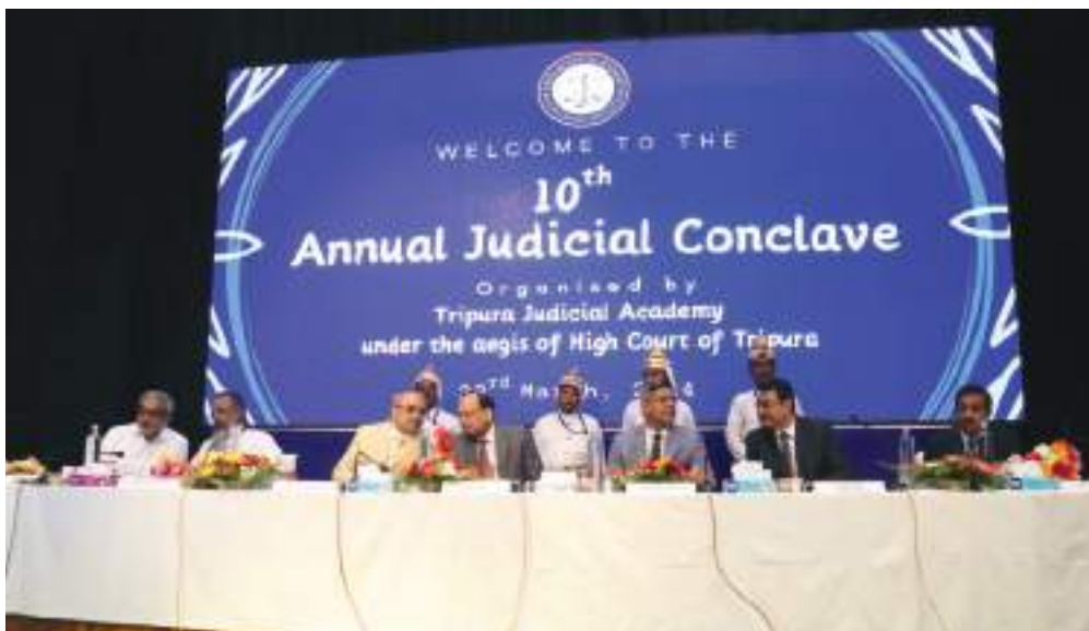
23 March 2024, Justice Surya Kant, Chief Guest, attends the 10th Annual Judicial Conclave on the occasion of Foundation Day of the High Court organised by the Tripura Judicial Academy under the aegis of High Court of Tripura