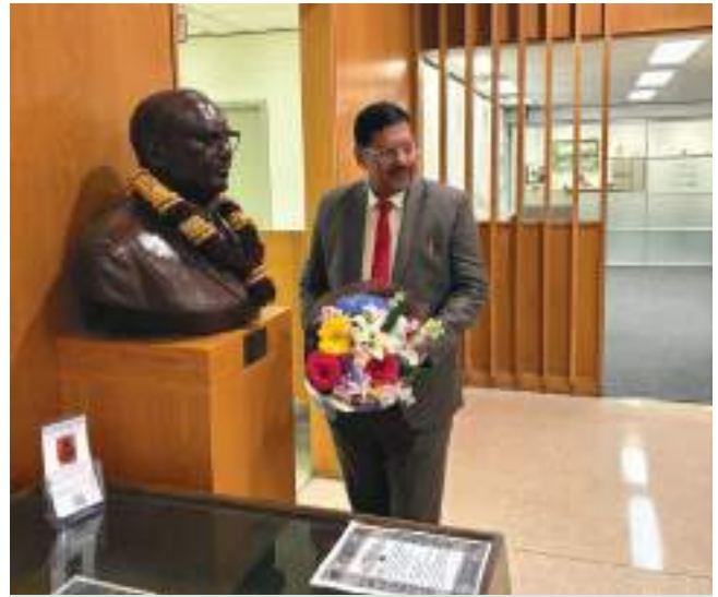
26 March 2024, Justice B R Gavai, visits the Dr Ambedkar statue at Columbia Law School, New York highlighting Dr Ambedkar's academic achievement at the institution where his sculpture now stands as a tribute