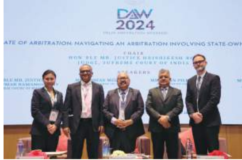
8 March 2024, Justice Hrishikesh Roy, chairs Session-I on 'The State of Arbitration: Navigating an Arbitration Involving State-owned Entities' at DAW, 2024