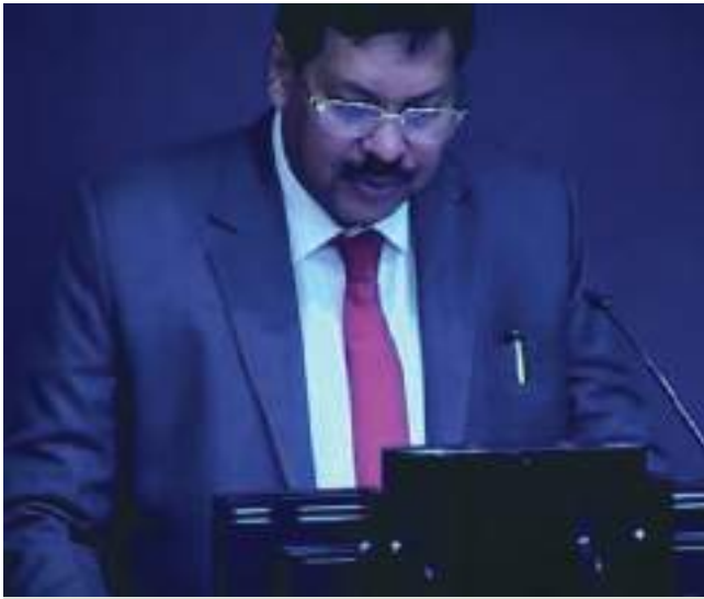
26 March 2024, Justice B R Gavai, delivers a lecture on '75 Years of Transformative Constitutionalism,' at the Columbia Law School, New York