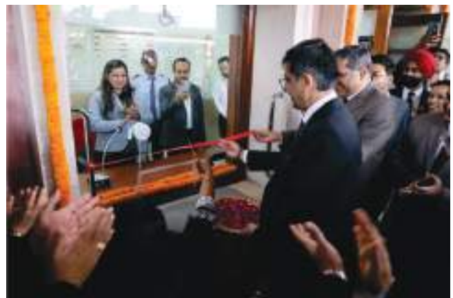
21 March 2024, the Chief Justice of India, Dr D Y Chandrachud, along with Justice Sanjiv Khanna, inaugurates the newly created Accessibility Help Desk, near e-Sewa Kendra, Supreme Court of India