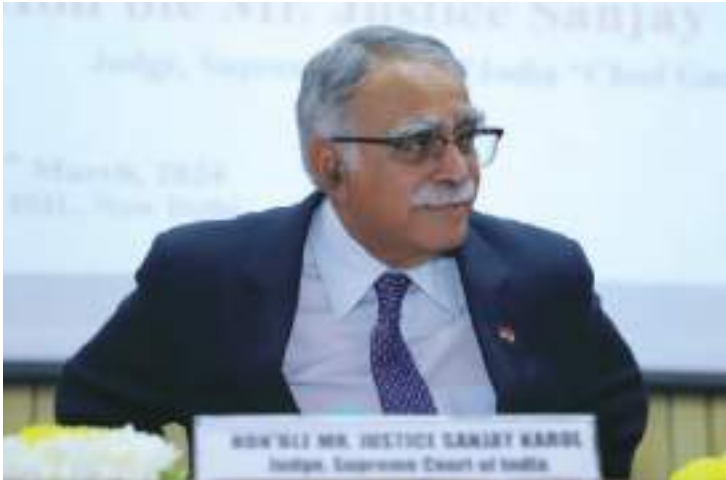
11 March 2024, Justice Sanjay Karol, Chief Guest, attends a lecture on 'The Mediation Act, 2023 and the Legal Profession,' organised by the Supreme Court Bar Association (SCBA) at V K Krishna Menon Bhawan, Indian Society of International Law, New Delhi