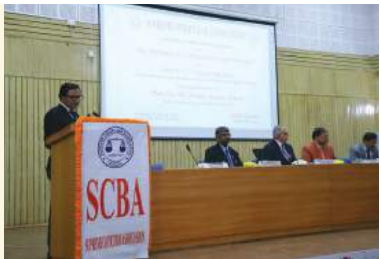
11 March 2024, the Supreme Court Bar Association hosts a lecture on 'The Mediation Act, 2023 and the Legal Profession' at V K Krishna Menon Bhawan, Indian Society of International Law