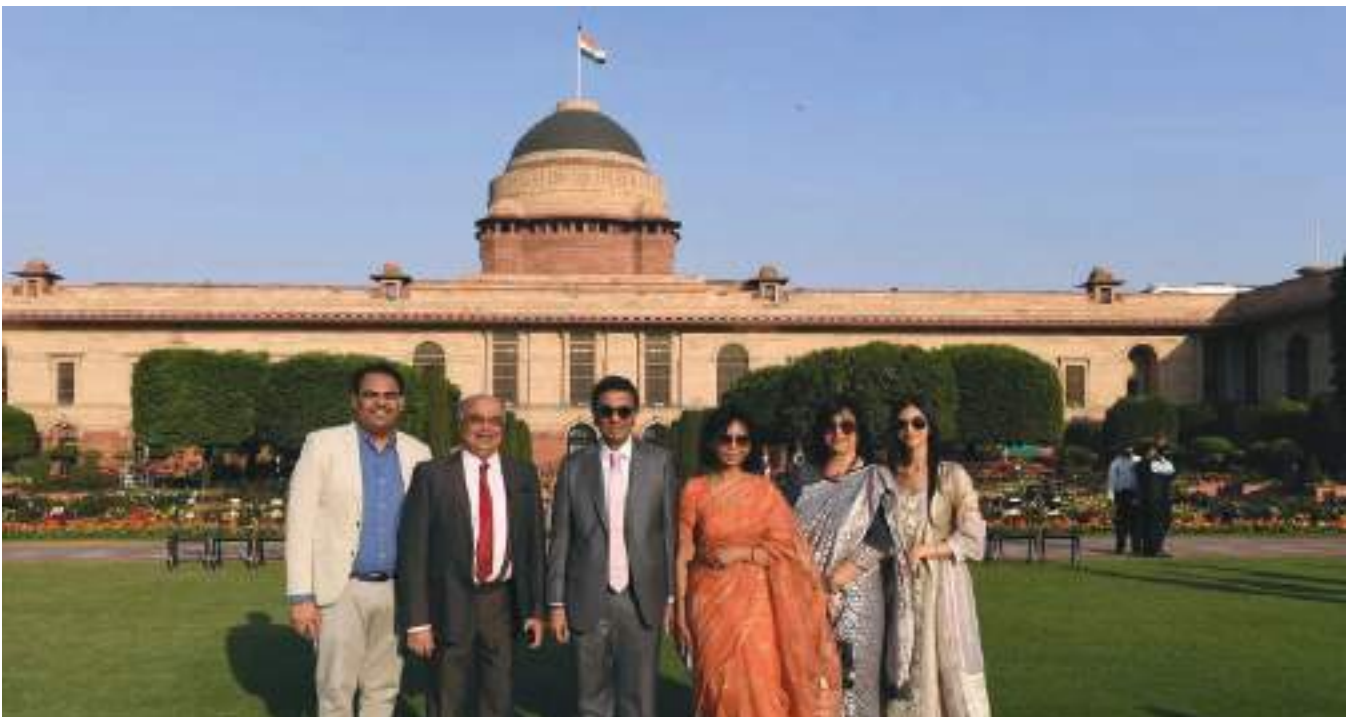
Left to right: Justice Ahsanuddin Amanullah, the Chief Justice of India, Dr D Y Chandrachud, along with their families, at the Amrit Udyan at the Rashtrapati Bhavan on 4 March 2024