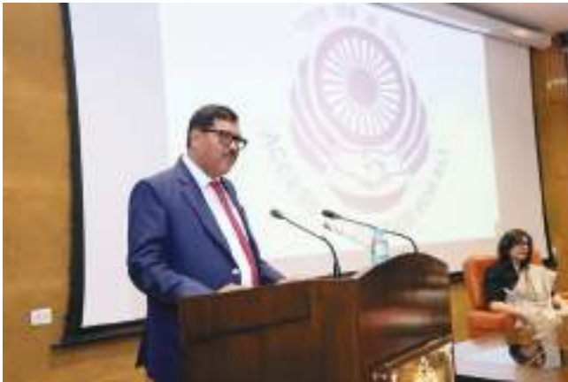
19 March 2024, Justice B R Gavai, chairs a workshop for Panel Lawyers of the Supreme Court Legal Services Committee (SCLSC) organised by SCLSC at the Additional Building Complex, Supreme Court of India

Justice B R Gavai, Chairman, Supreme Court Legal Services Committee (SCLSC), chaired a training workshop held for the Advocates-on-Record (AOR) Panel of the SCLSC on 19 March 2024. The workshop aimed to enhance AORs' grasp of utilising digital tools in their practice, thereby improving the efficacy and accessibility of legal services. Justice Gavai emphasised the importance of establishing a video conferencing platform to facilitate communication between legal aid counsels and incarcerated individuals. Furthermore, the workshop addressed concerns regarding the quality of legal aid and outlined the strategies for promptly identifying and resolving legal aid challenges.