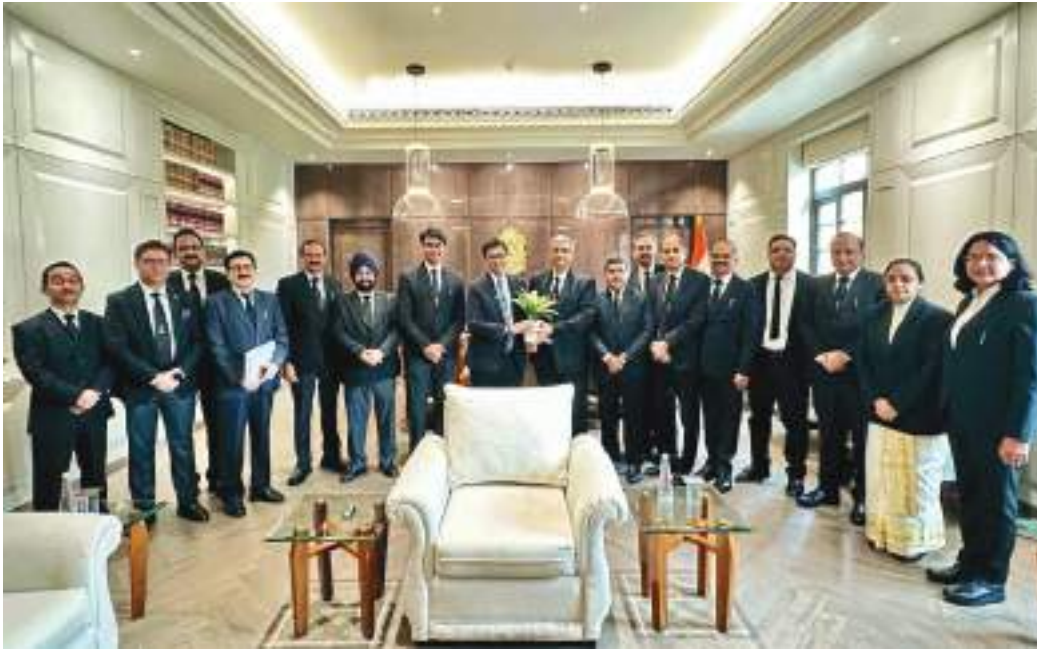
29 March, 2024, the Chief Justice of India, Dr D Y Chandrachud greeted by the Supreme Court Registry as he enters his 25th year of judgeship