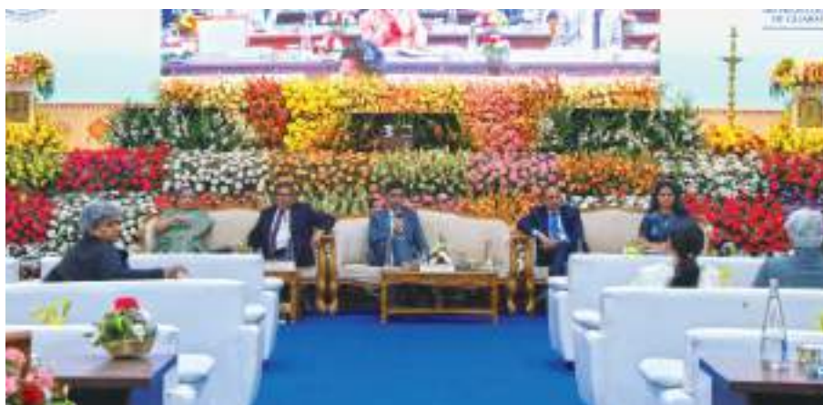
2 March 2024, the Chief Justice of India, Dr D Y Chandrachud alongside Supreme Court Judges and the Chief Justice of High Court of Gujarat, engages with the judicial officers during Session-I of the All India District Judges' Conference, Kachchh, Gujarat

'We can perceive our commitments from the oath we take either during our appointments or elevations, that we will discharge our duties, dutifully and faithfully, without fear and favour, affection or ill will.'