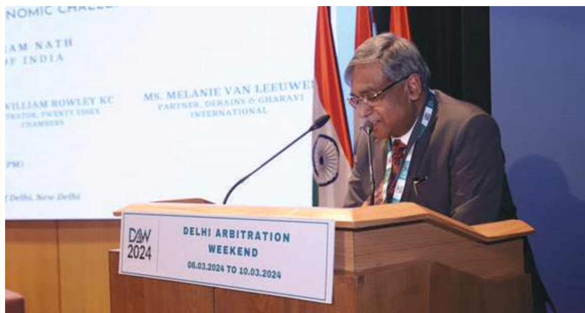
8 March 2024, Justice Vikram Nath, chairs Session-IV on 'Where do we stand?: Revisiting the Investor-State Dispute Settlement (ISDS) mechanisms in light of today's economic challenges' at DAW, 2024