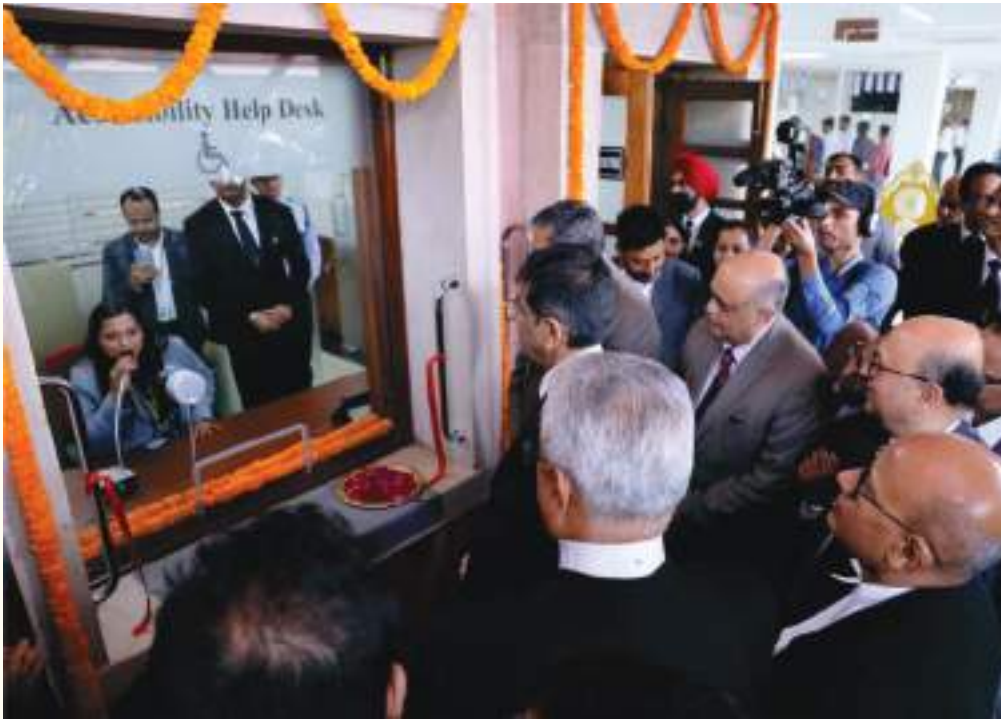
21 March 2024, the Chief Justice of India, Dr D Y Chandrachud, along with Justice Sanjiv Khanna, Justice Sanjay Kumar, Justice Ahsanuddin Amanullah, Justice Manoj Misra, Justice Aravind Kumar, and Justice K S Viswanathan, at the inauguration of the Accessibility Help Desk, near e-Sewa Kendra, Supreme Court of India