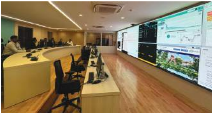
Newly dedicated 'War Room' to view the data and information from multiple sources in one go. A video wall which can be split into multiple screens to monitor different courts, including the facility to conduct high level video conferencing from one room, is now created in the Supreme Court, Ground Floor, Main Building