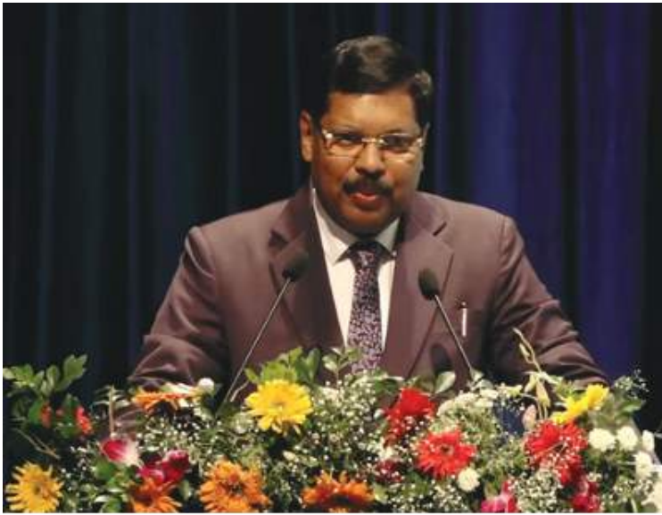
3 August 2024, Justice B R Gavai delivers the S N Bhuyan Centenary Lecture on “75 Years of the Constitution of India: Dr Ambedkar’s Vision and Social Justice”