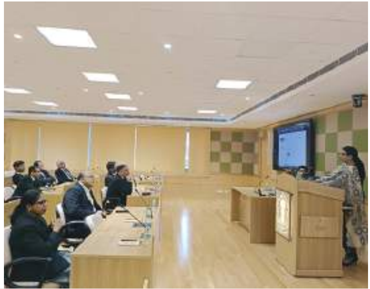
23 August 2024, Training Cell conducts a hybrid Orientation Session for Registrars and Additional Registrars of the Supreme Court of India, acquainting them with structure, objectives, and key elements of the English Language Course