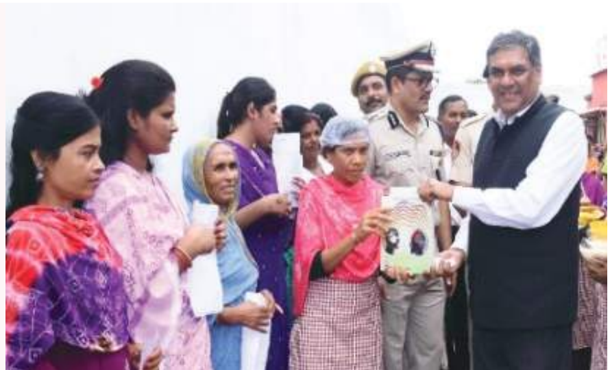
16 - 18 August 2024, Justice Sanjiv Khanna, Executive Chairman, NALSA visits different Legal Services Institutions in districts of Bhubaneswar and Puri (Odisha) and presides over "Odisha Conference of District Legal Services Authorities," held at Cuttack, Odisha. Justice Sanjiv Khanna inaugurates the Sewing Machine Operator Programme at the Female Ward in the Special Jail, Bhubaneswar