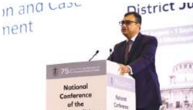
31 August 2024, Justice Dipankar Datta, Judge, Supreme Court of India, gives a presentation on APAaR-DJ during Session IV of "National Conference of the District Judiciary"