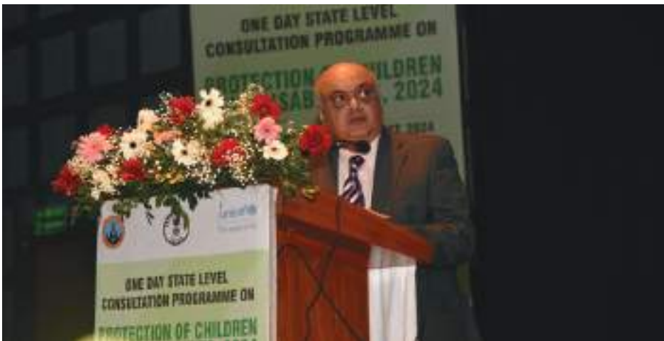
10 August 2024, Justice Abhay S Oka and Justice Ahsanuddin Amanullah attend the State-level Annual Stakeholders Consultation programme on 'Protection of Children with Disabilities', 2024 organised by Juvenile Justice Monitoring Committee at Gyan Bhawan, near Gandhi Maidan, Patna, Bihar