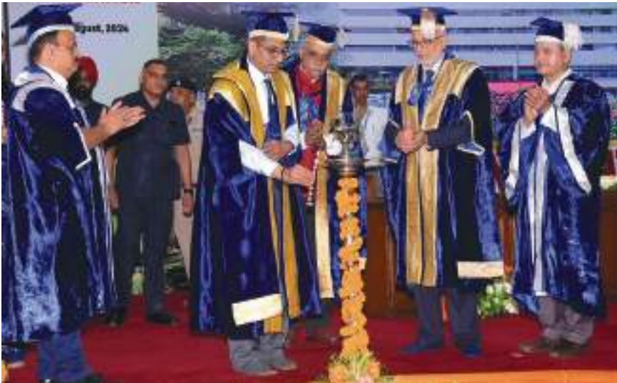
11 August 2024, Chief Justice of India, Dr D Y Chandrachud, lights the ceremonial lamp at 37th Convocation of PGIMER, Chandigarh