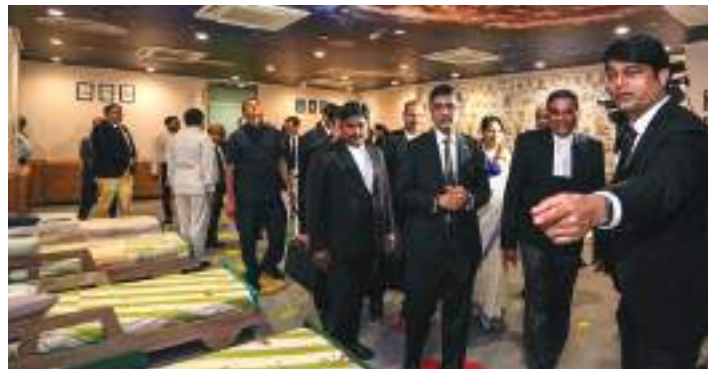
29 August 2024, Chief Justice of India, Dr D Y Chandrachud, Justice Sanjiv Khanna, Justice B R Gavai, Justice Hrishikesh Roy, Justice Ahsanuddin Amanullah and Justice Kotiswar Singh, Judges, Supreme Court of India, inaugurate the new branch of 'Bank of Maharashtra' at Sixth Floor, E Block, Supreme Court of India and 'Creche (Child Care Centre)' at Second Floor, E Block, Administrative Buildings Complex, Supreme Court of India.