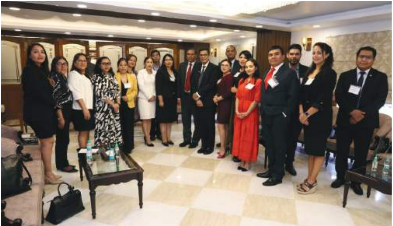
1 August 2024 , Chief Justice of India, Dr D Y Chandrachud meets with the 15-member Peruvian delegation, at the Supreme Court of India