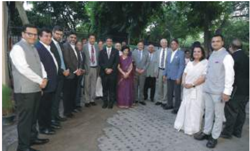
5 August 2024, Chief Justice of India, Dr D Y Chandrachud, Justice Hima Kohli, Justice Abhay S Oka, Justice Hima Kohl, Justice Pankaj Mithal, Justice Ahsanuddin Amanullah, Justice K V Viswanathan, Justice P B Varale, Justice N Kotiswar Singh and acting Chief Justice of Delhi High Court, Justice Manmohan attend the launch of e-DHCR’ that is the Digital Law Reports of Delhi High Court, Auditorium, S Block, Delhi High Court