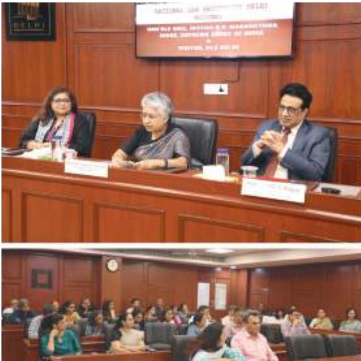
10 August 2024, Justice B V Nagarathna interacts with Vice-Chancellor and faculty members upon being nominated as a Visitor of National Law University, Delhi