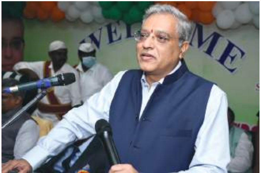
24 August 2024, Justice P S Narasimha visits the District Court Guntur and addresses the Guntur Bar Association