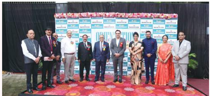
10 August 2024, Justice Sanjay Karol, Chief Guest, inaugurates the orientation ceremony for Batch 2024 at Indore Institute of Law, Indore, Madhya Pradesh