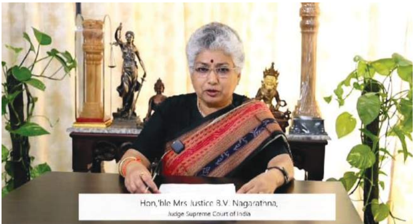
3 August 2024, Justice B V Nagarathna conveys her greetings through a videographed message at "Alumni Meet and Platinum Jubilee Celebration" of Sophia High School at Bengaluru