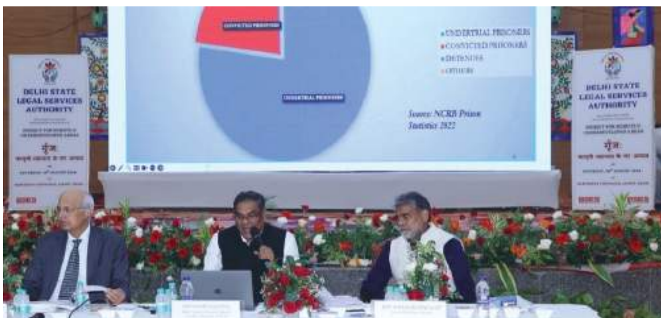
10 August 2024, Justice Sanjiv Khanna visits Jail No. 4, Central Jail, Tihar Complex organised by Delhi State Legal Services Authority