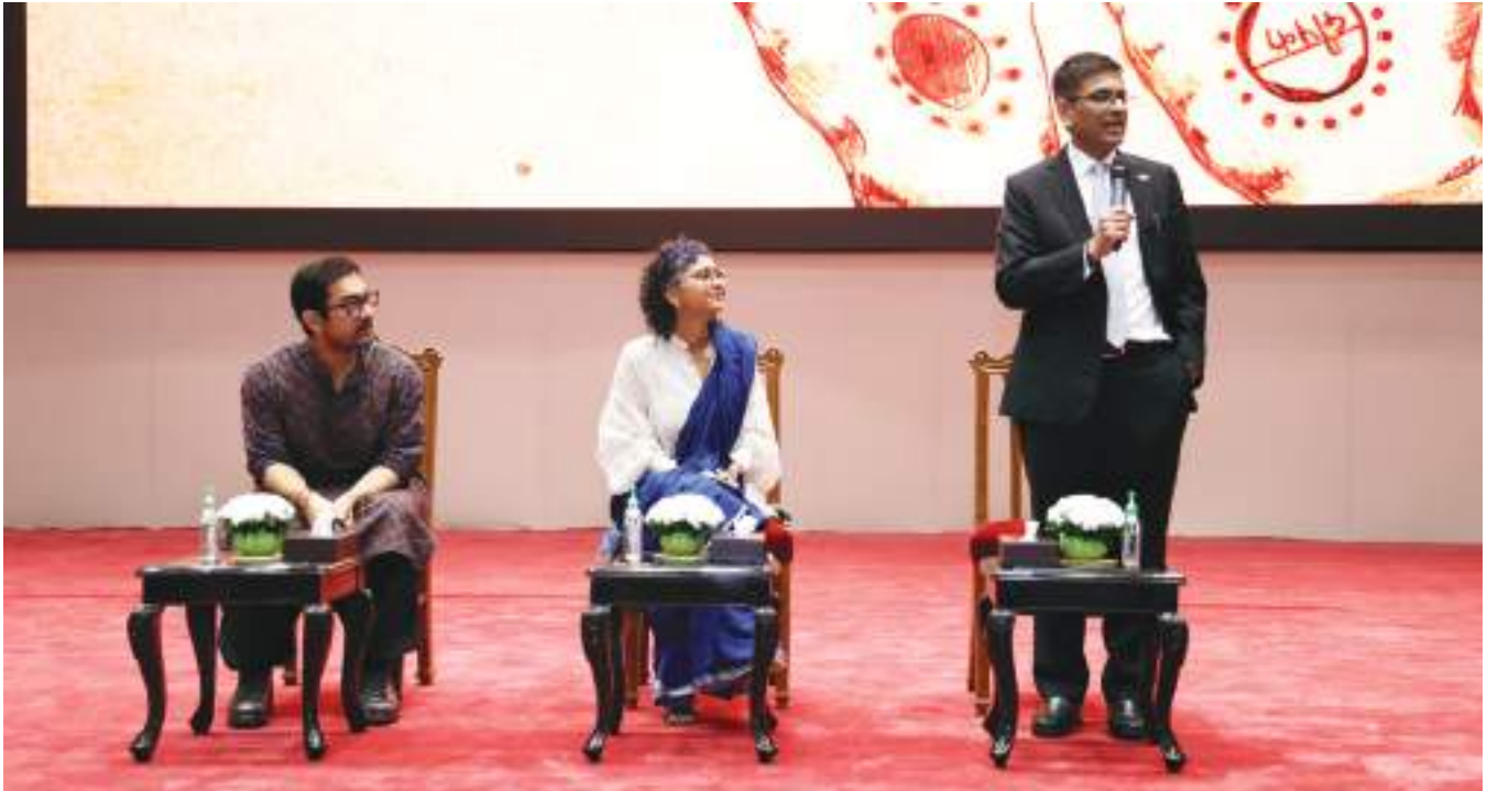
9 August 2024, Chief Justice of India, Dr D Y Chandrachud, Ms Kiran Rao, Director and Mr Aamir Khan, Producer interact with the audience after the screening of 'Laapataa Ladies', a film based on the theme of gender equality, at Auditorium, Administrative Buildings Complex, Supreme Court of India

The film, Laapataa Ladies was screened at the C Block Auditorium in the Supreme Court of India's Administrative Buildings Complex on 9 August, 2024. This screening was part of the Supreme Court's 75th anniversary celebrations and aimed at gender sensitization. The film explores the theme of gender equality and highlights other socio-cultural issues, intending to inform attendees about social realities and initiate discussions on gender and vulnerabilities. Imparting the message through film as a medium engaged the audience and acquainted them with the inherent biases plaguing the society. The screening was followed by a discussion between the film's director, Ms Kiran Rao and actor Aamir Khan with the Chief Justice of India, wherein the themes of the film were further deliberated upon.