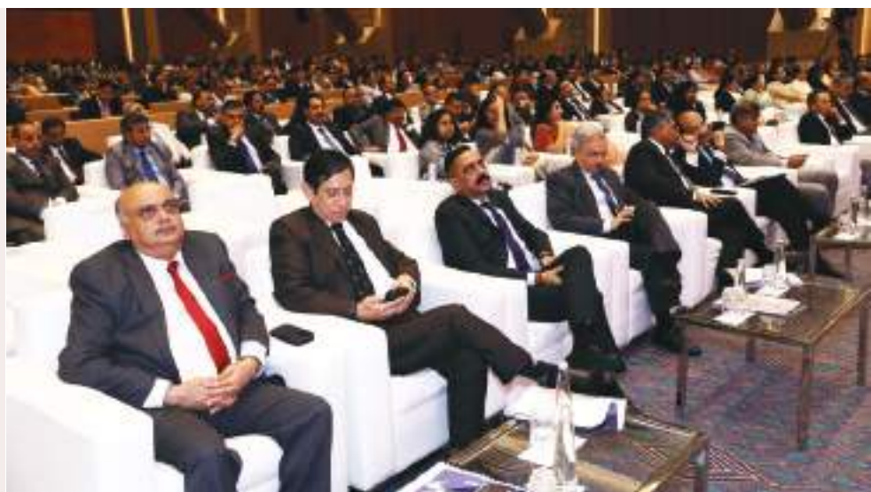
Justice Ahsanuddin Amanullah along with Justice N Kotiswar Singh during the "National Conference of the District Judiciary", Bharat Mandapam, Mathura Road, New Delhi

level experiences to bridge an invisible gap within the judiciary. The discussion further delved into the collegiality amongst District Judiciary and High Courts, needs of the District Judiciary, role of the High Courts, role of administrative judges and the assessment of judicial performance.