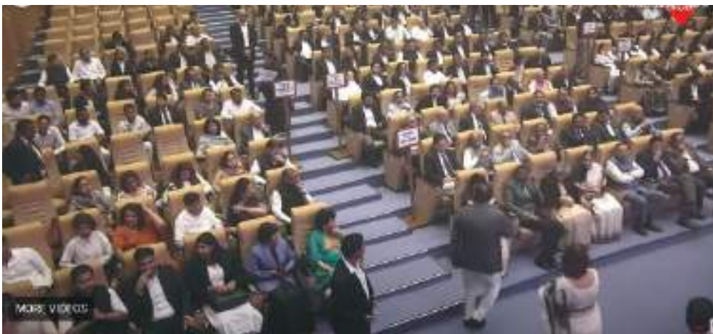
30 August 2024, Judges of the Supreme Court of India at the farewell function of Justice Hima Kohli at Main Auditorium, C Block, Administrative Buildings Complex, Supreme Court of India