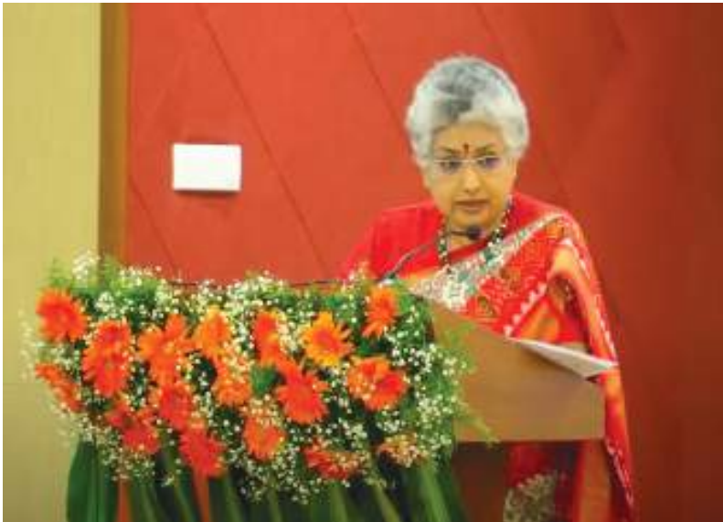
18 August 2024, Justice B V. Nagarathna inaugurates Silver Jubilee Celebrations of Karnataka Judicial Academy “Nyayajnana” - A Silver Milestone organised by the High Court of Karnataka and Karnataka Judicial Academy, Bengaluru