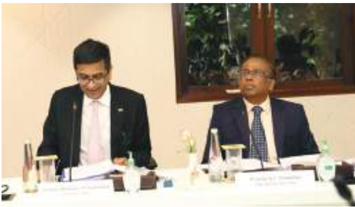
23 August 2024, Chief Justice of India, Dr D Y Chandrachud, Justice K V Viswanathan, Judge, Supreme Court of India during the 2nd India-Singapore Judicial Roundtable

The conversation further explored the challenges of AI-generated content, particularly in the realm of intellectual property. Questions were asked about whether AI can be considered an inventor or if AI-generated works can be copyrighted. The session referenced cases like the “DABUS case” in Australia, where a patent was granted to an AI, contrasting with decisions in the US and India, where AI is not recognised as a person capable of holding a patent.