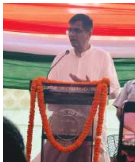
15 August 2024, Chief Justice of India, Dr D Y Chandrachud and Mr Arjun Ram Meghwal, Union Minister of State for Law and Justice attend the 78th Independence Day celebrations, organised by SCBA