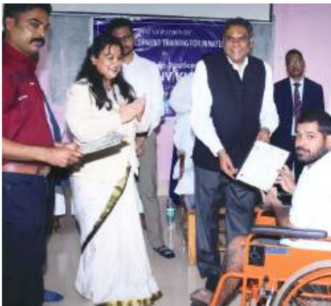
16 - 18 August 2024, Justice Sanjiv Khanna inaugurates Vocational Training Programme on Electronics at Special Jail, Bhubaneswar and distributes certificates to the jail inmates who passed the courses of Journalism and Mass Communication