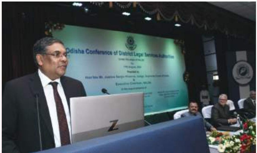
17 August 2024, Justice Sanjiv Khanna addresses the gathering at the “Odisha Conference of District Legal Services Authorities” organised by NALSA at Odisha Judicial Academy, Cuttack, Odisha