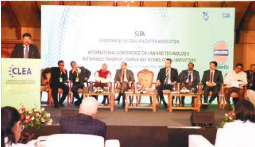
17 August 2024, Justice B R Gavai, addresses the gathering on International Conference by Commonwealth Legal Education Association, on the theme "Law and Technology: Sustainable Transport, Tourism and Technological Innovations," at Kumarakom, Kerala