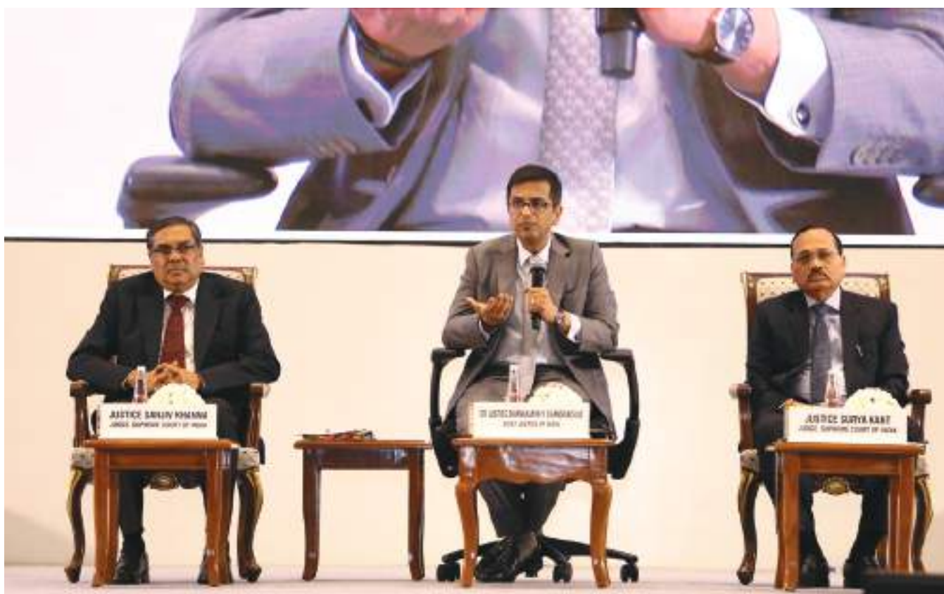
1 September 2024, Chief Justice of India, Dr D Y Chandrachud, Justice Sanjiv Khanna, and Justice Surya Kant, Judges, Supreme Court of India at the panel discussion on 'Bridging The Gap' during the "National Conference of the District Judiciary"

In the final session of the Conference, panelists- the Chief Justice of India, Dr Justice D Y Chandrachud, Justice Sanjiv Khanna, and Justice Surya Kant, Judges, Supreme Court of India interacted with the Judicial officers from across the country to hear their opinions, valuable suggestions and grassroot