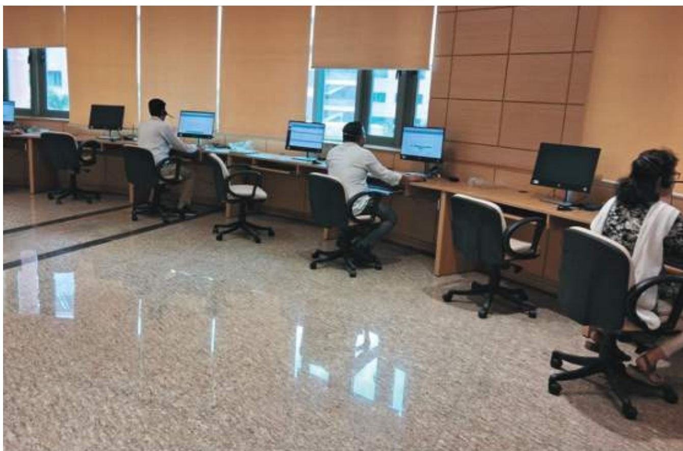
5- 9 August 2024, Training Cell in collaboration with STEP from The Hindu Group, conduct a diagnostic test for the English Language Course for 120 Registry officials