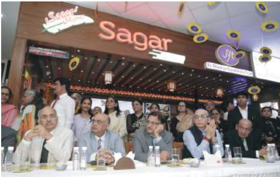
Left to right: 5 August 2024, Justice Pankaj Mithal, Justice Ahsanuddin Amanullah, Justice Abhay S Oka, Judges, Supreme Court of India, inaugurate the opening of a new cafe, 'Sagar Express Cafe,' run by neurodiverse people, in Glass Cafeteria, High Court of Delhi