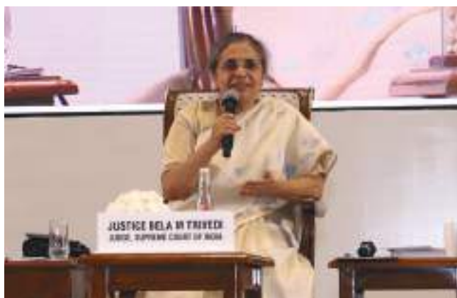
31 August 2024, Justice Bela M Trivedi, Judge, Supreme Court of India, during Session III of "National Conference of the District Judiciary"