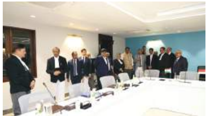
23 August 2024, Chief Justice of India, Dr D Y Chandrachud inaugurates conference hall in the Main Building, Supreme Court of India