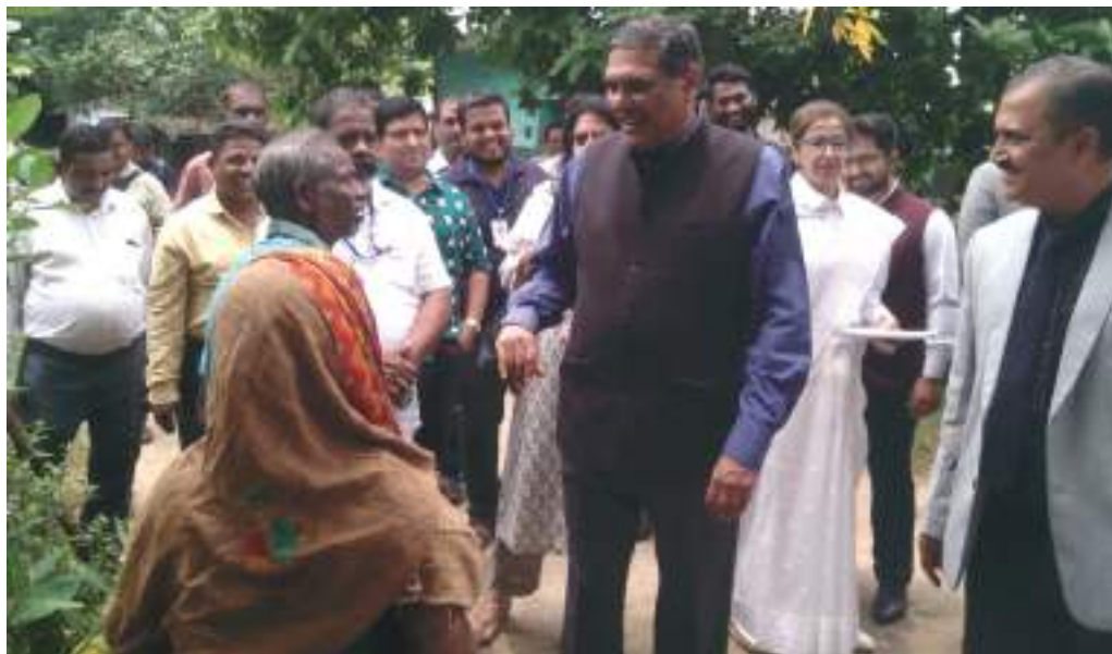
18 August 2024, Justice Sanjiv Khanna interacts with the locals during his visit to the Village Legal Care And Support Centre, Satyabadi, Puri, Odisha