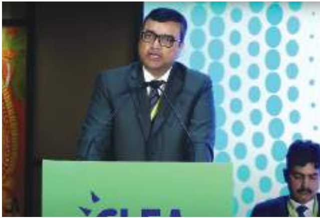
17 August 2024, Justice Dipankar Datta, addresses the gathering during the Technical Session I on Legal and Ethical Frameworks in Transportation and Eco-Tourism at the CLEA International Conference on Law & Technology: Sustainable Transport, Tourism and Technical Innovations at Kumarakom, Kerala