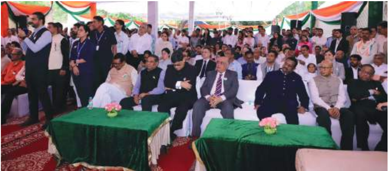
Left to Right: 15 August 2024, Justice B R Gavai, Justice Sanjiv Khanna, Justice Sudhanshu Dhulia, Justice Ahsanuddin Amanullah, Justice P B Varale, Justice Sanjay Kumar, and Justice K V Viswanathan attend the 'Celebration of 78th Independence Day' function organised by the SCBA, at Supreme Court Lawns