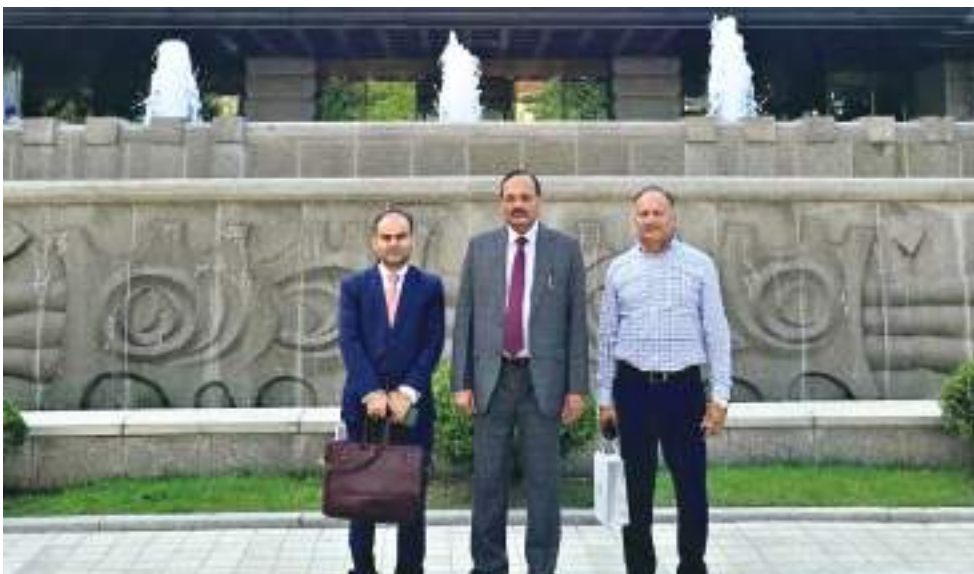
27 August 2024, Justice Surya Kant, at Korea Legislation Research Institute (KLRI), where he spoke on the topic, ‘Cross Border Challenges in Insolvency and Bankruptcy Law’ in “KLRI Programme” Sejong, South Korea