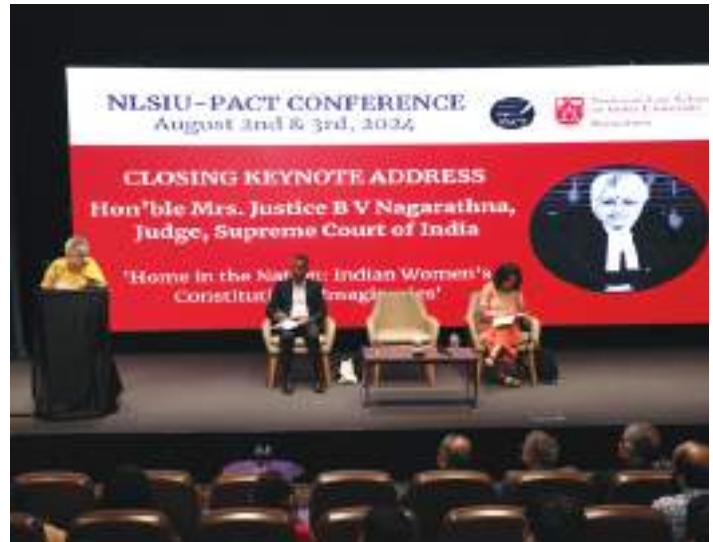
3 August 2024, Justice B V Nagarathna delivers lecture on 'Home in the Nation: Indian Women's Constitutional Imaginaries' at NLSIU-PACT Conference, organised by National Law School of India University, Bengaluru as part of the 'Pluralist Agreement and Constitutional Transformation (PACT) Project' at Prestige Falcon, Brunton Road, Bengaluru