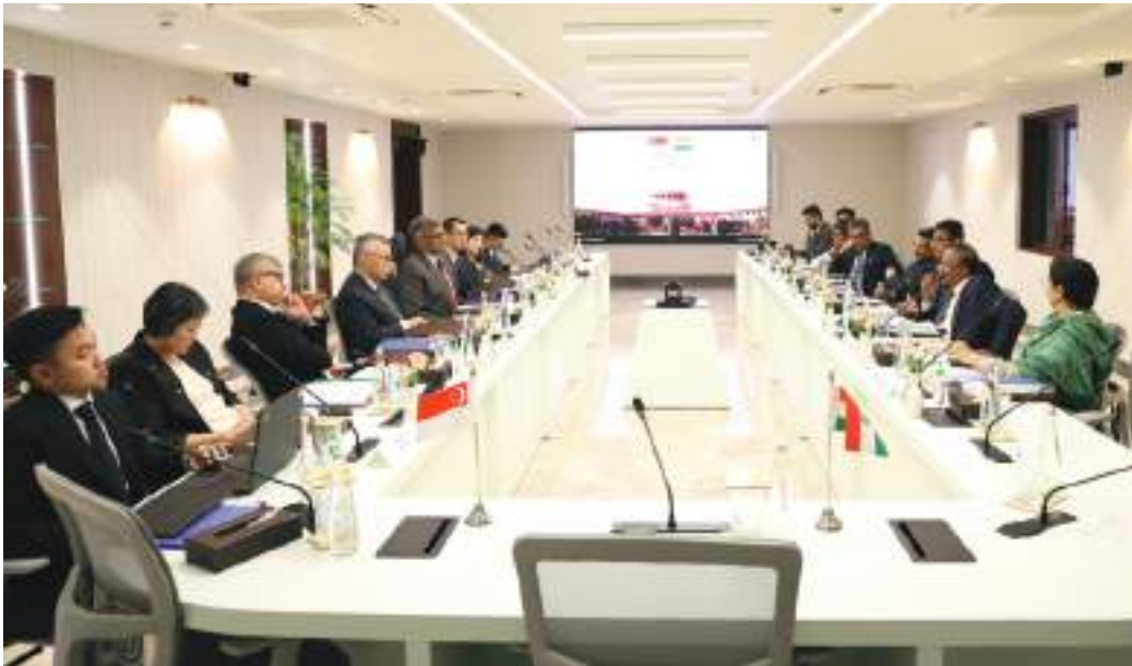
23 August 2024, 2nd India-Singapore Judicial Roundtable at Conference Hall, 2nd Floor, C Block, Administrative Buildings Complex, Supreme Court of India