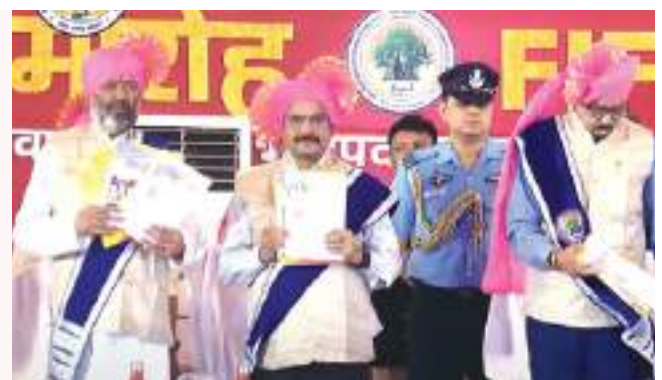
31 August 2024, Justice Prashant Kumar Mishra attends the 5th Convocation of Atal Bihari Vajpayee Vishwavidyalaya, Bilaspur, Chhattisgarh