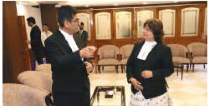
1 August 2024, Chief Justice of India, Dr D Y Chandrachud along with the Judges of the Supreme Court inaugurated the new 'Ladies Lounge' at the first floor, West Wing, Main Building, Supreme Court premises