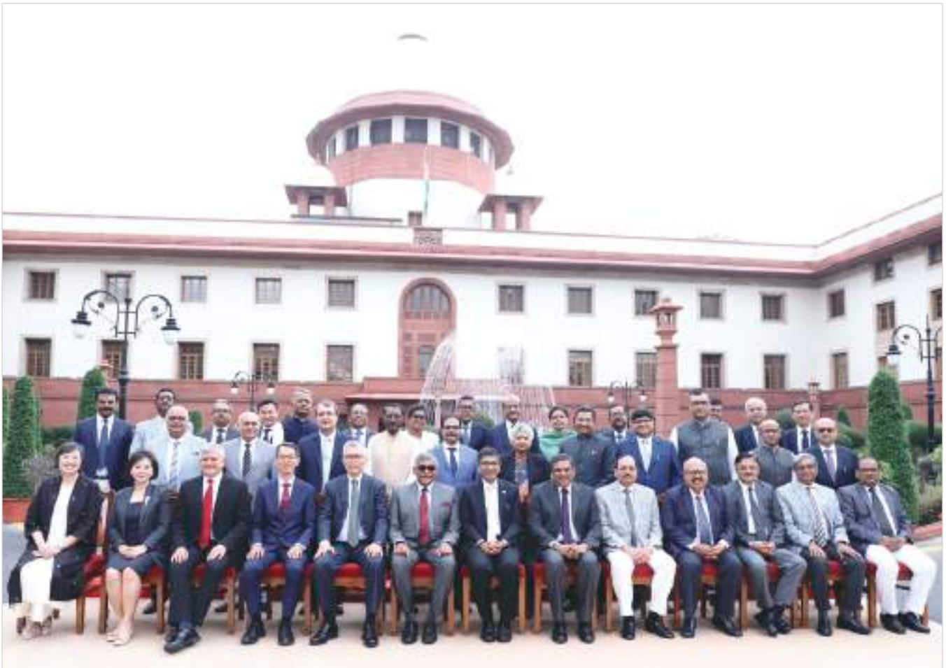
23 August 2024, Chief Justice of India, Dr D Y Chandrachud, Judges, Supreme Court of India, Chief Justice of Singapore, Mr Sundaresh Menon, and the Singapore Delegation at the Supreme Court of India for the “2nd Indo-Singapore Judicial Roundtable”