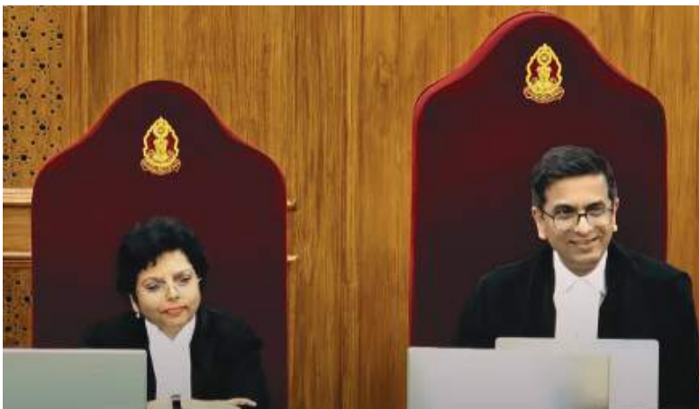
30 August 2024, Chief Justice of India, Dr D Y Chandrachud and Justice Hima Kohli during the ceremonial bench proceedings in Courtroom No 1, Supreme Court of India