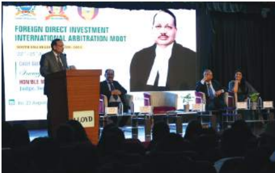
23 August 2024, Justice Surya Kant delivers a keynote address at the “South Asia Regional Round of Foreign Direct Investment International Arbitration Moot, 2024” organised by Lloyd Law College, Greater Noida