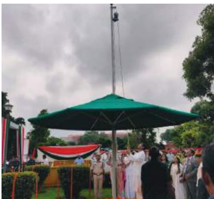
15 August 2024, Chief Justice of India, Dr D Y Chandrachud hoists the National Flag at the Supreme Court of India on the occasion of 78th Independence Day of the country, organised by SCBA