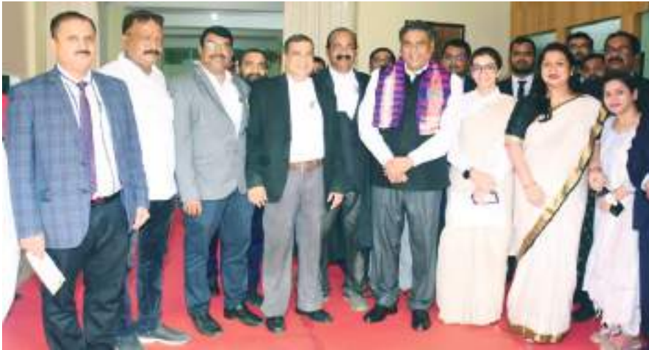
16 – 18 August 2024, Justice Sanjiv Khanna visits Office of Legal Aid Defense Counsel at Bhubaneswar