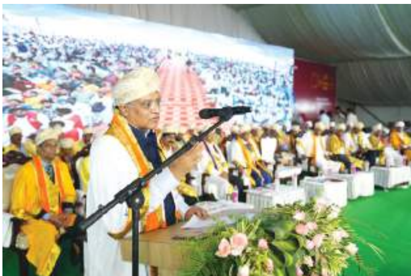
24 August 2024, Justice P S Narasimha, Chief Guest, delivers an address at the 12th Convocation Ceremony, VIGNAN (Deemed to be University), Guntur