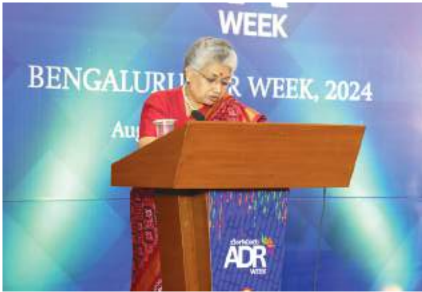
24 August 2024, Justice B V Nagarathna delivers inaugural address on the theme, 'Expanding the Horizon: Marching Towards World Class Arbitral Institution' in Bengaluru ADR Week 2024 organised by the Arbitration and Conciliation Centre, Bengaluru (Domestic and International), Karnataka Judicial Academy, and the Advocates' Association Bengaluru in association with the Bengaluru ADR Week Committee, at Karnataka Judicial Academy, Bengaluru