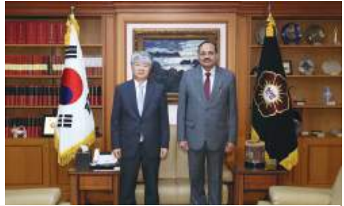
25 - 29 August 2024, Justice Surya Kant along with the Chief Justice of Supreme Court of Republic of Korea (ROK), Justice Cho Hee-dae and Chief Justice of Constitutional Court of ROK, Justice Lee Jongseok, at the Supreme Court and the Constitutional Court of ROK. Justice Kant had insightful and engaging discussions on several topics including judicial reforms and use of technology in the judiciary, during the visit