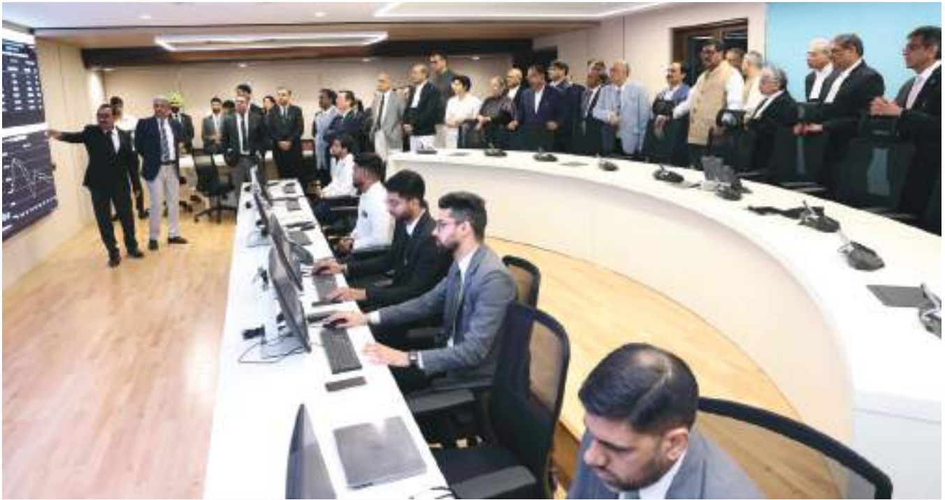
23 August 2024, Chief Justice of India and Judges of Supreme Court inaugurate the newly created War Room, Ground Floor, Main Building, Supreme Court of India