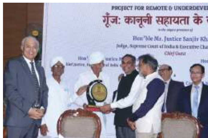
10 August 2024, Justice Sanjiv Khanna inaugurates 'Legal Services Information Board of DSLISA' and 'Legal Services Clinic' at Panchayat Ghar of Jaunti village, New Delhi