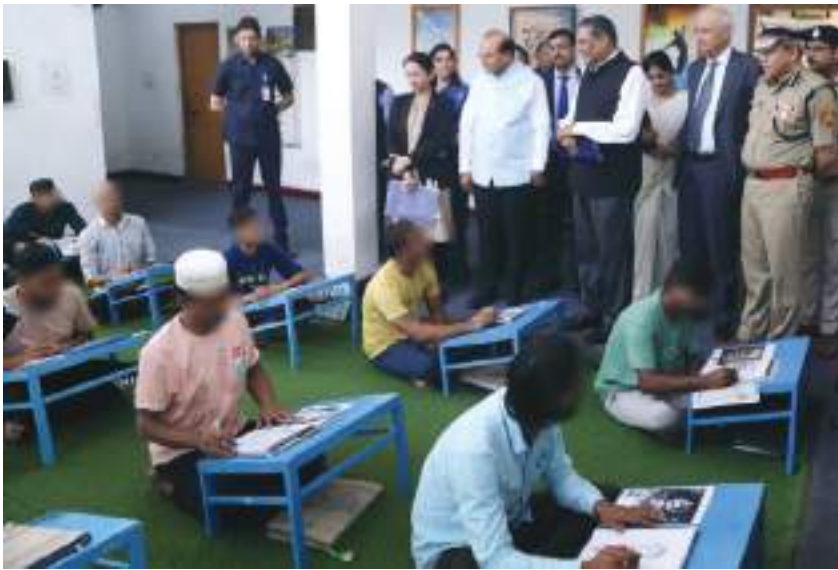
10 August 2024, Justice Sanjiv Khanna visits Jail No. 4, Central Jail, Tihar Complex organised by Delhi State Legal Services Authority