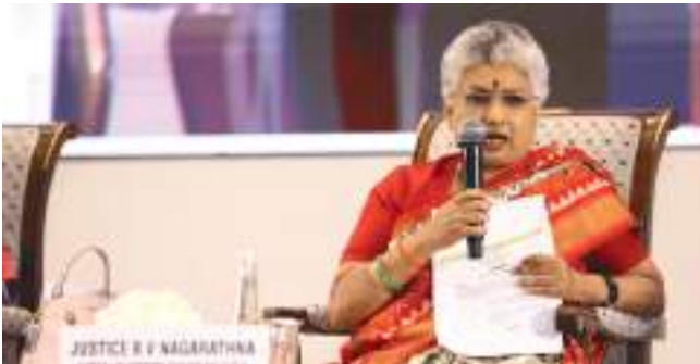
31 August 2024, Justice Nagarathna, Judge, Supreme Court of India, discusses her experiences as a Judge and advocates the policies that ensure inclusivity at all levels in the judiciary