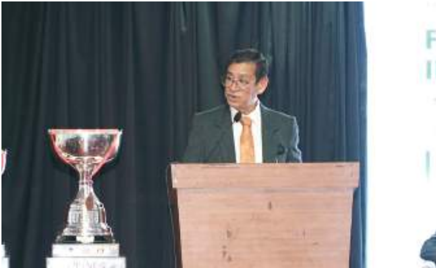
25 August 2024, Justice N Kotiswar Singh, Chief Guest, delivers valedictory address at the “South Asia Regional Rounds of the Foreign Direct Investment International Arbitration Moot, 2024” organised by Lloyd Law College, Greater Noida