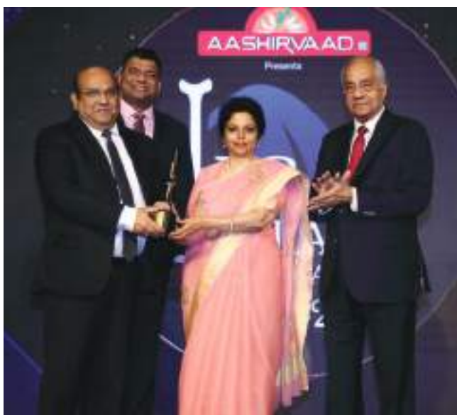
4 May 2024, Justice Hima Kohli, Chief Guest, attends the 13th Indian Legal Awards 2023-24