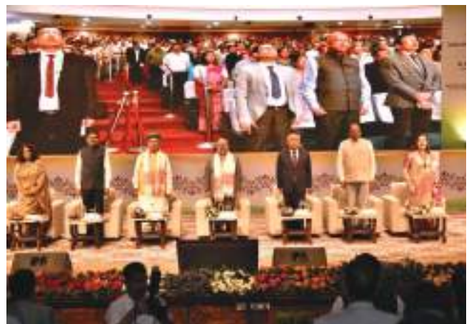
18 May 2024, Justice Hrishikesh Roy at the Conference on India's Path in the Administration of Criminal Justice system at IIT Guwahati, Assam