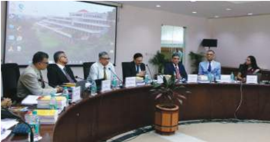
19 May 2024, Justice Abhay S Oka, chairs Session IV - Designing Curriculum for Specific Judicial Needs at National Judicial Academy, Bhopal