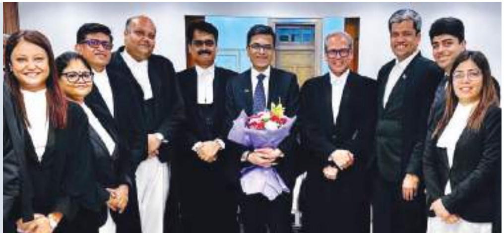
2 May 2024, the newly elected Executive Committee of SCAORA presents a bouquet to the Chief Justice of India, Dr D Y Chandrachud