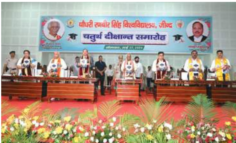
27 May 2024, Justice Surya Kant, Chief Guest, at the fourth convocation ceremony at Chaudhary Ranbir Singh University (CRSU), Jind