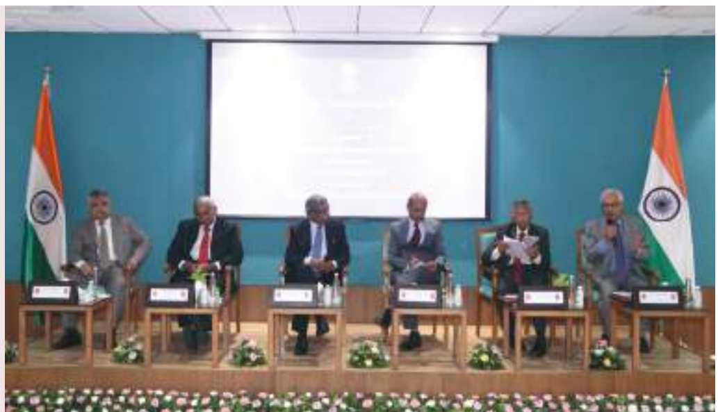
18 May 2024, Justice Rajesh Bindal and Justice Vikram Nath in Panel II : Regulatory Aspects of Forensic Sciences Sector of the High Power Expert Group meeting on strengthening criminal justice system through enhanced forensic efficiency organised by National Forensic Sciences University, Gandhinagar