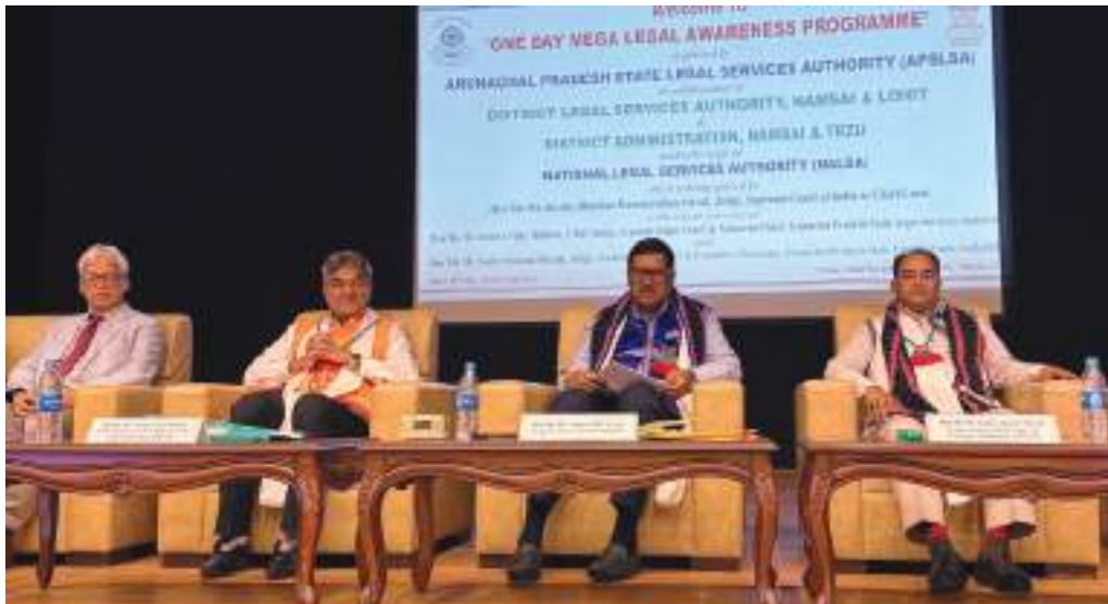
25 May 2024, Justice B R Gavai at the “Mega legal awareness programme” organised by the Arunachal Pradesh State Legal Services Authority (APSLA), Namsai