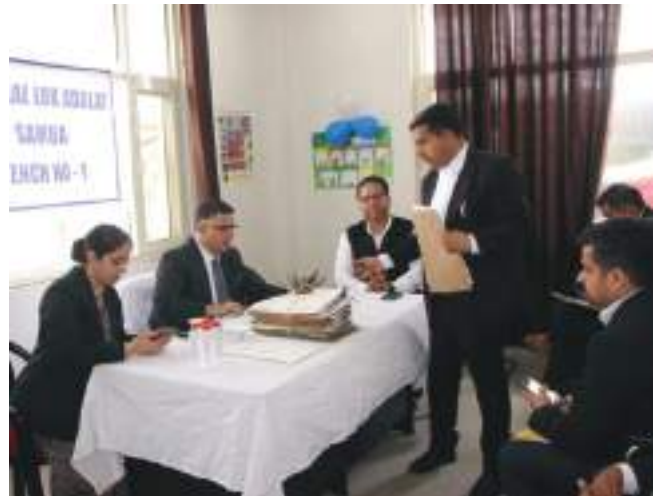
11 May 2024, 2nd National Lok Adalat for the year 2024 being undertaken in Samba, Jammu and Kashmir