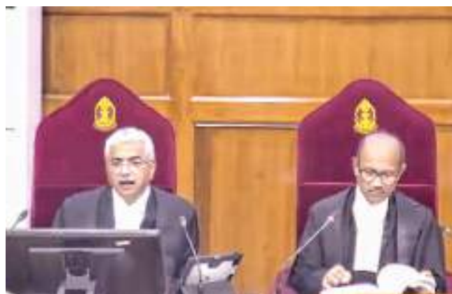
Vacation Bench in session in Courtroom No 13

While the Supreme Court of India observes its scheduled vacation, it paradoxically takes on more work than on normal days. Demonstrating its institutional commitment, the Court remains accessible through three vacation benches each day, ensuring that doors to justice are always open. Even during these