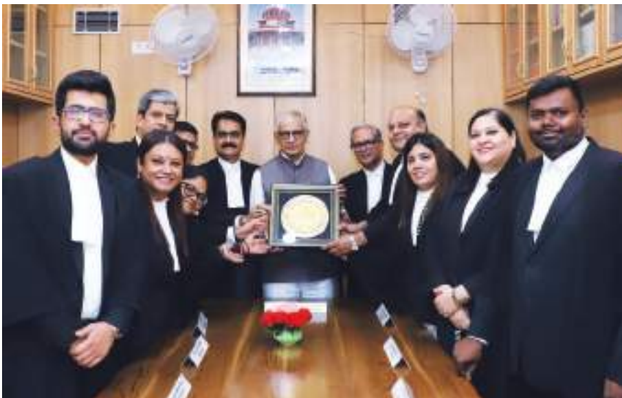
15 May 2024, the SCAORA Executive Committee presents a memento to Justice A S Bopanna on the occasion of his retirement