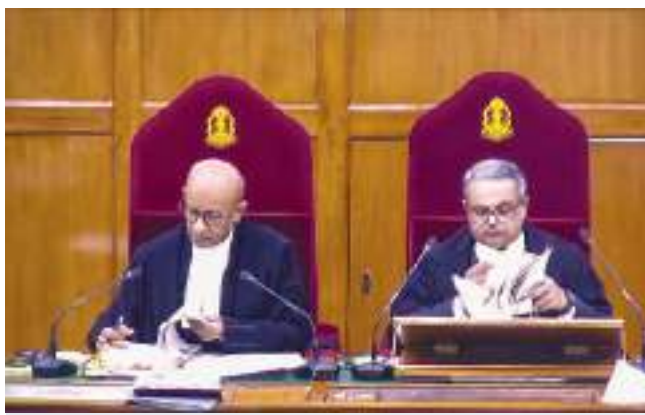
Vacation Bench in session in Courtroom No 12

While the Supreme Court of India observes its scheduled vacation, it paradoxically takes on more work than on normal days. Demonstrating its institutional commitment, the Court remains accessible through three vacation benches each day, ensuring that doors to justice are always open. Even during these