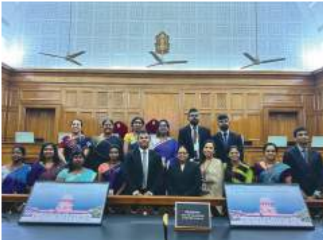
9 - 13 May 2024, the Supreme Court of India conducts a four-day training program for the delegation consisting of 15 officials of the Supreme Court of Sri Lanka