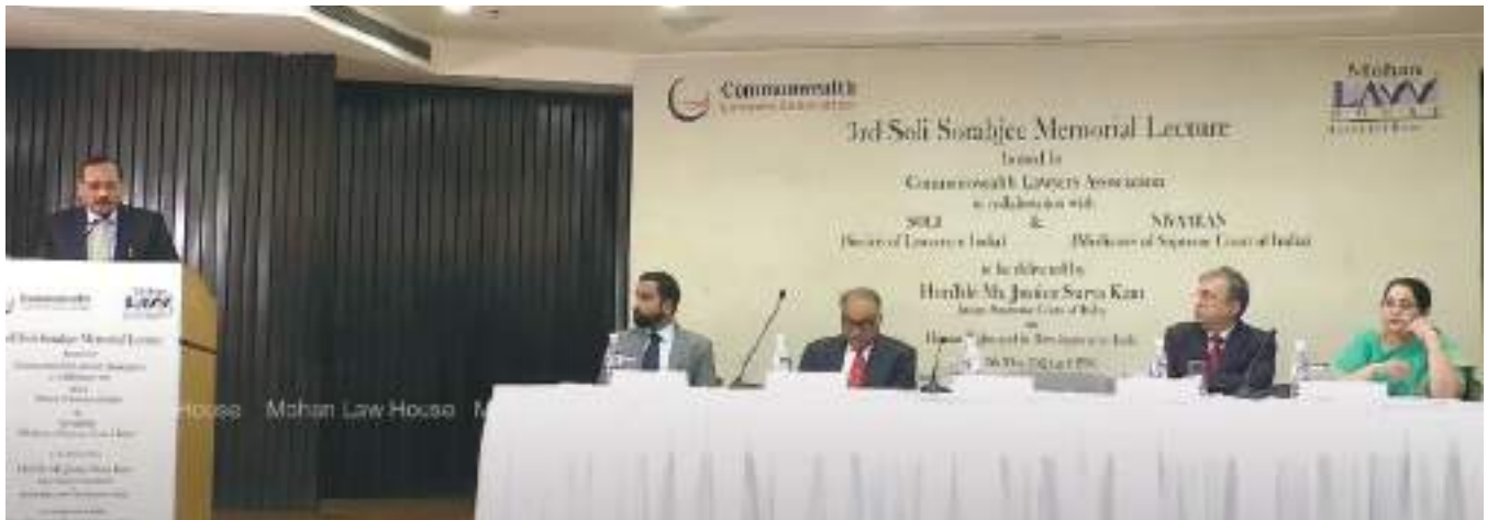
7 May 2024, Justice Surya Kant delivers a lecture on 'Human Rights and its Development in India' in the 3rd Soli Sorabjee Memorial Lecture organised by the Commonwealth Lawyers Association in collaboration with SOLI (Society of Lawyers in India) and NIVAARAN (Mediators of Supreme Court of India)