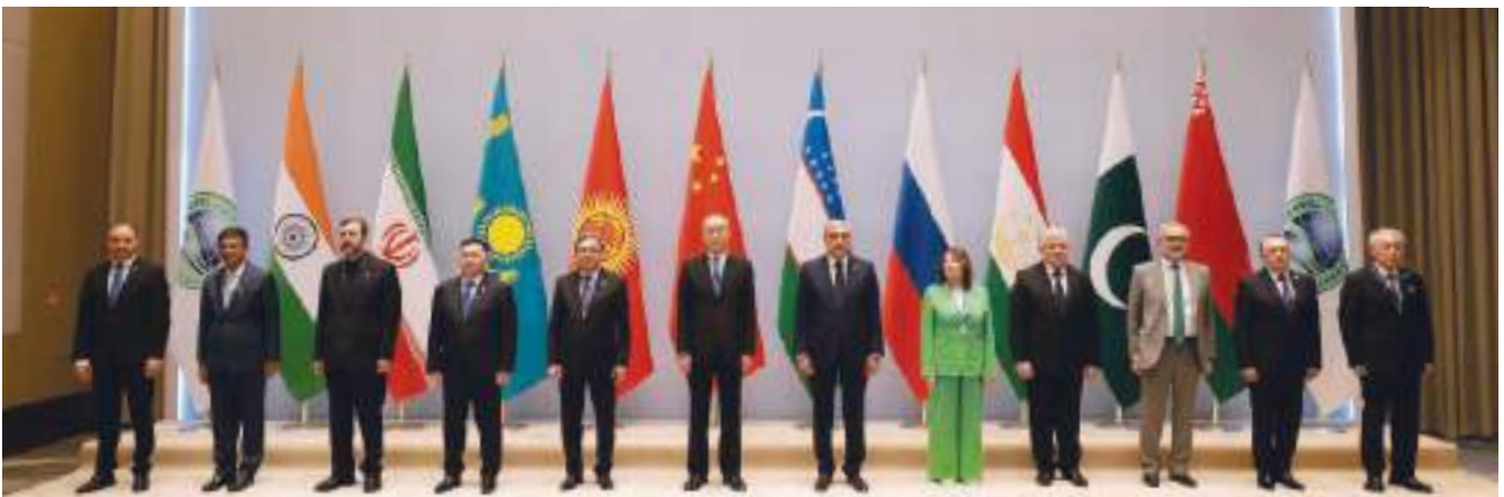
23 May 2024, Chief Justice of India, Dr D Y Chandrachud at the "XIX Meeting of Chief Justices/Chairpersons of the Supreme Courts of the Shanghai Cooperation Member States," at Tashkent, Uzbekistan