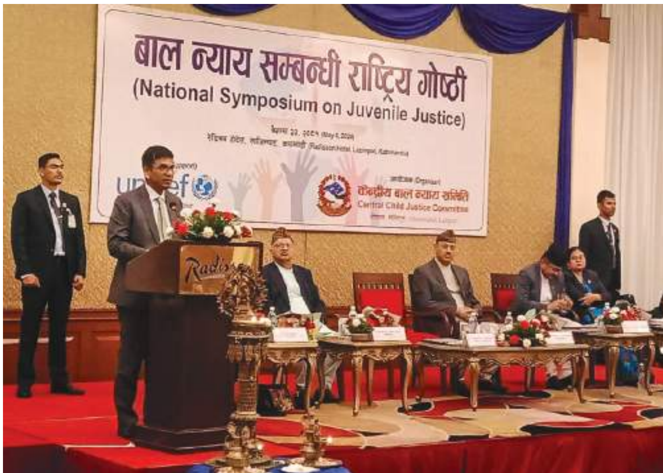
4 May 2024, Chief Justice of India, Dr D Y Chandrachud delivers a keynote address at “National Symposium on Juvenile Justice,” Nepal