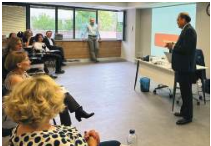
30 May 2024, Justice Surya Kant at the event organised by Energy Dispute Arbitration Centre in partnership with Ankara Bar Association, Turkey