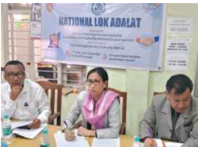
11 May 2024, 2nd National Lok Adalat for the year 2024 being undertaken in Lamphelpat, Imphal, Manipur