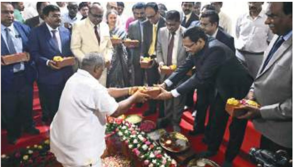
22 May 2024, Justice M M Sundresh at the foundation stone laying function for the construction of 10 Bungalows for the Judges; five storey building for the court halls; Judges' Chambers; Sections/Offices; and Record Room in the Old Law College Campus, Chennai