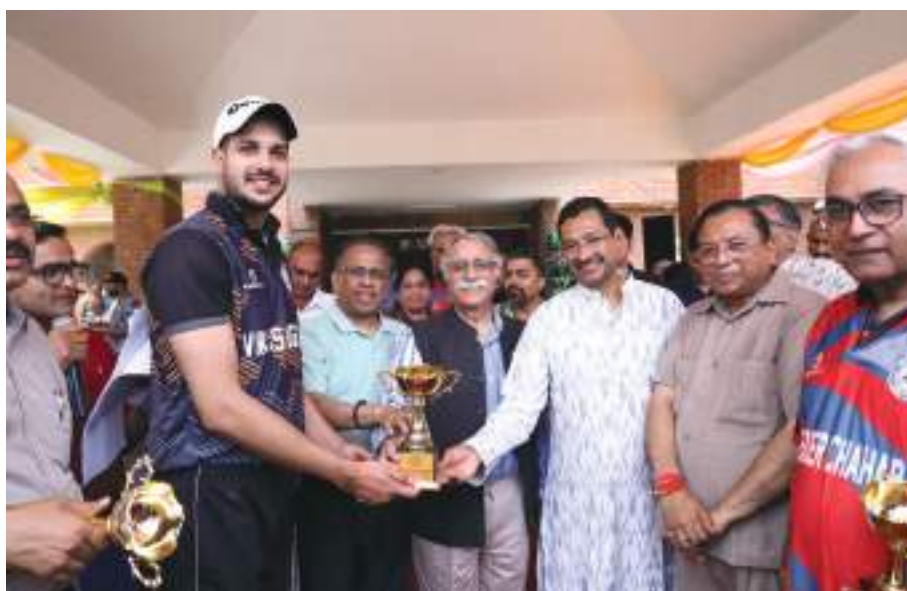
11 May 2024, Justice M M Sundresh, Justice Sanjay Karol, and Justice K V Viswanathan present the trophies to the winning team and other players at the SCBA Cricket Tournament held at Modern School, Barakhamba Road