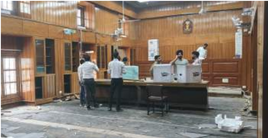
Courtroom no 6 among other courtrooms including 7, 8, and 9 being renovated to make them futuristic and technologically advanced during vacation

important centre, critical for managing overall court operations. There is also an ongoing effort to install two Justice clocks between Gates B & C and between Gates D & E, which will display the statistical information such as institution, disposal and pendency of cases in the Supreme Court of India, to the general public.