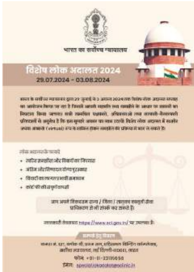
Bilingual posters of Special Lok Adalat to be held by Supreme Court of India from 29 July 2024 to 3 August 2024