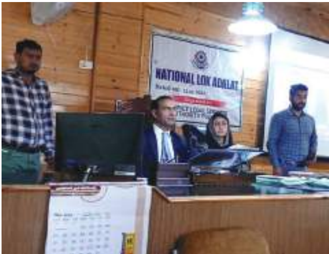
11 May 2024, 2nd National Lok Adalat for the year 2024 being undertaken in Pulwama, Jammu and Kashmir

labour disputes, and other civil cases. Pending court cases and pre-litigation cases were also taken up and settled. As per the data, 11,00,669 cases (including 6,94,450 pending cases and 4,06,219 pre-litigation cases) were settled in this particular Lok Adalat, wherein the total settlement amount was recorded to be around ₹ 3,525.77 crores.