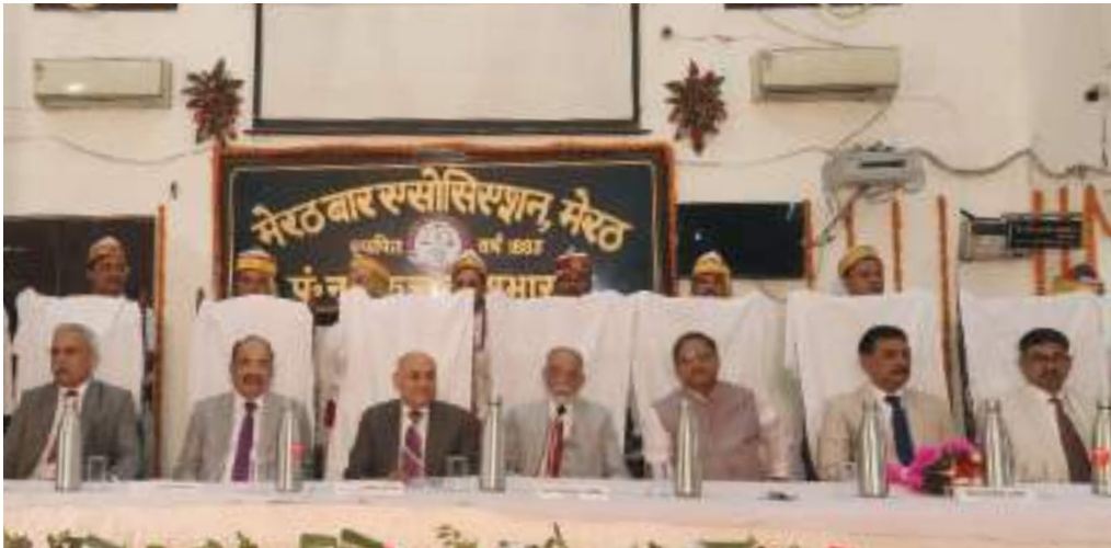
18 May 2024, Justice Pankaj Mithal at the felicitation ceremony of lawyers who put 50 years and more in the legal profession, organised by the Bar Association, Meerut, UP