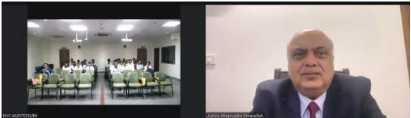
8 May 2024, Justice Ahsanuddin Amanullah, virtually delivers a lecture on 'Importance of Ethics in Professions' organised by the LV Prasad Eye Institute, Vijayawada, Andhra Pradesh