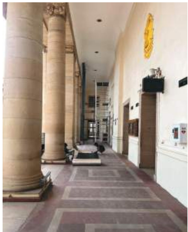
Ongoing repairs at Supreme Court during summer vacation

the West Wing of the Court. A state-of-the-art Command and Control Centre, also referred to as a ‘War Room’, is being constructed which will be equipped with advanced monitoring and communication systems. This will serve as an