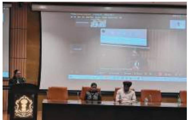
21-22 May 2024, Training cell in collaboration with Department of Personnel & Training (DoPT) conducts a training session on implementing e-HRMS 2.0 for Registry officers of the Supreme Court of India which was attended by 555 participants (266 in physical mode and 289 in virtual mode)

In the month of May, 2024, eleven 40-hour Mediation Training Programmes (MTP) and two 20-hour Refresher Programmes (RP) were conducted under the aegis of the Mediation and Conciliation Project Committee, Supreme