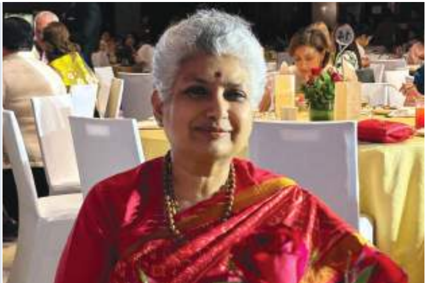
8 - 10 May 2024, Justice B V Nagarathna at the 2024 "Asia and the Pacific Regional Conference of the International Association of Women Judges and 2024 National Convention of the Philippine Women Judges Association," Philippines