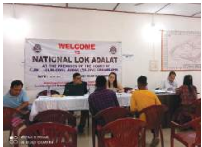
11 May 2024, 2nd National Lok Adalat for the year 2024 being undertaken in Changlang, Arunachal Pradesh