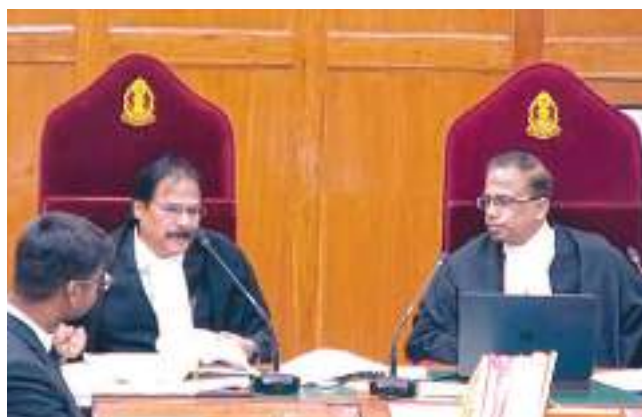
Vacation Bench in session in Courtroom No 14

breaks, urgent matters, bail cases, and other critical petitions are promptly addressed. During this period, the Court efficiently undertakes projects requiring less footfall, such as renovations, necessary repairs, and technological advancements, benefiting from reduced digital traffic. To understand the Supreme Court's operations during vacation, Supreme Court Chronicle embarked on a mission to focus on major branches that continue their