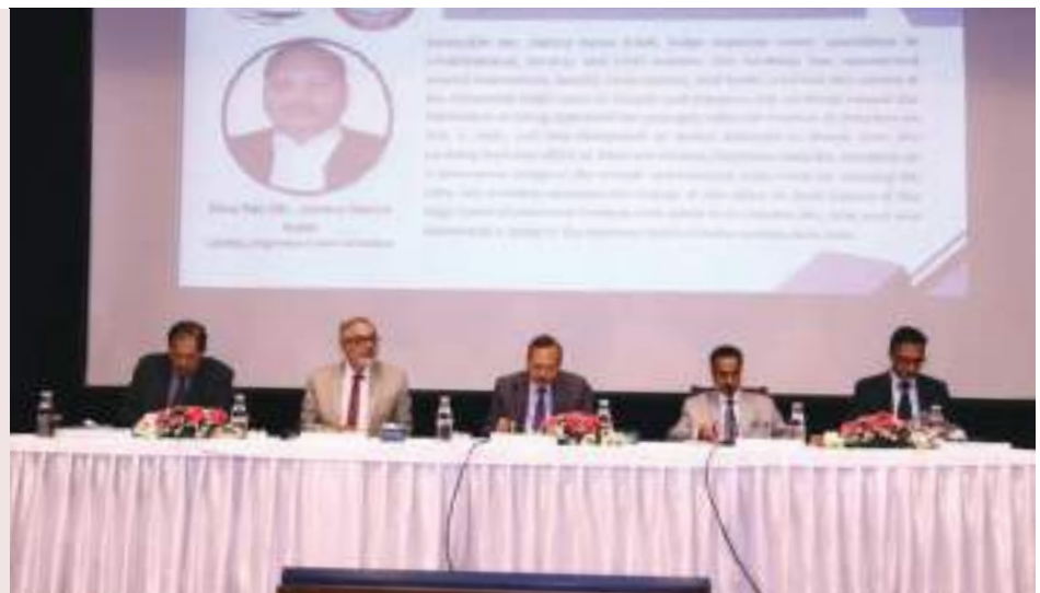
26 May 2024, Justice Surya Kant, Chief Guest, attends the Law Summit organised by the Chandigarh Judicial Academy in collaboration with IIM Rohtak