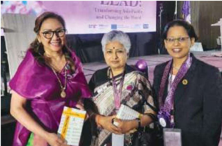
8 - 10 May 2024, Justice B V Nagarathna, at Session I- 'Initiatives of Women Judges towards Gender Parity at All Levels of the Judiciary' in the 2024 "Asia and the Pacific Regional Conference of the International Association of Women Judges and 2024 National Convention of the Philippine Women Judges Association," at Cebu City, Philippines