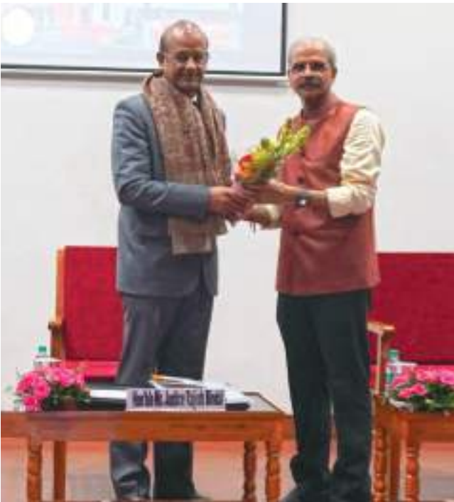
6 April 2024, Justice Rajesh Bindal inaugurates the 2nd National Conference on the theme “Legal Education, Profession and Integrating Pro Bono Culture for Better Access to Justice” at Rajiv Gandhi School of Intellectual Property Law, IIT Kharagpur, West Bengal