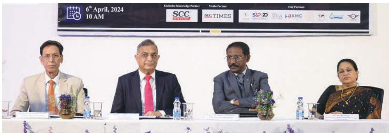
6 April 2024, Justice C T Ravikumar attends the final round and the valedictory ceremony as the Chief Guest at the National Moot Court Competition, 2024, School of Law, Delhi Metropolitan Education, Noida