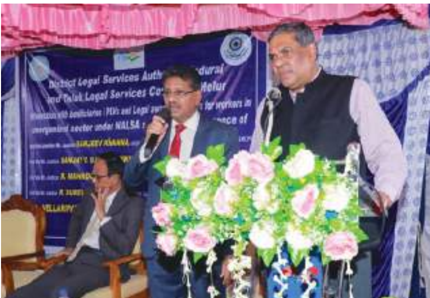
28 April 2024, Justice Sanjiv Khanna, Executive Chairman, NALSA, interacts with the villagers during the Legal Aid Camp organised at Vellaripatti village, Madurai, Tamil Nadu