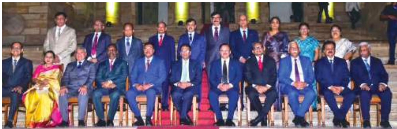
5 April 2024, the Chief Justice of India, Dr D Y Chandrachud, Justice B R Gavai, Justice Abhay S Oka, and Justice P B Varale attend the inaugural centenary year celebration program of the High Court Bar Association, Nagpur