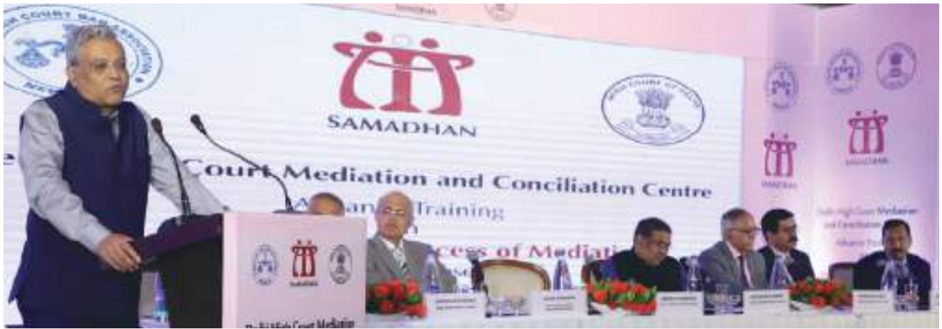
5-6 April 2024, Justice P.S.Narasimha delivers a special address at the inaugural session of Samadhan in the presence of Justice Sanjiv Khanna and Justice Sanjay Karol at Delhi High Court Mediation and Conciliation Centre, advance training on “The Concept and Process of Mediation” at Agra, UP