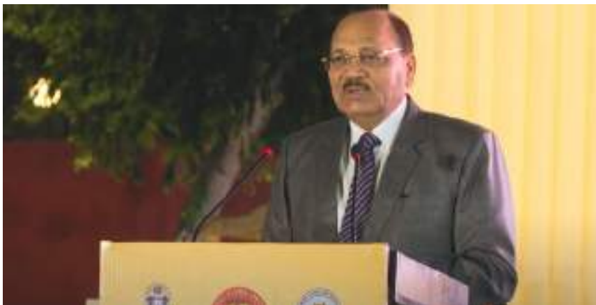
13 April 2024, Justice Surya Kant shares the contributions of Justice V R Krishna Iyer at the Justice V R Krishna Iyer Memorial Lecture, New Delhi