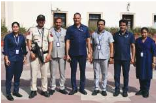
Security personnel deployed outside courtroom corridors ensuring security within the premises