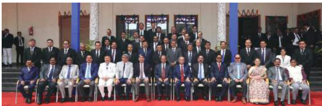
20 April 2024, Justice Rajesh Bindal, Chief Guest, attends the State Level Conference on Case Management: Inculcating Public Trust and Confidence organised by the Judicial Academy, Ranchi, Jharkhand