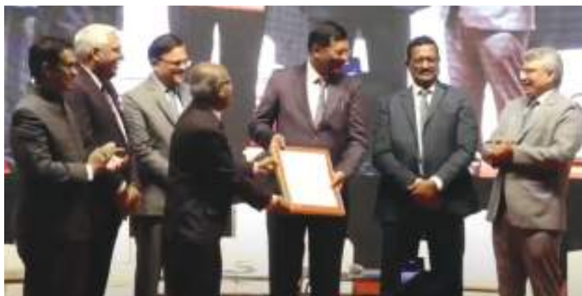
6 April 2024, Justice B R Gavai, Justice Abhay S Oka, and Justice P B Varale attend the felicitation program of the designated Senior Advocates and Advocates (HCBA Members) with 50 years of practice held at Vasant Rao Deshpande Hall, Civil Lines, Nagpur