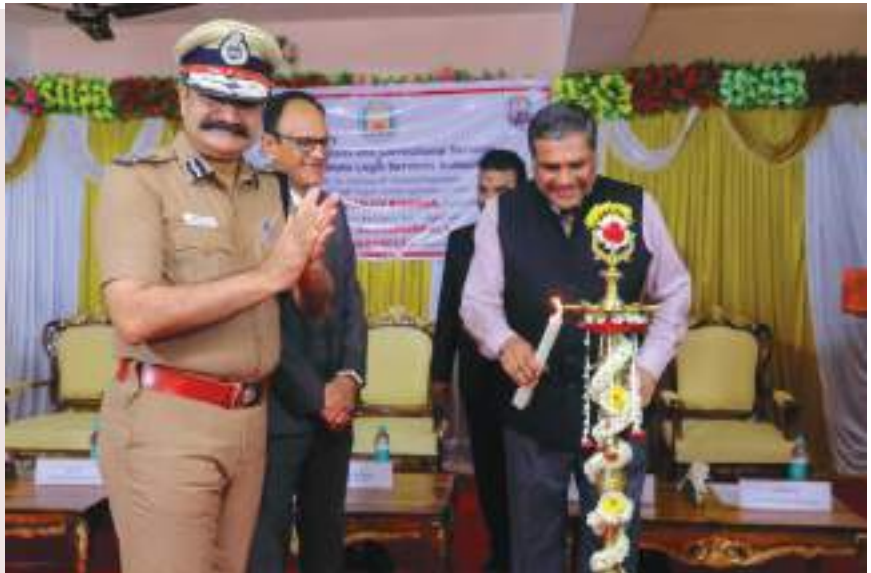
28 April 2024, Justice Sanjiv Khanna at the inauguration of the Convict Paralegal Volunteer Training Programme, "PATAM Project" conceptualised by the PRISM, NGO in collaboration with DLSA Madurai and prison authorities at the Madurai Central Prison, Tamil Nadu