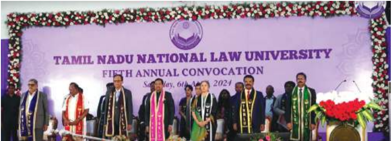
6 April 2024, Justice M M Sundresh attends the fifth Annual Convocation of the Tamil Nadu National Law University, Tiruchirapalli