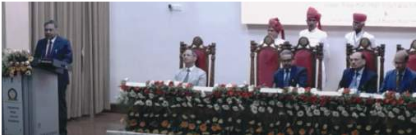
6 April 2024, Justice Surya Kant, Justice Augustine George Masih and Justice Sandeep Mehta at the valedictory session of One Year Induction & Training Programme of Judicial Officers at Rajasthan State Judicial Academy, Jodhpur