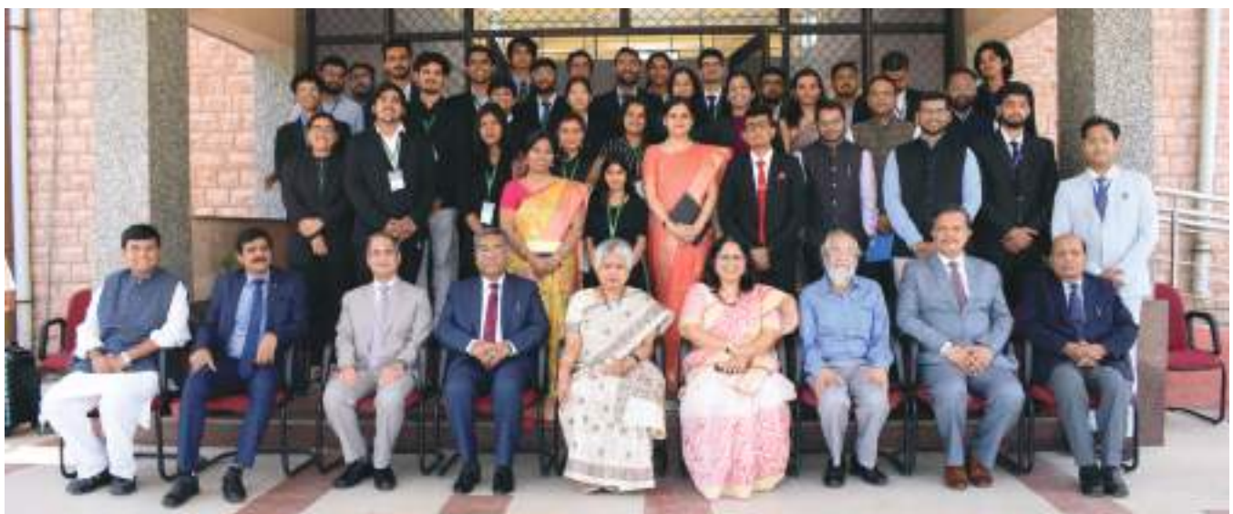
21 April 2024, Justice B V Nagarathna delivers a lecture on the theme "Celebrating 75th Years of Indian Supreme Court" at the National Conference organised by the National Law University, Jodhpur