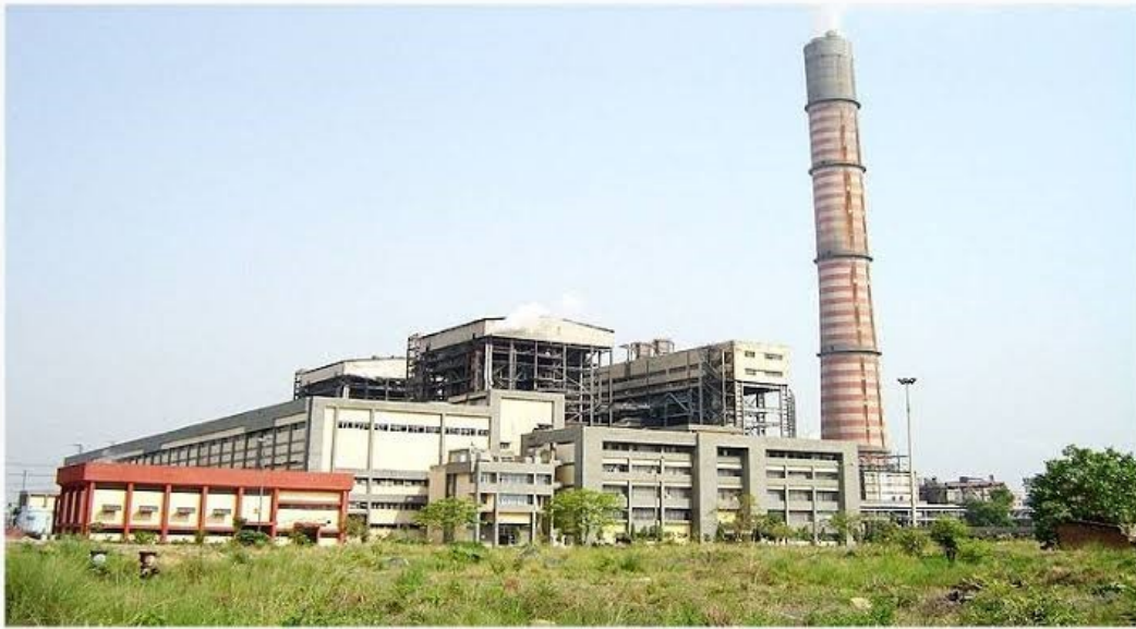
Tenughat Vidyut Nigam Limited (TVNL) 2*210 MW Power Plant