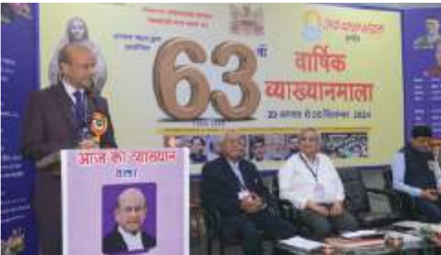
31 August 2024, Justice Rajesh Bindal, Judge, Supreme Court of India, delivers a lecture during the 63rd Annual Lecture series by the Abhyas Mandal, at Indore, Madhya Pradesh