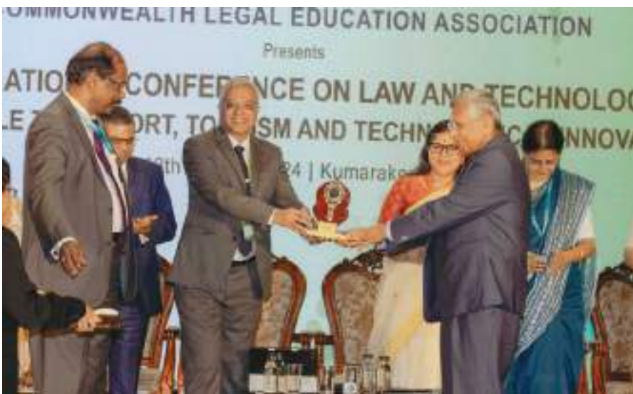
17 August 2024, Justice P S Narasimha chairs Technical Session II: Regulatory Challenges and Innovations in Transportation Technologies and Eco-Tourism in the CLEA Conference at Kumarakom, Kerala