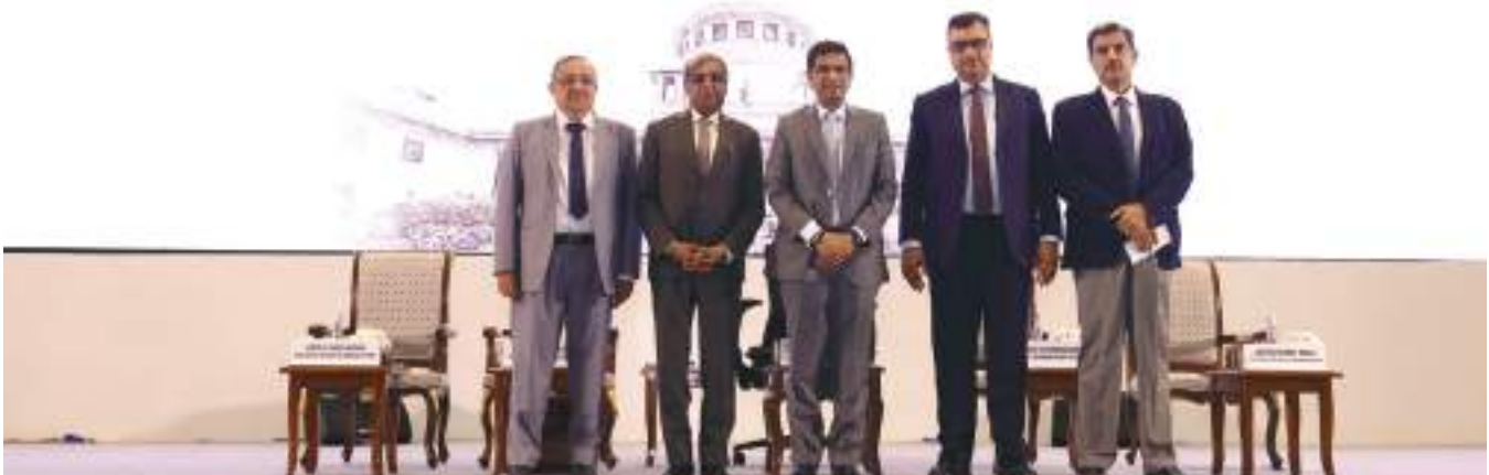
1 September 2024, Chief Justice of India, Dr D Y Chandrachud, Justice Vikram Nath, Justice Dipankar Datta, Judges, Supreme Court of India, Chief Justice of the High Court of Patna, Justice K Vinod Chandran, and Chief Justice of the High Court of Punjab and Haryana, Justice Sheel Nagu at the panel discussion on 'Case Management' during the "National Conference of the District Judiciary"