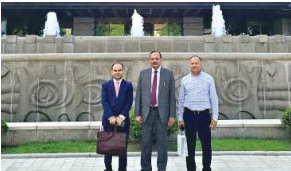
27 August 2024, Justice Surya Kant, at Korea Legislation Research Institute (KLRI), where he spoke on the topic, ‘Cross Border Challenges in Insolvency and Bankruptcy Laws’ in “KLRI Programme” Sejong, South Korea