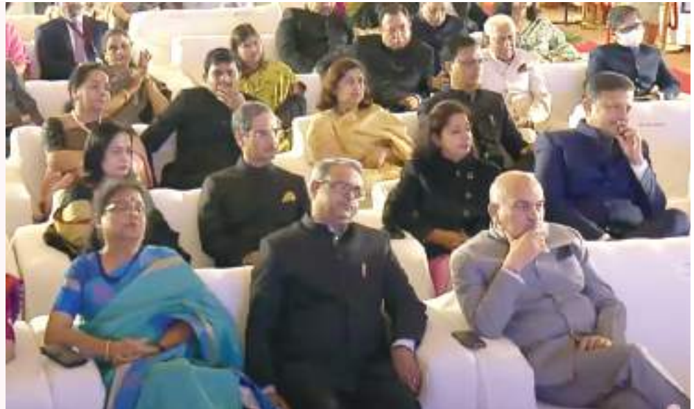
25 August 2024, Justice Pankaj Mithal and Justice A G Masih, Judges, Supreme Court of India, attend the “Platinum Jubilee Celebration of Rajasthan High Court,” organised by Rajasthan High Court at Rajasthan High Court, Jodhpur