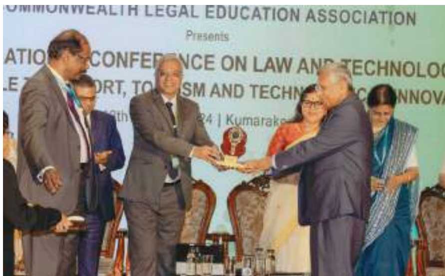
17 August 2024, Justice P S Narasimha chairs Technical Session II: Regulatory Challenges and Innovations in Transportation Technologies and Eco-Tourism in the CLEA Conference at Kumarakom, Kerala