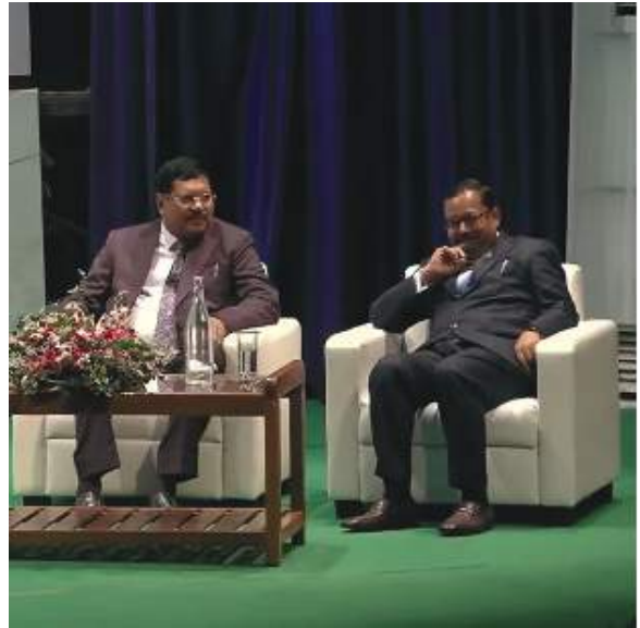
3 August 2024, Justice B R Gavai and Justice Ujjal Bhuyan at the S N Bhuyan Centenary Lecture