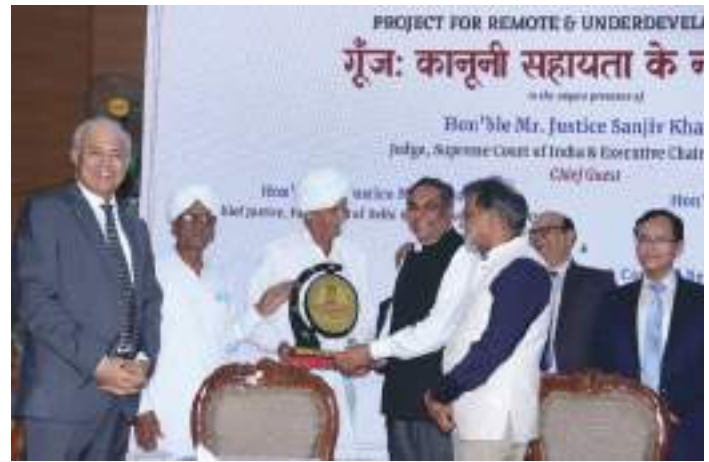
10 August 2024, Justice Sanjiv Khanna inaugurates 'Legal Services Information Board of DSLISA' and 'Legal Services Clinic' at Panchayat Ghar of Jaunti village, New Delhi