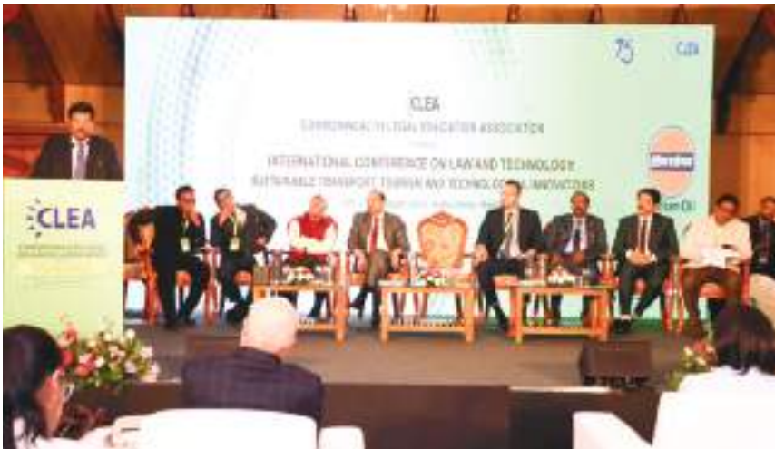
17 August 2024, Justice B R Gavai, addresses the gathering on International Conference by Commonwealth Legal Education Association, on the theme "Law and Technology: Sustainable Transport, Tourism and Technological Innovations," at Kumarakom, Kerala