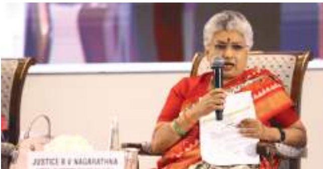
31 August 2024, Justice Nagarathna, Judge, Supreme Court of India, discusses her experiences as a Judge and advocates the policies that ensure inclusivity at all levels in the judiciary