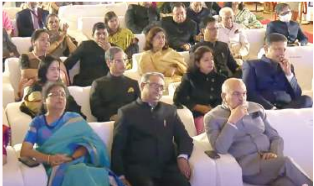
25 August 2024, Justice Pankaj Mithal and Justice A G Masih, Judges, Supreme Court of India, attend the “Platinum Jubilee Celebration of Rajasthan High Court,” organised by Rajasthan High Court at Rajasthan High Court, Jodhpur