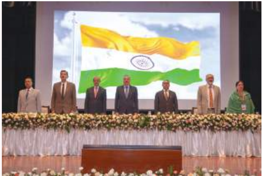
10-11 August 2024, Justice Surya Kant, Justice Rajesh Bindal and Justice A G Masih along with the Chief Justices of various High Courts attend the "National Conference at Punjab and Haryana High Court," Chandigarh