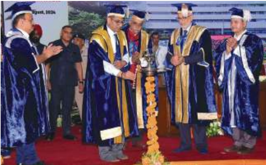
11 August 2024, Chief Justice of India, Dr D Y Chandrachud, lights the ceremonial lamp at 37th Convocation of PGIMER, Chandigarh