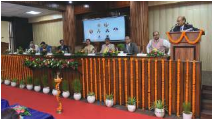
4 August 2024, Justice Rajesh Bindal, Chief Guest, inaugurates a three-day orientation programme titled “Deeksharambh” at Dr B R Ambedkar National Law University, Sonapat, Haryana