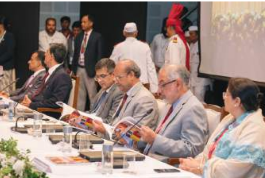
10 - 11 August 2024, Chief Justice of India, Dr D Y Chandrachud and Justice Rajesh Bindal at the "National Conference at Punjab and Haryana High Court," Chandigarh