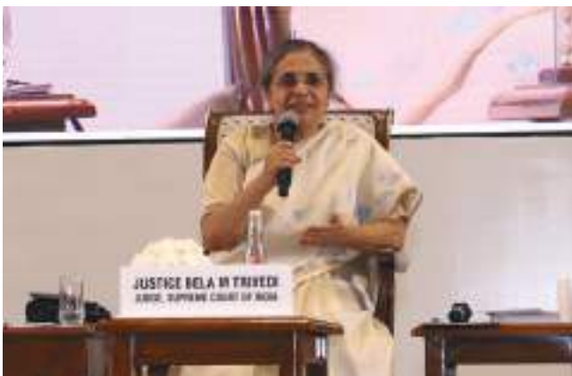
31 August 2024, Justice Bela M Trivedi, Judge, Supreme Court of India, during Session III of "National Conference of the District Judiciary"