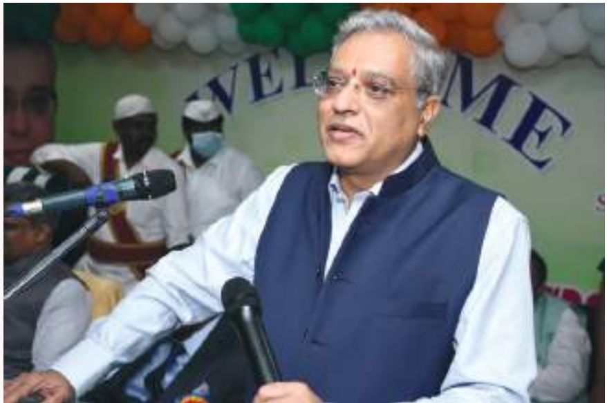
24 August 2024, Justice P S Narasimha visits the District Court Guntur and addresses the Guntur Bar Association