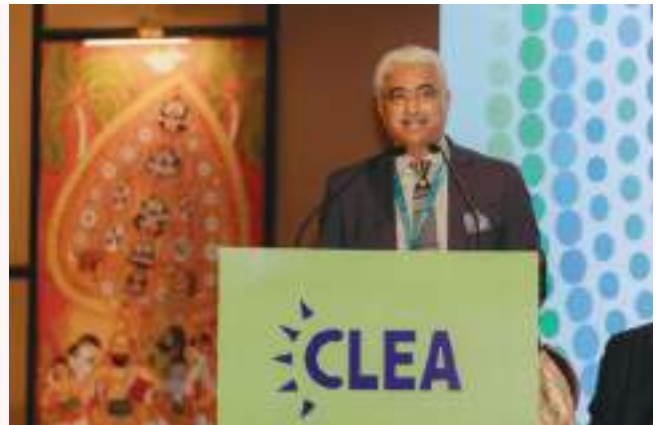
17 August 2024, Justice Aravind Kumar co-chair, addresses the gathering during the Technical Session I: Legal and Ethical Frameworks in Transportation and Eco-Tourism at the CLEA International Conference on Law & Technology: Sustainable Transport, Tourism and Technical Innovations at Kumarakom, Kerala