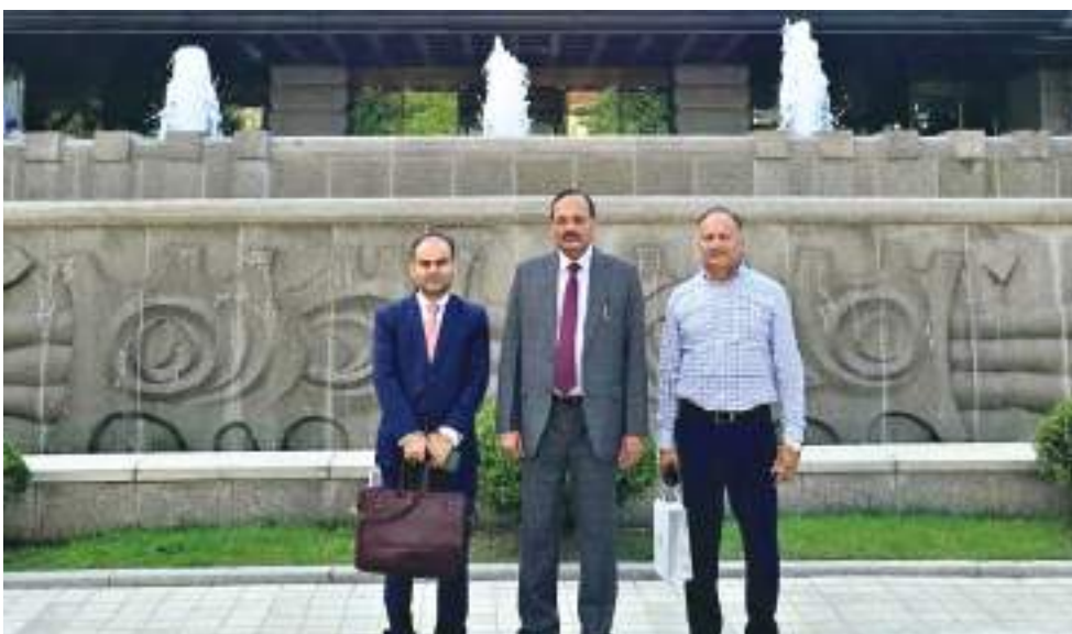
27 August 2024, Justice Surya Kant, at Korea Legislation Research Institute (KLRI), where he spoke on the topic, ‘Cross Border Challenges in Insolvency and Bankruptcy Law’ in “KLRI Programme” Sejong, South Korea