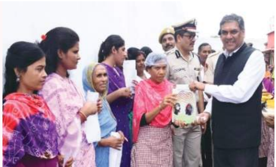
16 - 18 August 2024, Justice Sanjiv Khanna, Executive Chairman, NALSA visits different Legal Services Institutions in districts of Bhubaneswar and Puri (Odisha) and presides over "Odisha Conference of District Legal Services Authorities," held at Cuttack, Odisha. Justice Sanjiv Khanna inaugurates the Sewing Machine Operator Programme at the Female Ward in the Special Jail, Bhubaneswar