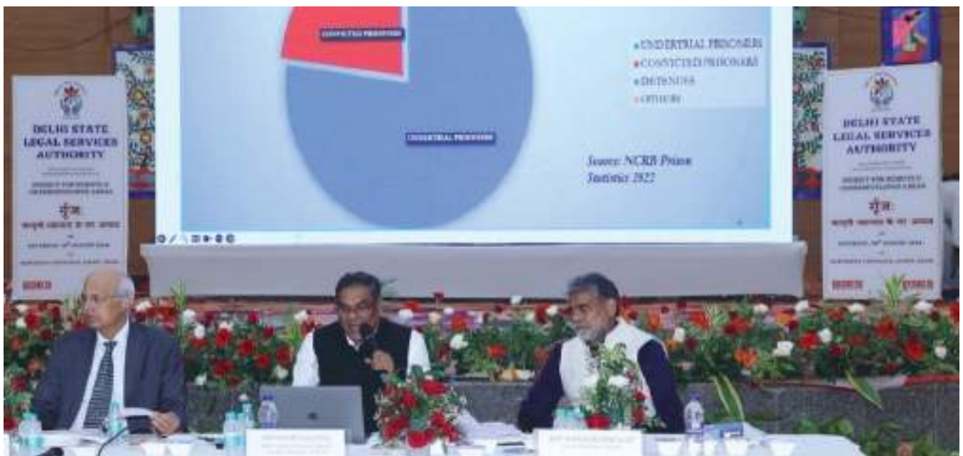
10 August 2024, Justice Sanjiv Khanna visits Jail No. 4, Central Jail, Tihar Complex organised by Delhi State Legal Services Authority