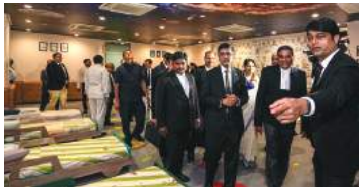
29 August 2024, Chief Justice of India, Dr D Y Chandrachud, Justice Sanjiv Khanna, Justice B R Gavai, Justice Hrishikesh Roy, Justice Ahsanuddin Amanullah and Justice Kotiswar Singh, Judges, Supreme Court of India, inaugurate the new branch of 'Bank of Maharashtra' at Sixth Floor, E Block, Supreme Court of India and 'Creche (Child Care Centre)' at Second Floor, E Block, Administrative Buildings Complex, Supreme Court of India.