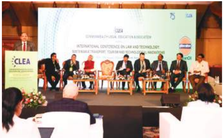
17 August 2024, Justice Surya Kant, Chief Patron, CLEA, addresses the gathering on International Conference by Commonwealth Legal Education Association, on the theme "Law and Technology: Sustainable Transport, Tourism and Technological Innovations," at Kumarakom, Kerala