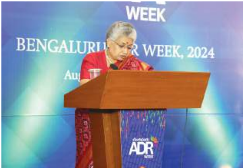
24 August 2024, Justice B V Nagarathna delivers inaugural address on the theme, 'Expanding the Horizon: Marching Towards World Class Arbitral Institution' in Bengaluru ADR Week 2024 organised by the Arbitration and Conciliation Centre, Bengaluru (Domestic and International), Karnataka Judicial Academy, and the Advocates' Association Bengaluru in association with the Bengaluru ADR Week Committee, at Karnataka Judicial Academy, Bengaluru