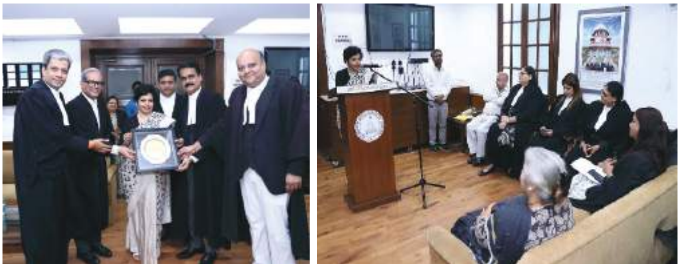
27 August 2024, Justice Hima Kohli receives a farewell from the executive members of the SCAORA on the occasion of her retirement