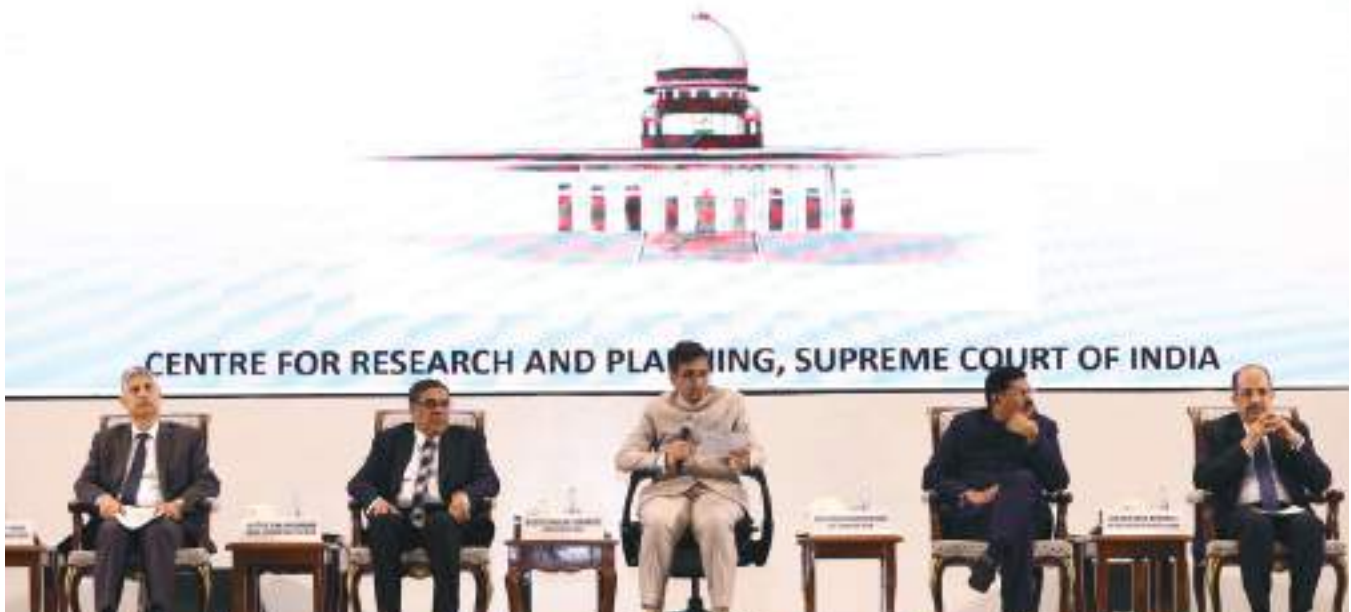
31 August 2024, Chief Justice of India, Dr D Y Chandrachud, Supreme Court Judges, Justice Sanjiv Khanna and Justice B R Gavai along with Chief Justice, Andhra Pradesh High Court, Justice D S Thakur and Chief Justice, High Court of Allahabad, Justice Arun Bhansali during the Session on “Judicial Infrastructure and Human Resources, during National Conference of the District Judiciary