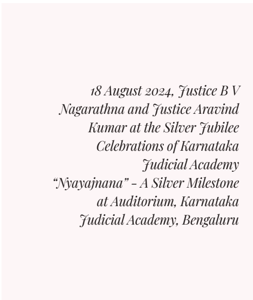
18 August 2024, Justice B V. Nagarathna and Justice Aravind Kumar at the Silver Jubilee Celebrations of Karnataka Judicial Academy “Nyayajana” - A Silver Milestone at Auditorium, Karnataka Judicial Academy, Bengaluru