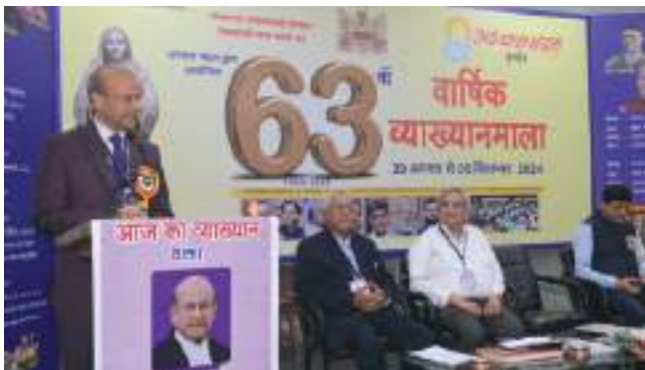
31 August 2024, Justice Rajesh Bindal, Judge, Supreme Court of India, delivers a lecture during the 63rd Annual Lecture series by the Abhyas Mandal, at Indore, Madhya Pradesh