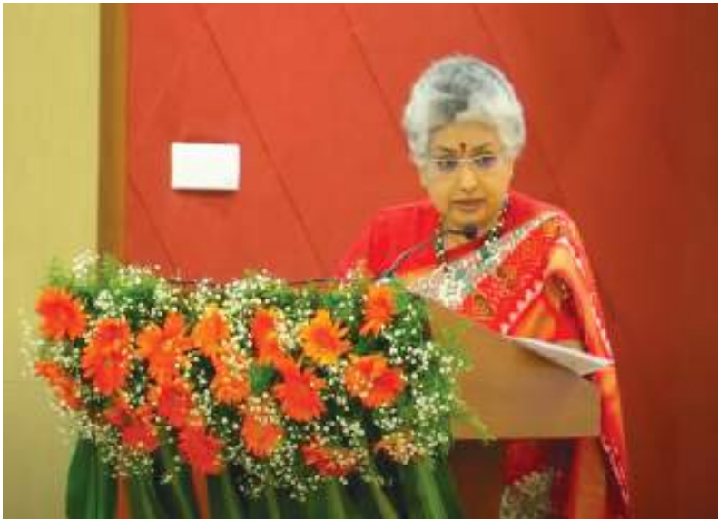
18 August 2024, Justice B V. Nagarathna inaugurates Silver Jubilee Celebrations of Karnataka Judicial Academy “Nyayajana” - A Silver Milestone organised by the High Court of Karnataka and Karnataka Judicial Academy, Bengaluru