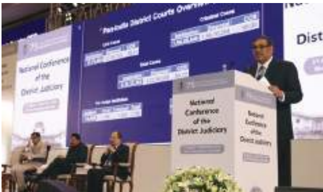
31 August 2024, Justice Sanjiv Khanna, Judge, Supreme Court of India, discusses the case pendency pan India during his presentation in Session I