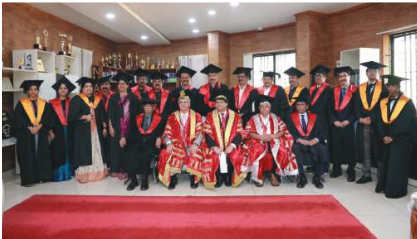
On 6 January 2024, Justice Sudhanshu Dhulia presided as the Chief Guest and delivered a convocation address at the 17th convocation ceremony of the National University of Advanced Legal Studies (NUALS) at Kochi