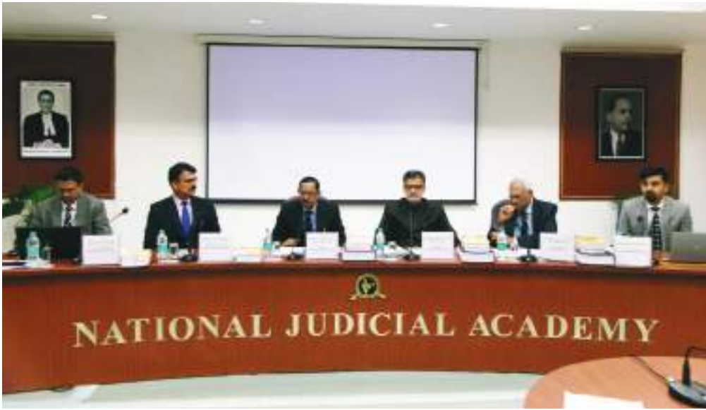
On 20 January 2024 Justice Ujjal Bhuyan presided over Session 1 – Fair Trial and Session 2 – The Triple Method of Plea Bargain, Compounding and Probation at the National Conference on ‘Sentencing, Probation and Victim Compensation,’ held by the National Judicial Academy, Bhopal