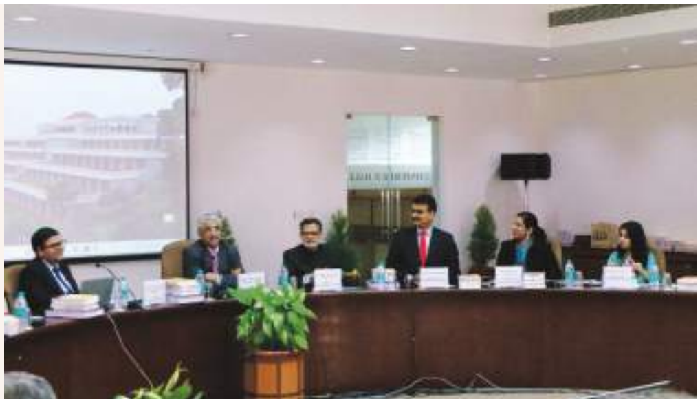
Justice Aravind Kumar presided over Session 4 – Court and Case Management and Session 5 – Interim Orders and Judicial Discretion during an orientation course for newly elevated high court judges on 21 January 2024 at National Judicial Academy, Bhopal