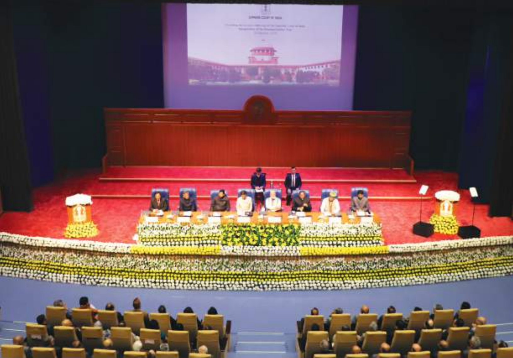
The Chief Justice of India, Dr D Y Chandrachud with the Hon'ble Prime Minister of India, Shri Narendra Modi in the presence of the Judges of the Supreme Court, Minister of State for Law and Justice (I/C), President of the Supreme Court Bar Association and Chairman of the Bar Council of India, at the commemoration of Diamond Jubilee Year

ensuring that the length of oral arguments does not interminably delay judicial outcomes and lead to the capture of judicial institutions by the powerful and the mighty; third, the provision of a level playing field for first generation lawyers and men and women from marginalised segments of society who have the will to work hard and the potential to succeed; and fourth, to beginning the conversation on long vacations and to decide, in consultation with the Bar, whether alternatives such as flexi-time for lawyers and judges is possible.