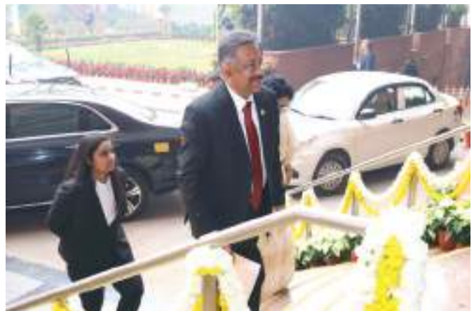
Justice Jayantha C Jayasuriya (Chief Justice of Sri Lanka) heading towards the auditorium on the occasion of Diamond Jubilee Celebrations