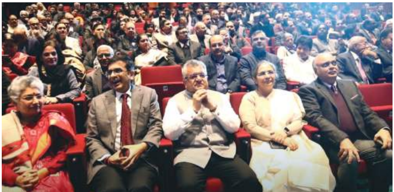
From left to right: Justice B V Nagarathna, the Chief Justice of India, Dr D Y Chandrachud, Solicitor General, Tushar Mehta, Justice Bela Trivedi and Justice Ahsanuddin Amanullah at the book launch 'Roses without Thorns' on 12 January 2024