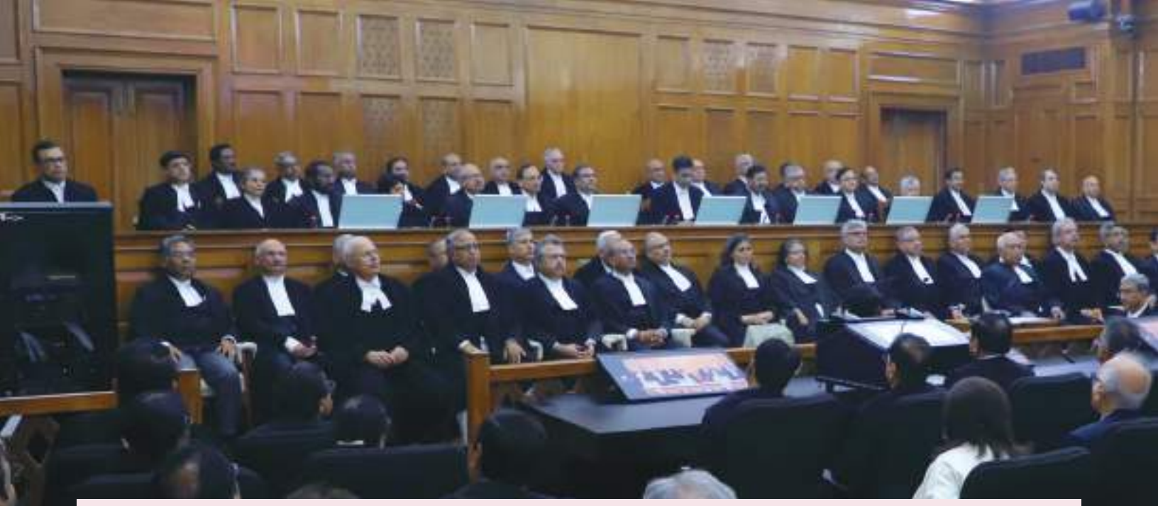
On 28 January 2024, the Chief Justice of India, Dr D Y Chandrachud chaired a Ceremonial Bench with Supreme Court Judges and the Chief Justices of 25 High Courts across the country to commemorate the first sitting of the Supreme Court