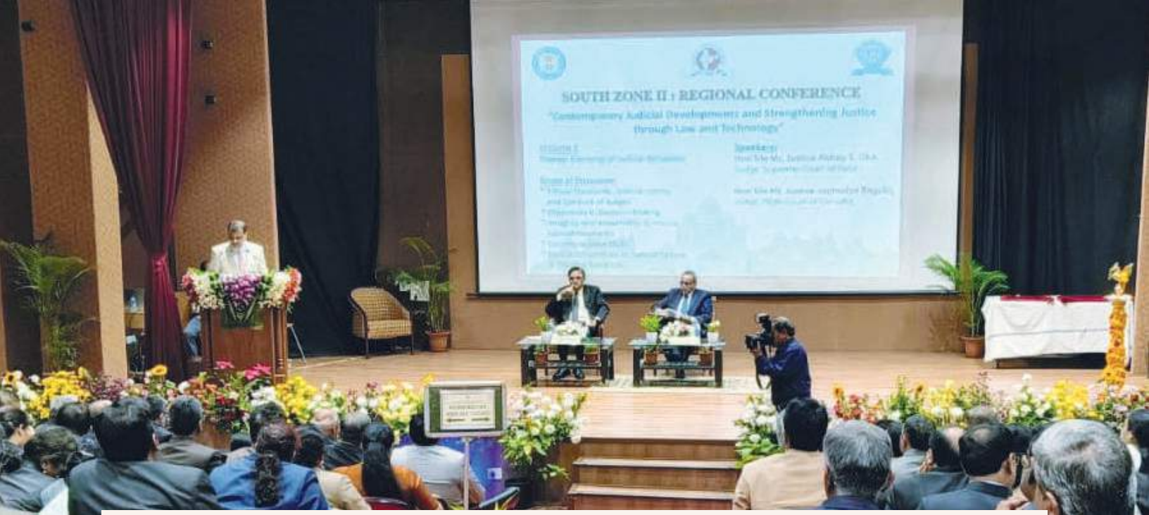
Justice Abhay S Oka presiding over Session-2 on the theme ‘Elements of Judicial Behaviour’ conducted at South Zone-II: Regional Conference on Contemporary Judicial Developments and Strengthening Justice through Law and Technology at Dr M C R, H R D Institute, Jubilee Hills, Hyderabad

The South Zone-II: Regional Conference on “Contemporary Judicial Developments and Strengthening Justice through Law and Technology” was organised by National Judicial Academy (NJA) in collaboration with the High Court for the State of Telangana and the Telangana State Judicial Academy at Dr MCR HRD Institute, Jubilee Hills, Hyderabad. On 6 January 2024, Justice Abhay S Oka presided over Session-2 on the theme ‘Elements of Judicial Behaviour’ and the Session-3 titled ‘Judgment Writing Tools’ was presided over by Justice Ujjal Bhuyan. On 7 January 2024, Justice Rajesh Bindal presided over Session-4 on the theme “Overview of e-Courts Projects” as a resource person.