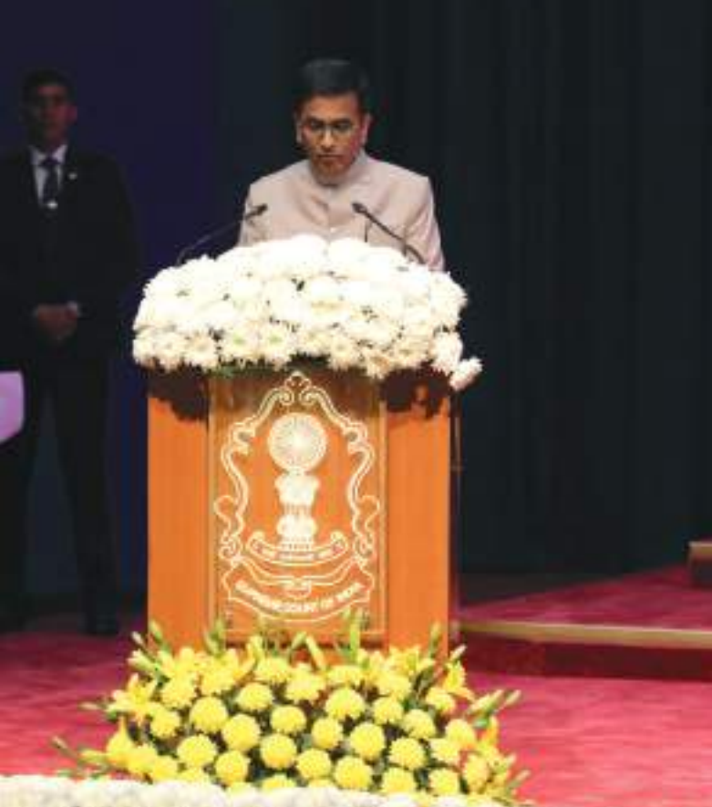
The Chief Justice of India, Dr D Y Chandrachud addressing the audience on the occasion of the Diamond Jubilee Celebrations of the Supreme Court of India

During the celebrations, the Chief Justice of India, Dr D Y Chandrachud delivered a profound address expressing gratitude to the dignitaries and recognising the historical significance of the occasion: