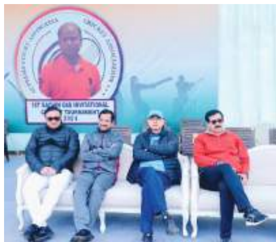
Justice M M Sundresh at the 1st Sachin Das Invitational Cricket Tournament inauguration conducted by the Supreme Court Advocates Cricket Association at Modern School, New Delhi on 13 January 2024