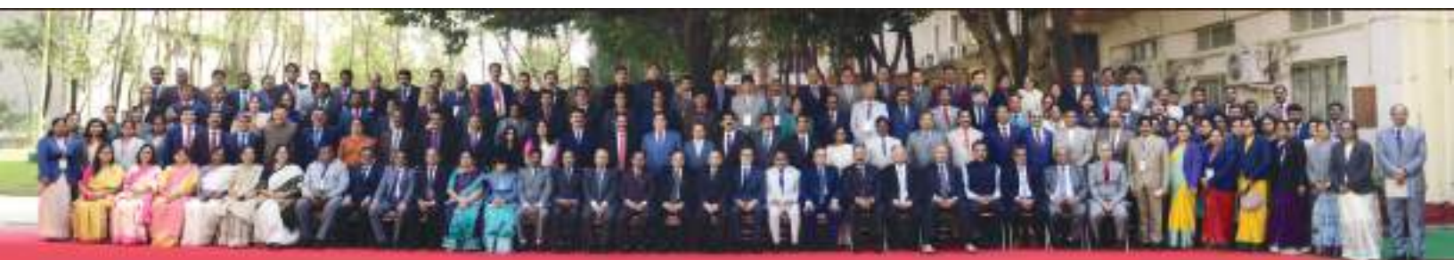
On 6 January 2024, Justice Ujjal Bhuyan and Justice Abhay S Oka presided over the sessions conducted at South Zone-II: Regional Conference on Contemporary Judicial Developments and Strengthening Justice through Law and Technology at Dr M C R, H R D Institute, Jubilee Hills, Hyderabad