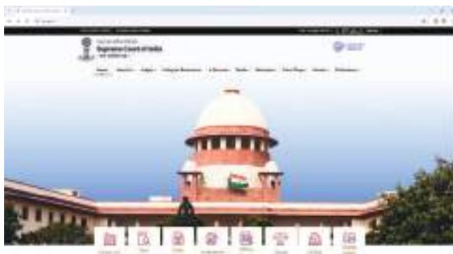
New Supreme Court Website

The new website of the Supreme Court was launched for an enhanced user experience, characterised by a dynamic and functional design, a user friendly interface, and robust content management. It provides users with convenient access to comprehensive information about the organisation, pivotal technology based services, crucial documents, and important updates. The website has been meticulously crafted within the ‘Secure, Scalable and Sugamya Website as a Service’ (S3WAAS) framework of National Information Centre (NIC), prioritising accessibility for differently-abled users.