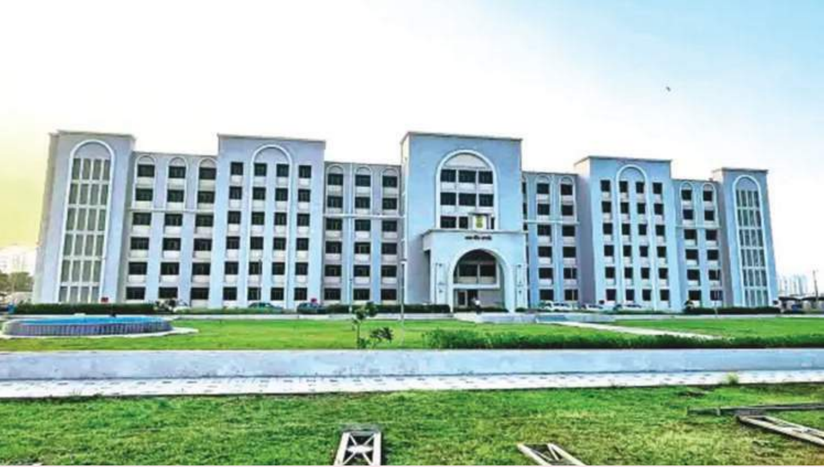
New District Court Complex (Nyaya Mandir) at Rajkot, Gujarat

This exemplary establishment, equipped with amenities such as crèches and accessible toilets, alongside cutting-edge technology integration, marks a pivotal milestone in ensuring equitable access to justice. The launch of e-filing 3.0 for Gujarat's district judiciary, coupled with the introduction of a video conferencing witness deposition centre and an AI-based text-to-speech callout system by the Gujarat High Court, represents a groundbreaking advancement in legal proceedings.