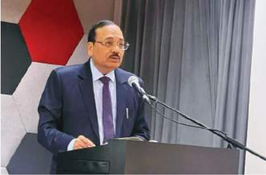
On 15 January 2024, Justice Surya Kant presided as the keynote speaker at the launch of the Malaysian International Mediation Centre at Kuala Lumpur