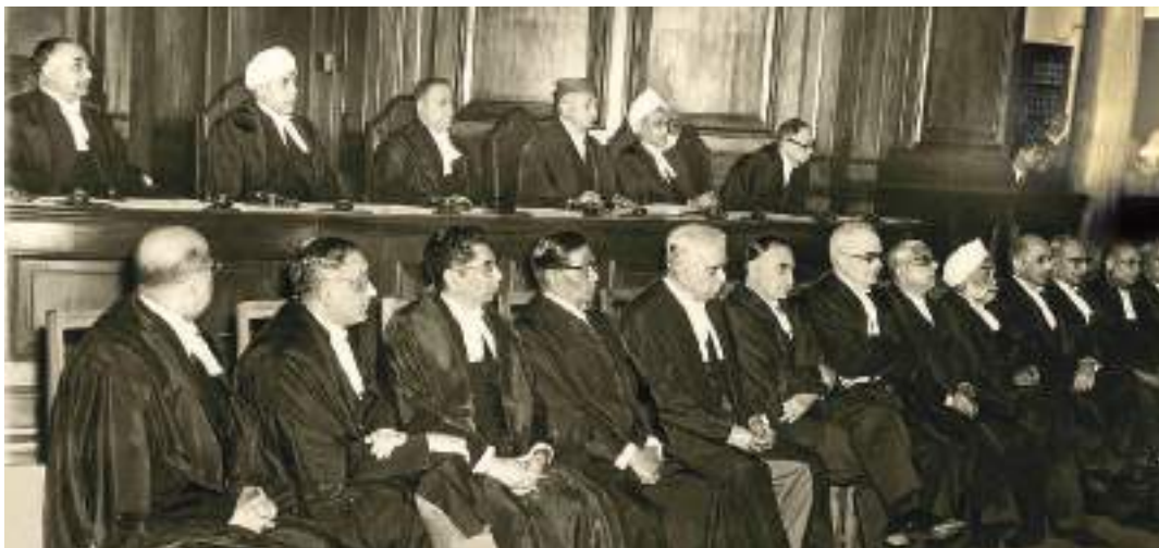
First sitting of the six Judges of the Supreme Court along with 13 Chief Justices from various High Courts on 28 January 1950

Today, the Supreme Court operates with a more streamlined approach, typically convening with a Bench of two Judges, unless the complexity of the case warrants a larger panel. Recent years have seen a concerted effort to tackle the backlog of cases, with a proactive measure towards reducing pendency. In 2023 alone, a remarkable 52,221 cases were disposed of and much credit is owed to technology, which has been instrumental in expediting processes, particularly through e-filing systems that minimise delays.