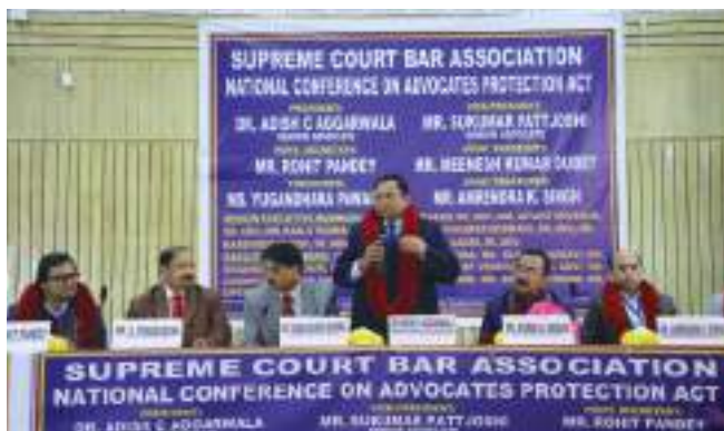
On 27 January 2024, Supreme Court Bar Association organised a National Conference on Advocates Protection Act, at VK Krishna Menon Bhawan, Indian Society of International Law, New Delhi