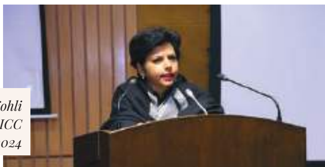
Chairperson, GSICC, Justice Hima Kohli addressing the participants at GSICC training on 19 January 2024