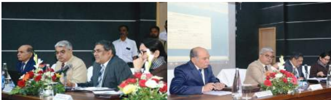
Executive Chairman, NALSA, Justice Sanjiv Khanna chaired the first-ever State Level Conference of District Legal Services Authorities of Madhya Pradesh on 13 January 2024 at Bhopal, Madhya Pradesh

NALSA organised two important programmes in January 2024 namely the State Level Conference of District Legal Services Authorities of Madhya Pradesh on 13 January 2024 at Bhopal and the Launch of Pan-India Campaign, "Restoring the Youth: Pan-India Campaign for Identifying Juveniles in Prisons and Rendering Legal Assistance – 2024" on 25 January 2024.