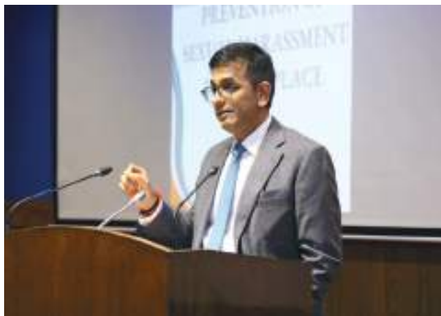
The Chief Justice of India, Dr D Y Chandrachud addressing the participants at GSICC training on 19 January 2024