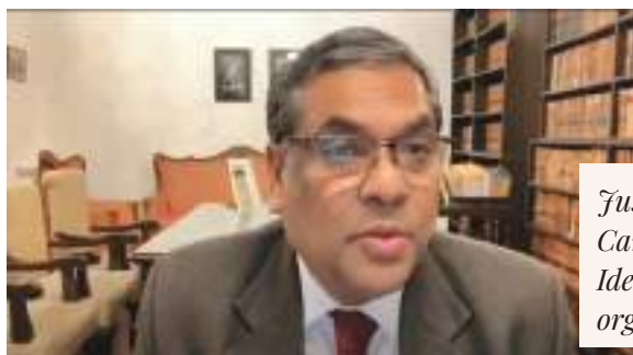
Justice Sanjiv Khanna during the virtual launch of Pan-India Campaign – "Restoring the Youth: Pan-India Campaign for Identifying Juveniles in Prisons and Rendering Legal Assistance" organised by NALSA on 25 January 2024

Justice Sanjiv Khanna while launching the campaign, emphasised, "Criminals are made by circumstances. No one is born a criminal. The path towards criminality is often a result and consequence of experiences and circumstances mostly shaped by neglect, external influences or lack of guidance." 'Restoring the Youth' is a call to action, aligning with the principles of juvenile justice, marking a significant step towards ensuring implementation of the juvenile justice laws in letter and spirit.