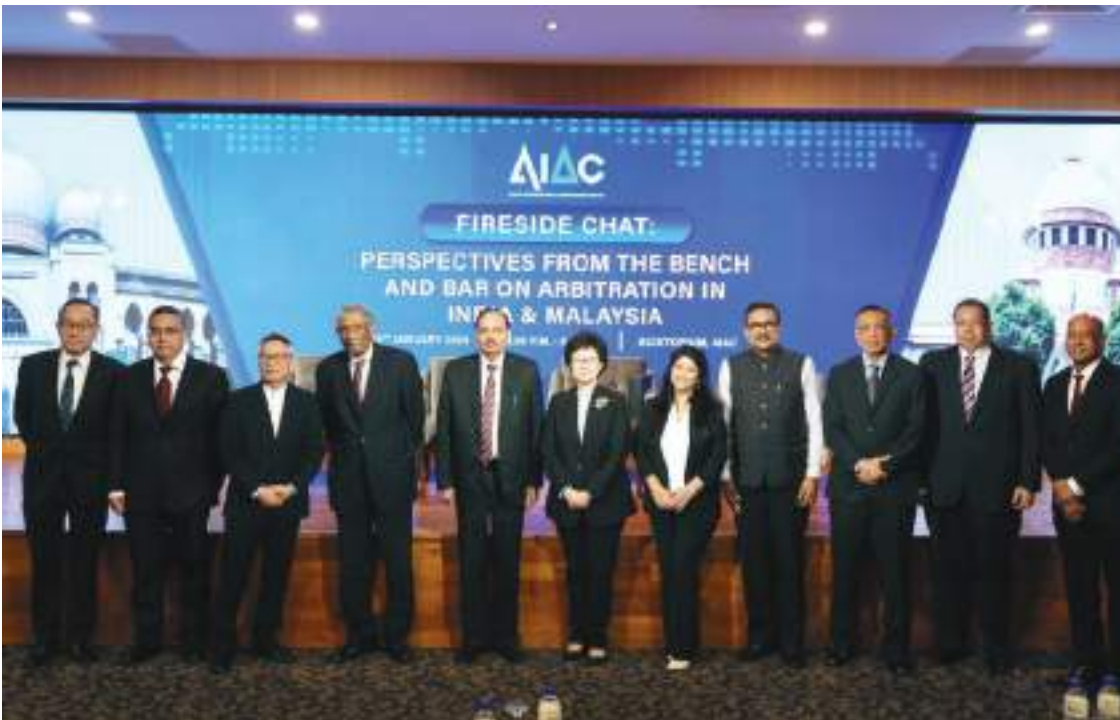
Justice Surya Kant presided as the Chief Guest at the Asian International Arbitration Centre's (AIAC) seminar on 'Perspectives from the Bench and Bar on Arbitration in India and Malaysia' on 16 January 2024