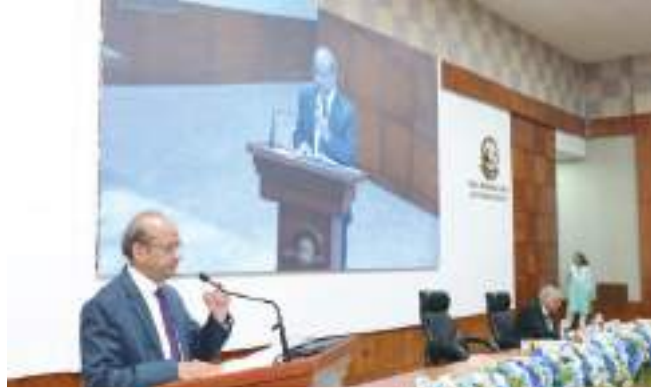
Justice Rajesh Bindal presided over Session-5 on the theme “Emerging and Future Technology for Effective Judicial Governance” of the West Zone-I Regional Conference on “Contemporary Judicial Developments and Strengthening Justice through Law and Technology” at Uttan, Maharashtra on 14 January 2024