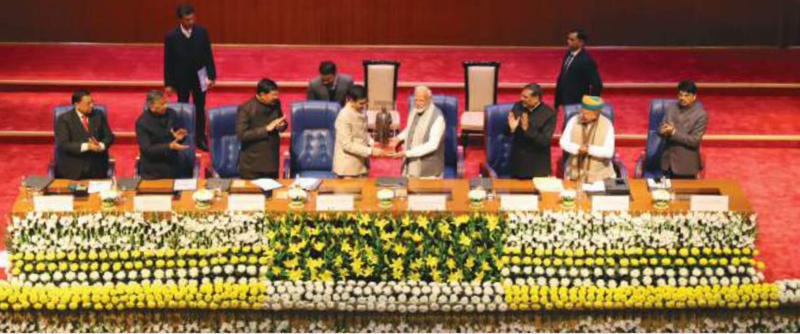
The Chief Justice of India, Dr D Y Chandrachud presenting a memento to the Prime Minister of India, Shri Narendra Modi in the presence of the Judges of the Supreme Court, Minister of State for Law and Justice (I/C), President of the Supreme Court Bar Association and Chairman of the Bar Council of India, at the commemoration of Diamond Jubilee Year