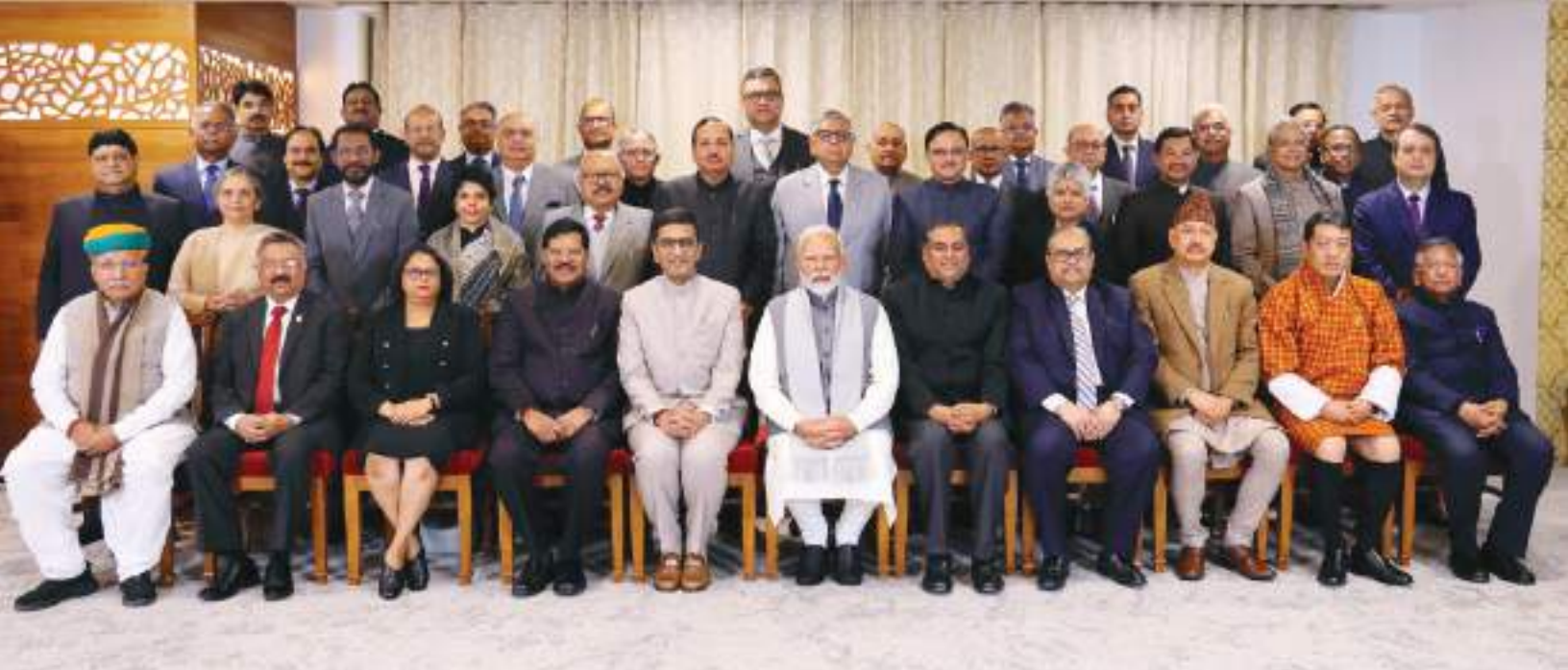
The Prime Minister of India, the Chief Justice of India, Judges of the Supreme Court, the Minister of State for Law and Justice (I/C), Attorney General of India, Solicitor General of India, President, Supreme Court Bar Association, Chairman, Bar Council of India at the commemoration of Diamond Jubilee Year