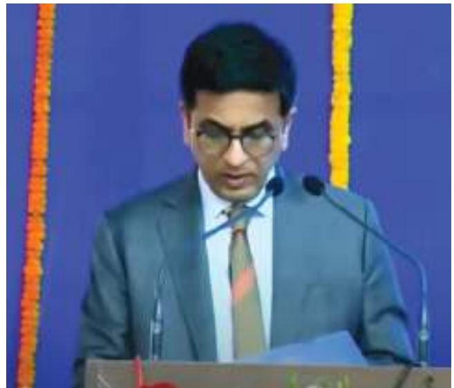
The Chief Justice of India, Dr D Y Chandrachud inaugurating the District Court Complex (Nyaya Mandir) at Rajkot, Gujarat

Such initiatives not only underscore the judiciary's proactive approach to embracing innovation but also reflect the Chief Justice of India, Dr D Y Chandrachud's commitment to enhancing accessibility and efficiency in the delivery of justice.