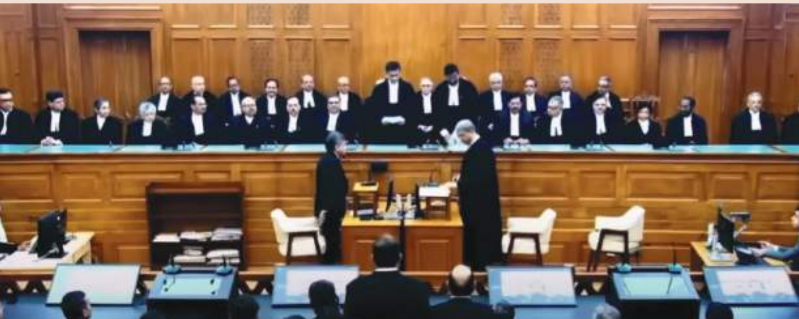
Justice Prasanna B Varale, taking oath as Judge of the Supreme Court on 25 January 2024

Justice Prasanna B Varale was appointed as an Additional Judge of the Bombay High Court on 18 July 2008, and made permanent on 15 July 2011. He was elevated as the Chief Justice of Karnataka High Court on 15 October 2022. On 25 January, Justice Prasanna was elevated as the 34th Judge of the Supreme Court.