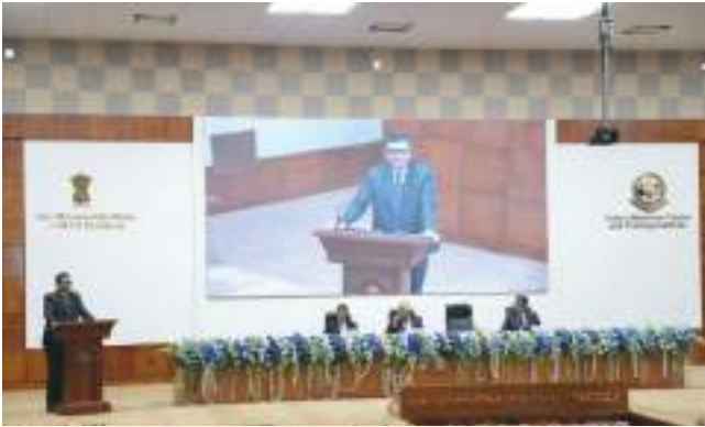
Justice Dipankar Datta addressing the audience at the inaugural session of the West Zone-I Regional Conference on “Contemporary Judicial Developments and Strengthening Justice through Law and Technology” at Uttan, Maharashtra on 13 January 2024