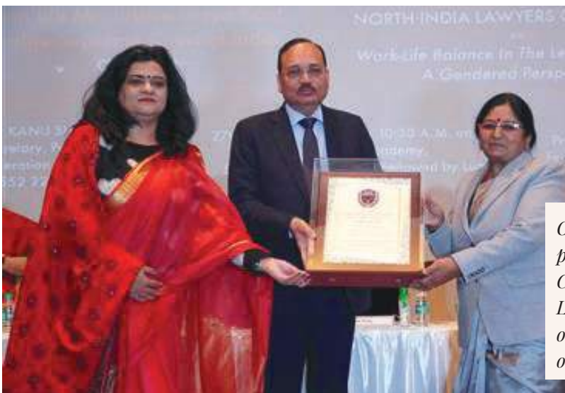
On 27 January 2024, Justice Surya Kant presided as the Chief Guest at the North-India Conference on “Work Life Balance in the Legal Profession – A Gendered Perspective” organised by Punjab and Haryana Federation of Women Lawyers, Chandigarh