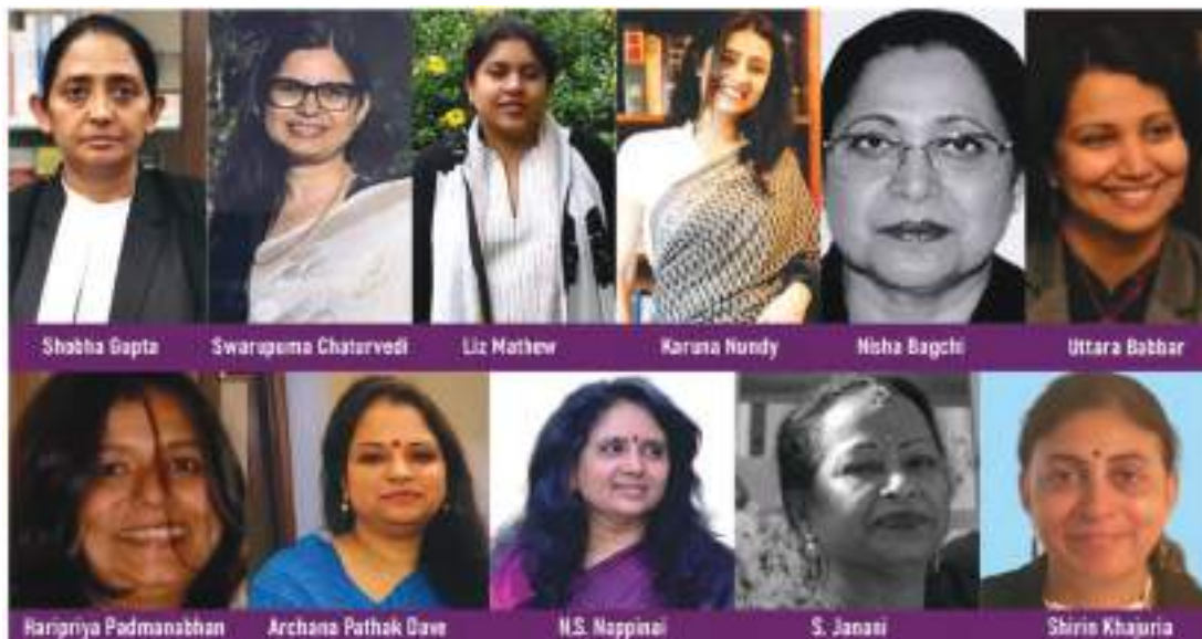
The Supreme Court on 19 January 2024 designated 56 advocates as senior advocates, eleven out of whom are women

On 11 January 2024, the Chief Justice of India, Dr D Y Chandrachud inaugurated the function of 'Arbitration and Consultation Room' at Ground Floor, M C Setalvad, Lawyers' Chamber Block. As part of this initiative, the Supreme Court will provide all the facilities related to arbitration and mediation proceedings in these rooms including meeting facility, video conferencing facility, etc.