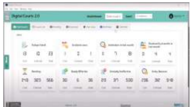
Digital Courts 2.0

‘Digital Courts 2.0’ was launched through a collaborative effort between the e-Committee and the Department of Justice under the e-Courts project. Leveraging the power of artificial intelligence, particularly in transcribing speech to text, the platform empowers judges to efficiently dictate orders, judgments, and record testimonies in real-time. Incorporating National Informatics Centre’s artificial intelligence-powered tool AI-Shruti, the platform further facilitates automatic speech recognition for multiple languages, thereby streamlining the transcription process.