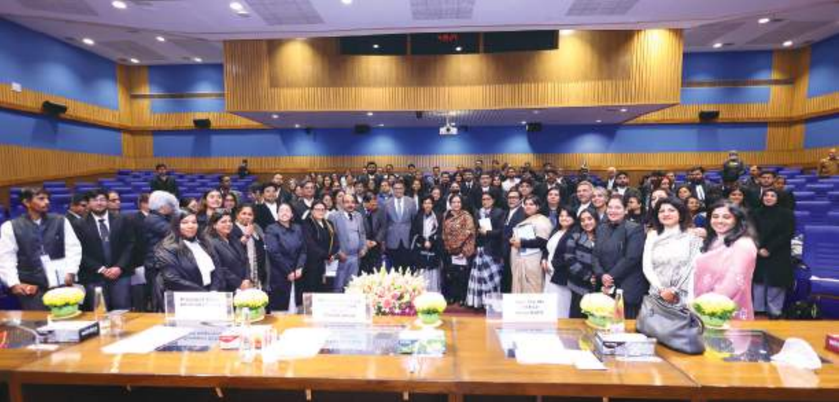
Group Photo taken during the 'Gender Sensitisation and Prevention of Sexual Harassment at Workplace' training held on 19 January 2024