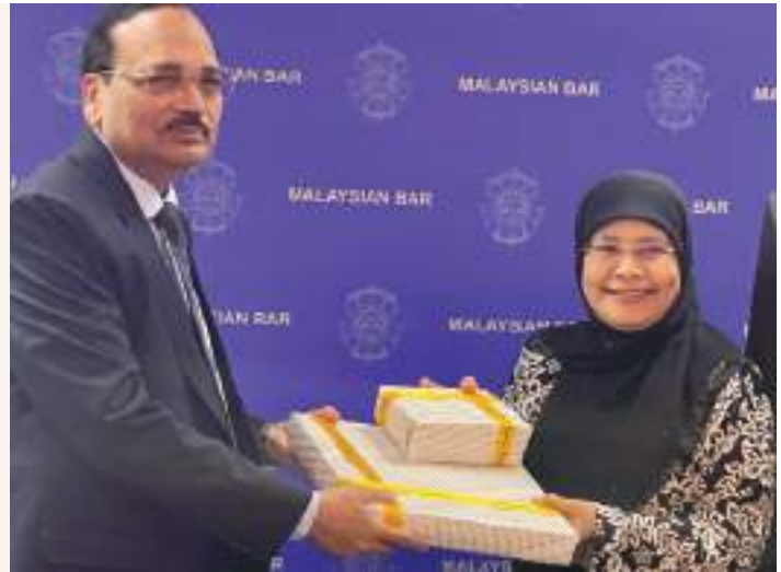
Justice Surya Kant with Justice Tun Tengku Maimun binti Tuan Mat (Chief Justice, Federal Court Malaysia) at the launch of Malaysian International Mediation Centre on 15 January 2024, Kuala Lumpur