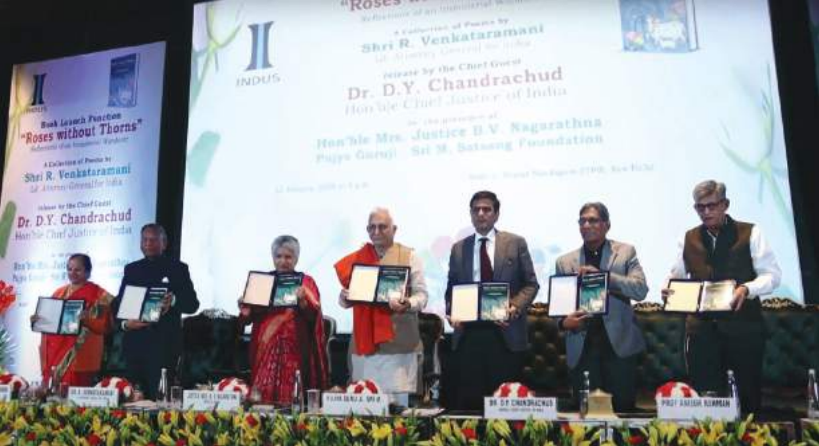
On 12 January 2024, the Chief Justice of India, Dr D Y Chandrachud released the book 'Roses without Thorns' penned by Attorney General for India, R Venkataramani in presence of Justice B V Nagarathna at Audi-1, Bharat Mandapam (TIPO), New Delhi