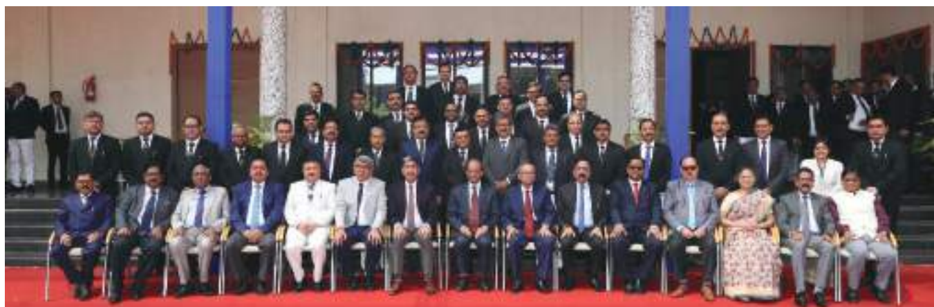
20 April 2024, Justice Rajesh Bindal, Chief Guest, attends the State Level Conference on Case Management: Inculcating Public Trust and Confidence organised by the Judicial Academy, Ranchi, Jharkhand