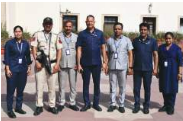
Security personnel deployed outside courtroom corridors ensuring security within the premises