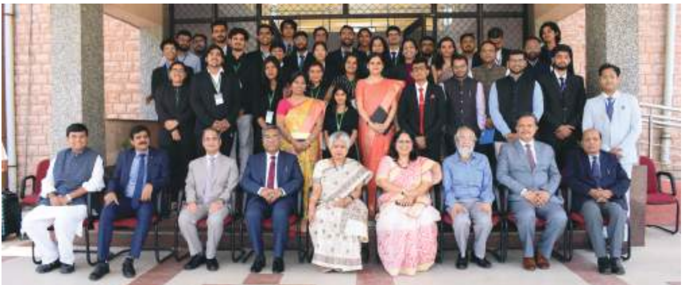
21 April 2024, Justice B V Nagarathna delivers a lecture on the theme "Celebrating 75th Years of Indian Supreme Court" at the National Conference organised by the National Law University, Jodhpur