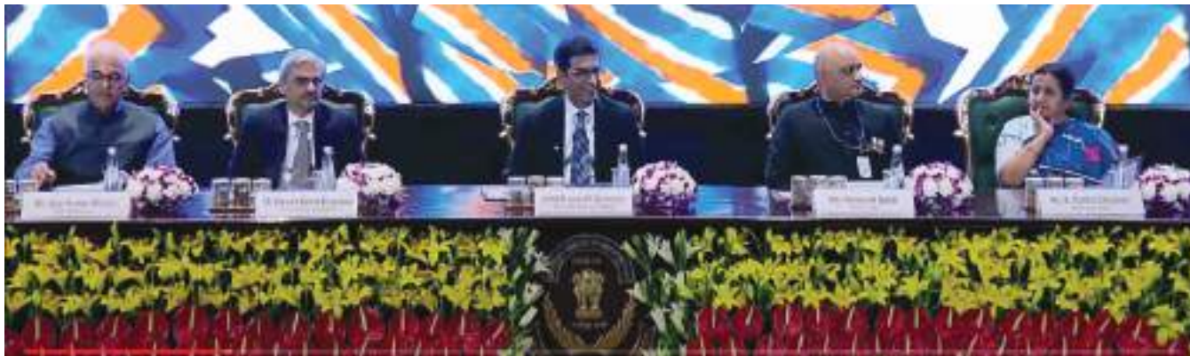
1 April 2024, the Chief Justice of India, Dr D Y Chandrachud at the 20th D P Kohli Memorial Lecture on the occasion of CBI Day at Auditorium Hall-1, Bharat Mandapam, ITPO, New Delhi. The conference was also attended by Justice Ahsanuddin Amanullah