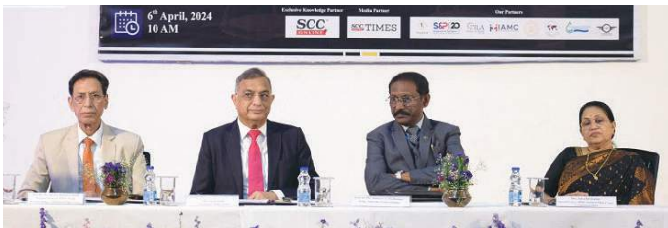
6 April 2024, Justice C.T. Ravikumar attends the final round and the valedictory ceremony as the Chief Guest at the National Moot Court Competition, 2024, School of Law, Delhi Metropolitan Education, Noida