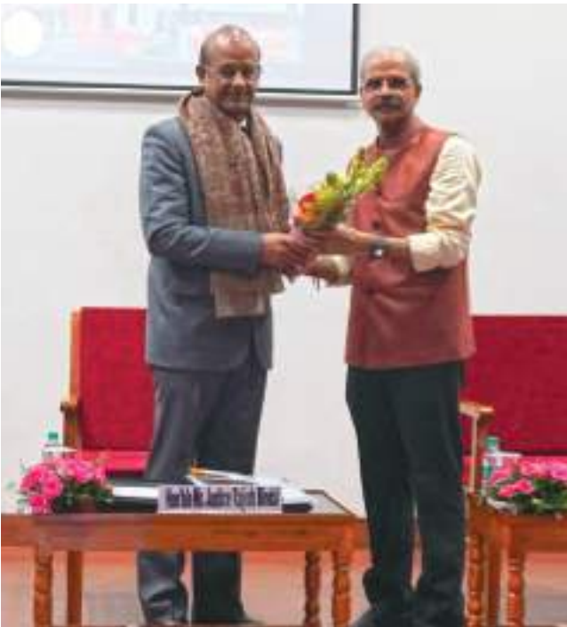
6 April 2024, Justice Rajesh Bindal inaugurates the 2nd National Conference on the theme “Legal Education, Profession and Integrating Pro Bono Culture for Better Access to Justice” at Rajiv Gandhi School of Intellectual Property Law, IIT Kharagpur, West Bengal