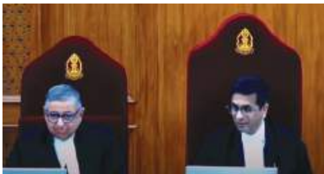
10 April 2024, the Chief Justice of India, Dr D Y Chandrachud and Justice Aniruddha Bose during the ceremonial bench proceedings in Courtroom no 1

the honoured Judge and other Supreme Court Justices. It concludes with the retiring Judge distributing sweets to the guards and the Guard Commander. Most recently, on 10 April 2024, Justice Aniruddha Bose received the Ceremonial Guard of Honour.