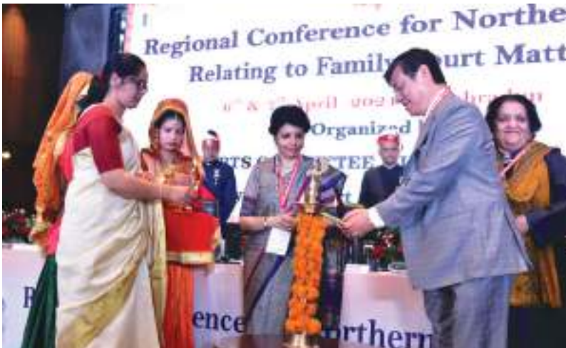
6 April 2024, Justice Hima Kohli, Chairperson of the Family Courts Committee, Supreme Court of India at the Northern Zone Regional Conference, Dehradun