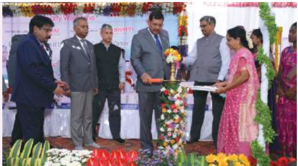
27 April 2024, Justice B R Gavai and Justice S V N Bhatti attend the inauguration of 15 Courts Building Complex, organised by the Principal District Judge and President and Members of Bar Association, Chittoor