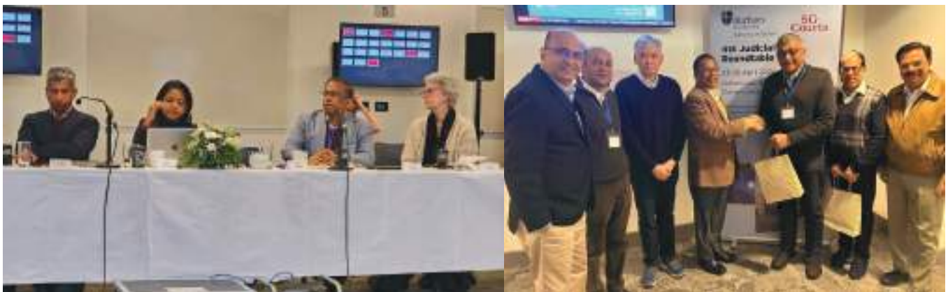
23-26 April 2024, the Chief Justice of India, Dr D Y Chandrachud (virtually), Justice K V Viswanathan and Justice Sundaresh Menon (Chief Justice of Singapore) at the 4th Judicial Roundtable on Commercial Law organised by the Supreme Court of Singapore, held at Durham Law School, London