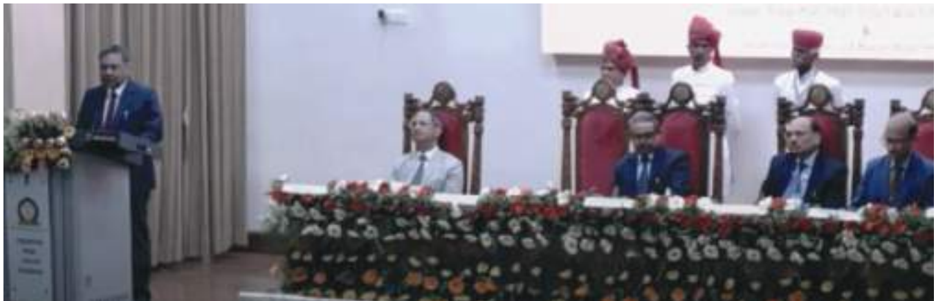
6 April 2024, Justice Surya Kant, Justice Augustine George Masih and Justice Sandeep Mehta at the valedictory session of One Year Induction & Training Programme of Judicial Officers at Rajasthan State Judicial Academy, Jodhpur