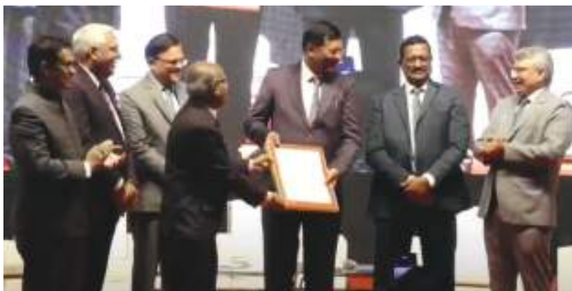
6 April 2024, Justice B R Gavai, Justice Abhay S Oka, and Justice P B Varale attend the felicitation program of the designated Senior Advocates and Advocates (HCBA Members) with 50 years of practice held at Vasant Rao Deshpande Hall, Civil Lines, Nagpur