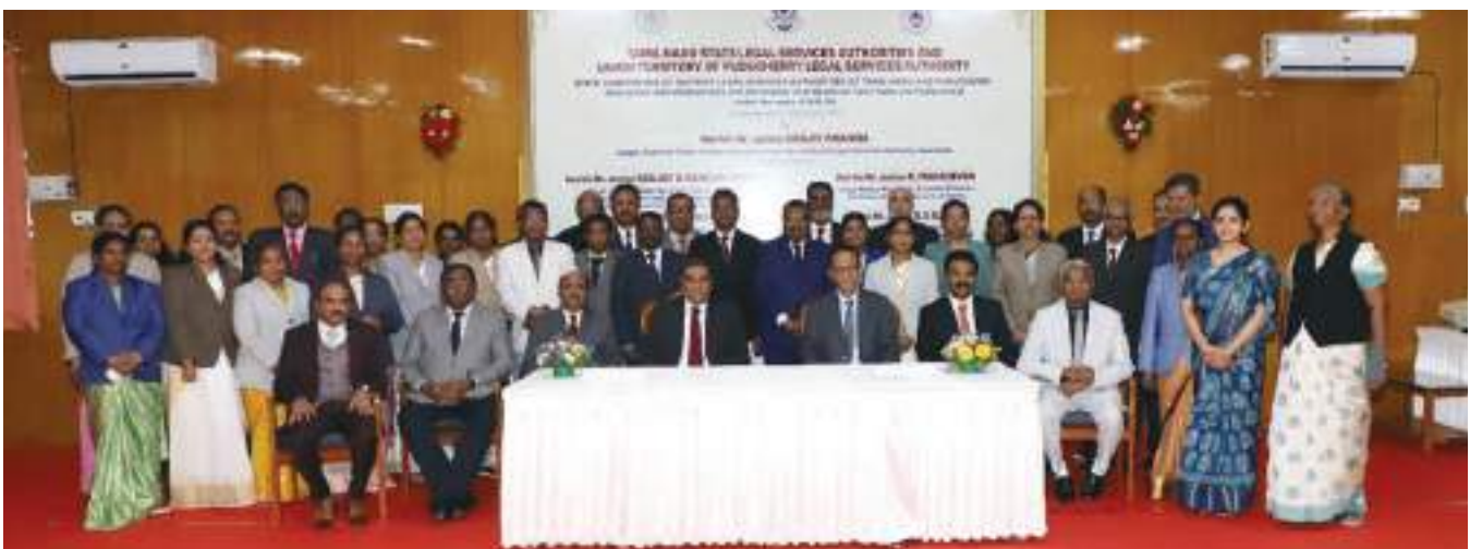
27 April 2024, Justice Sanjiv Khanna delivers an address during the Conference of DLSAs of Tamil Nadu and Puducherry at ADR Building, Madras High Court