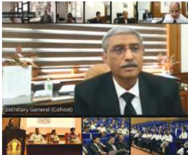
23-25 April 2024, Secretary General, Atul M Kurhekar delivers an inaugural address at the e-HRMS 2.0 Training for 951 officials of Registry including 714 physical and 237 online participants at the Multipurpose Hall, Supreme Court of India