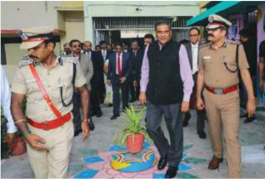
28 April 2024, Justice Sanjiv Khanna at the Madurai Central Prison, interacts with the prison inmates, jail officials, doctors and counsellors posted at the Prison Hospital, Tamil Nadu