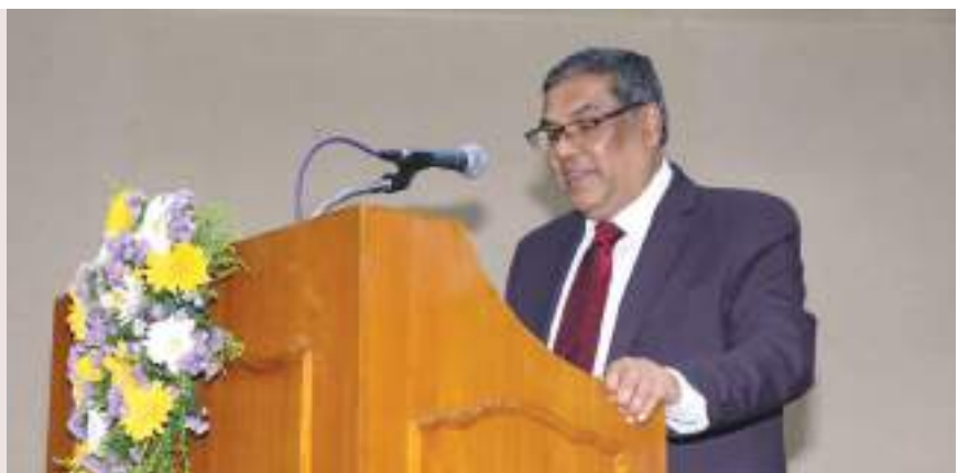
27 April 2024, Justice Sanjiv Khanna delivers an inaugural address during the Special Training on Mediation Act, 2023, at the Auditorium of the Madras High Court