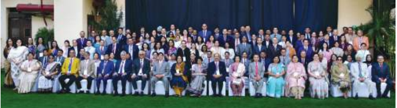
6 April 2024, the Northern Zone Regional Conference of the Family Courts Committee at Dehradun