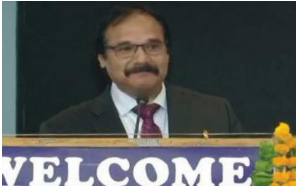
27 April 2024, Justice Prashant Kumar Mishra, at the 75th year anniversary of the establishment of Rajasthan High Court at Jaipur organised by Rajasthan High Court Bar Association