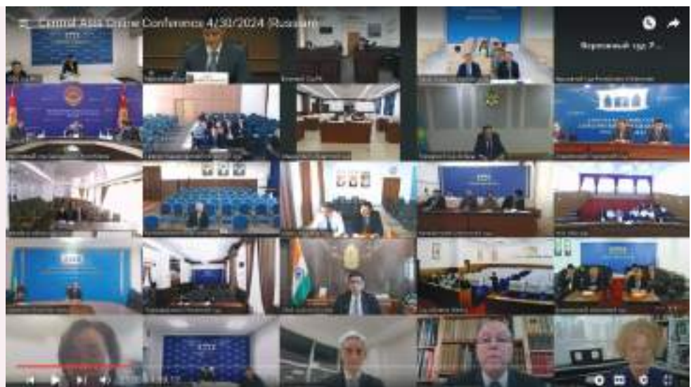
30 April 2024, the Chief Justice of India, Dr D Y Chandrachud delivers an address at the Central Asia Online Conference on 'Information and Technology in Courts' organised by the Republic of Kazakhstan