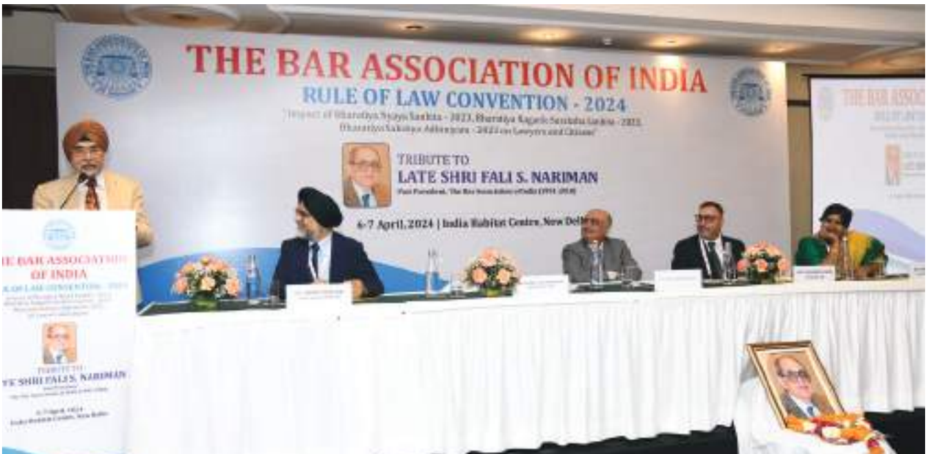
6 April 2024, Justice Ahsanuddin Amanullah, Chief Guest, delivers an address during the Rule of Law Convention, 2024 organised by the Bar Association of India at India Habitat Centre, New Delhi