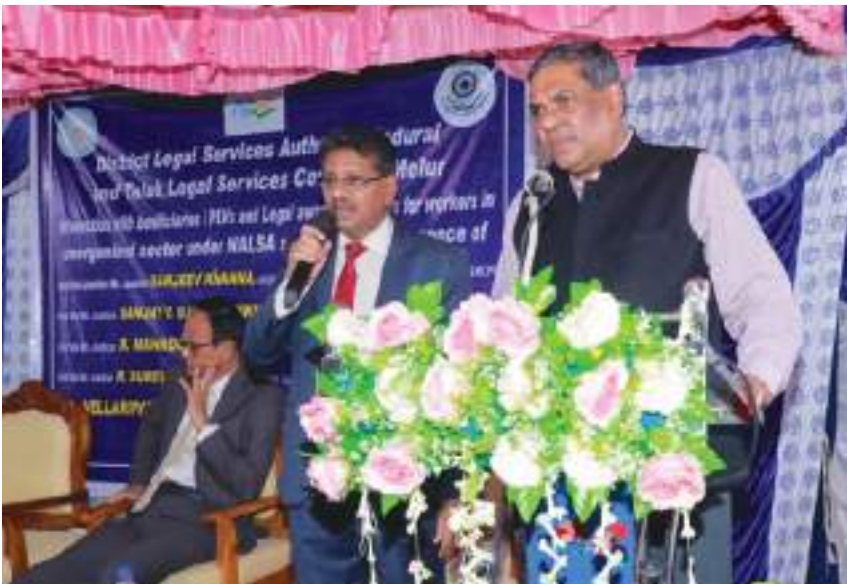
28 April 2024, Justice Sanjiv Khanna, Executive Chairman, NALSA, interacts with the villagers during the Legal Aid Camp organised at Vellaripatti village, Madurai, Tamil Nadu