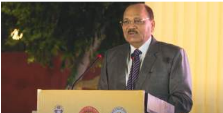
13 April 2024, Justice Surya Kant shares the contributions of Justice V R Krishna Iyer at the Justice V R Krishna Iyer Memorial Lecture, New Delhi