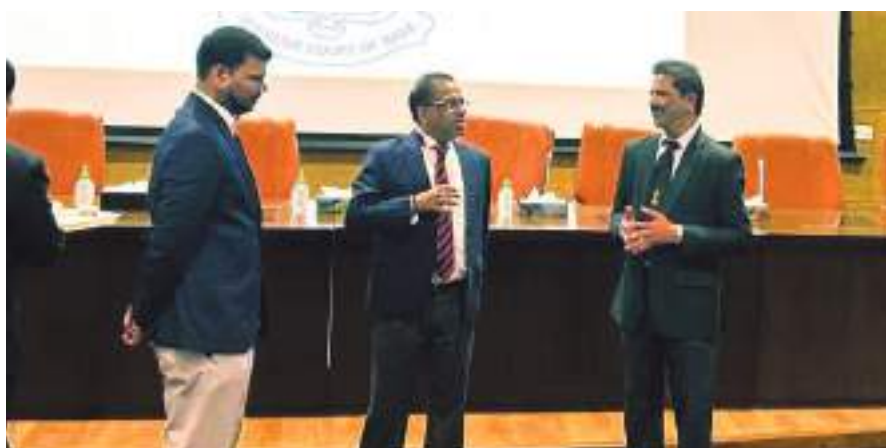
10 April 2024, Justice K V Viswanathan attends the quiz competition held at the multipurpose hall, B block, Additional Building Complex, Supreme Court of India