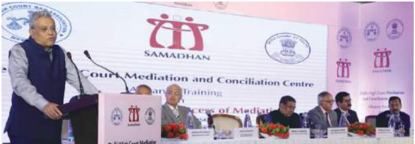
5-6 April 2024, Justice P.S. Narasimha delivers a special address at the inaugural session of Samadhan in the presence of Justice Sanjiv Khanna and Justice Sanjay Karol at Delhi High Court Mediation and Conciliation Centre, advance training on “The Concept and Process of Mediation” at Agra, UP