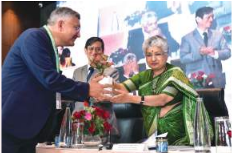
7 April 2024, Justice B V Nagarathna, Member of the Family Courts Committee, Supreme Court of India delivers a special address in the valedictory session at the Northern Zone Regional Conference, Dehradun