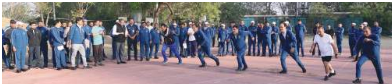
4 April 2024, Justice Sanjiv Khanna attends the mini-marathon held at Jawaharlal Nehru Stadium, New Delhi