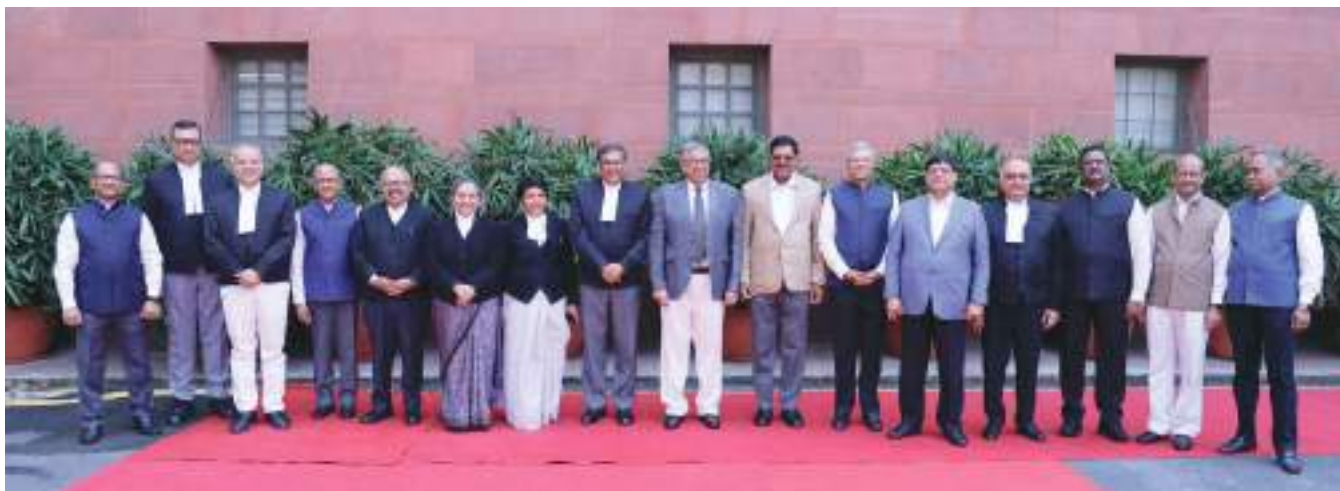
Left to Right: Justice Sandeep Mehta, Justice Dipankar Datta, Justice Satish Chandra Sharma, Justice Sanjay Kumar, Justice Hrishikesh Roy, Justice Bela M Trivedi, Justice Hima Kohli, Justice Sanjiv Khanna, Justice Aniruddha Bose, Justice B R Gavai, Justice P S Narasimha, Justice Sudhanshu Dhulia, Justice Ahsanuddin Amanullah, Justice P B Varale, Justice Rajesh Bindal, Justice S V N Bhatti, during the ceremonial Guards of Honour marking the retirement of Justice Aniruddha Bose

In January 2023, the Chief Justice of India approved the proposal to award the Ceremonial Guard of Honour by the CRPF, stationed on the premises, on the eve of a Judge's retirement. Justice Abdul Nazeer was the inaugural recipient of this honour on 4 January 2023. The ceremony is attended by