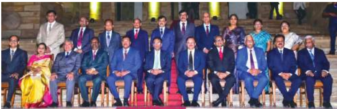
5 April 2024, the Chief Justice of India, Dr D Y Chandrachud, Justice B R Gavai, Justice Abhay S Oka, and Justice P B Varale attend the inaugural centenary year celebration program of the High Court Bar Association, Nagpur