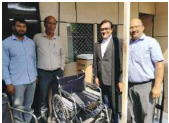
23 April 2024, the SCBA places wheelchairs at all entry gates of the Supreme Court