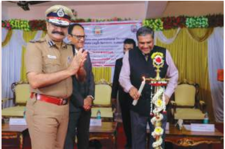
28 April 2024, Justice Sanjiv Khanna at the inauguration of the Convict Paralegal Volunteer Training Programme, "PATAM Project" conceptualised by the PRISM,NGO in collaboration with DLSA Madurai and prison authorities at the Madurai Central Prison, Tamil Nadu