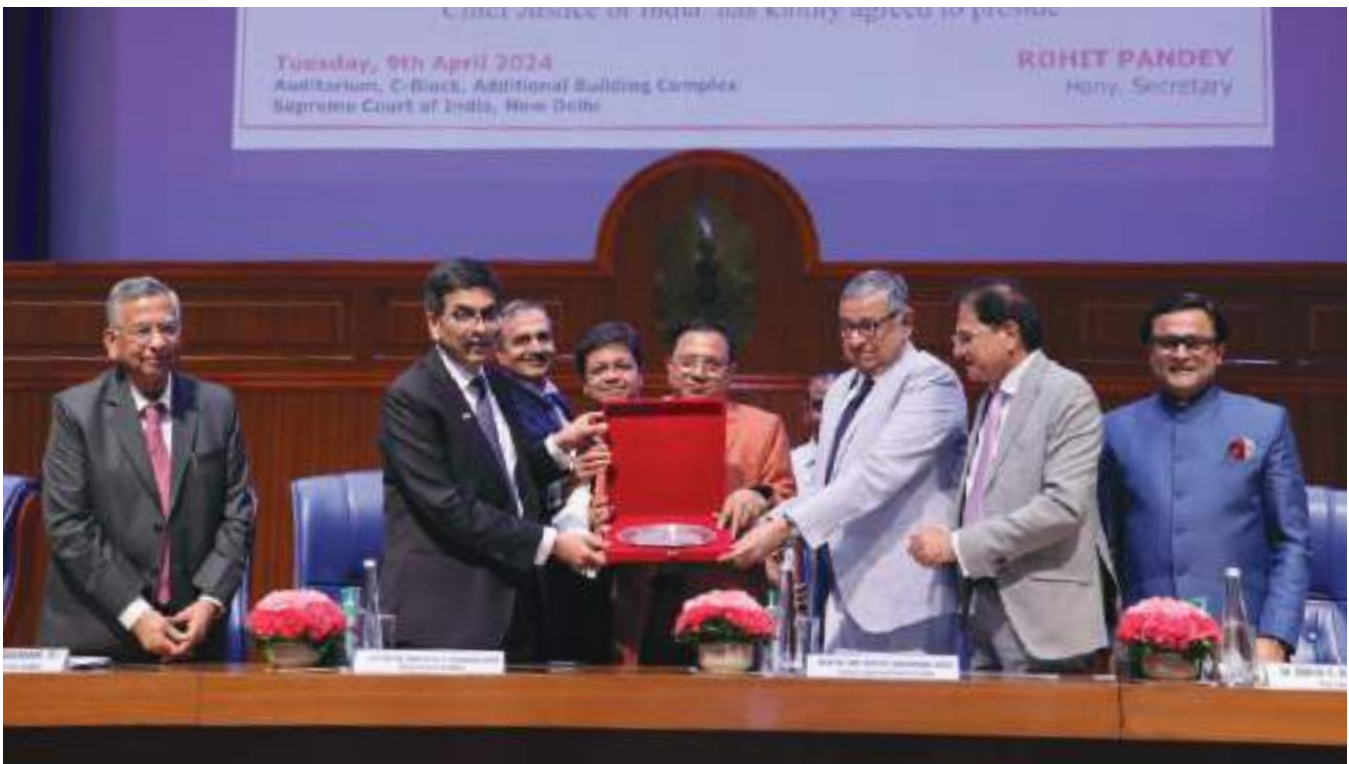
9 April 2024, the Chief Justice of India, Dr D Y Chandrachud along with Attorney General of India and SCBA members bestow a ceremonious memento upon Justice Aniruddha Bose during a heartfelt farewell