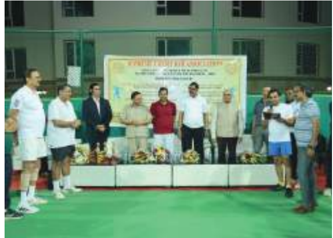
7 April 2024, Justice B R Gavai, Justice M M Sundresh, and Justice Ahsanuddin Amanullah distribute prizes to the winners and runners-up of the Annual Lawn Tennis Tournament 2024, organised by SCBA