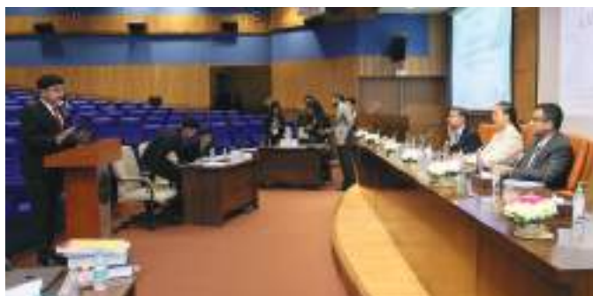
28 April 2024, the semi-final rounds taking place in the Supreme Court premises

skills of Law Clerks and Law Researchers who are working in the chambers of the Supreme Court Judges and the Registry of the Supreme Court.