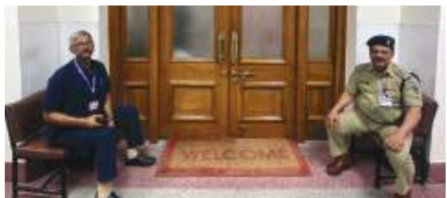
Security personnel deployed outside judges gallery at the Supreme Court of India

Pursuant to directions of the Chief Justice of India, we have recently introduced state-of-the-art security equipment including under-vehicle scanners, Radio Frequency Identification (RFID) tag system for vehicles, boom barriers and bollards at the gates. Automatic crash resistant sliding gates are also being introduced at the gates. The Su-Swagatam system is also being integrated with the access control system to ensure faster entry of stakeholders. In fact, we have also implemented a process for online intimation regarding various conferences, meetings so that entry of vehicles and stakeholders is facilitated.