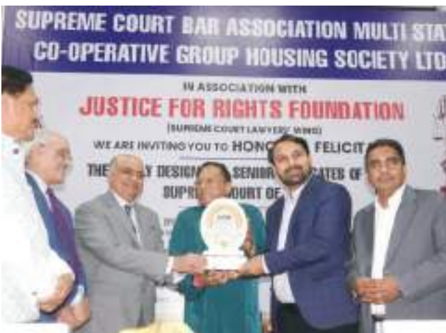
18 April 2024, Justice Ahsanuddin Amanullah, Chief Guest, addresses the newly designated Senior Advocates of Supreme Court of India at ISIL, Krishna Menon Bhawan organised by the SCBA