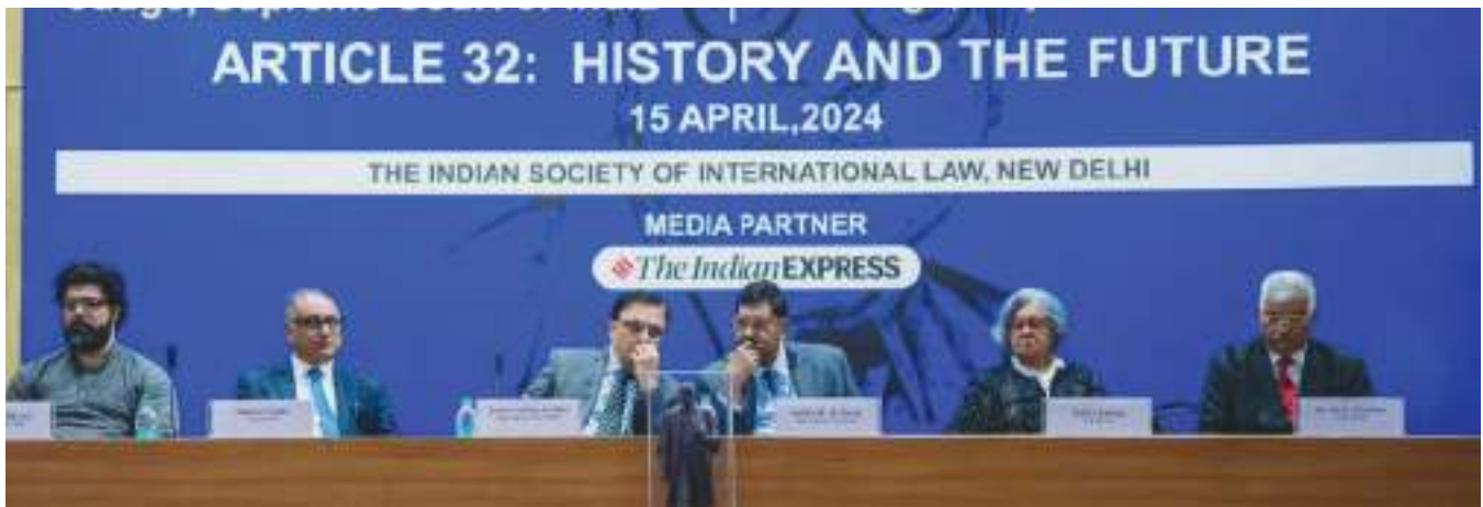
15 April 2024, Justice B R Gavai and Justice Abhay S Oka co-chair the Ambedkar Memorial Lecture series on “Article 32 : History and the Future” at ISIL organised by the Society for Constitution and Social Democracy and The Leaflet