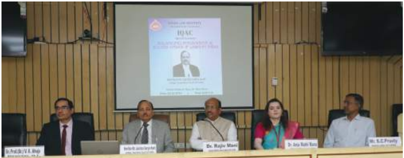
26 April 2024, Justice Surya Kant, Chief Guest, attend the Indian Law Institute website launch, on the occasion of IPR Day