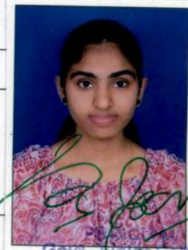
Govt. Junior College Nayabazar, Khammam-507008.