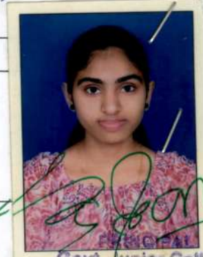
Govt. Junior College Nayabazar, Khammam-507008.