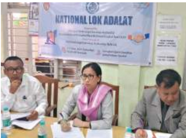
11 May 2024, 2nd National Lok Adalat for the year 2024 being undertaken in Lamphelpat, Imphal, Manipur