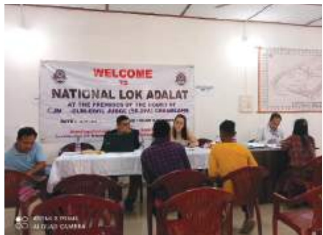
11 May 2024, 2nd National Lok Adalat for the year 2024 being undertaken in Changlang, Arunachal Pradesh