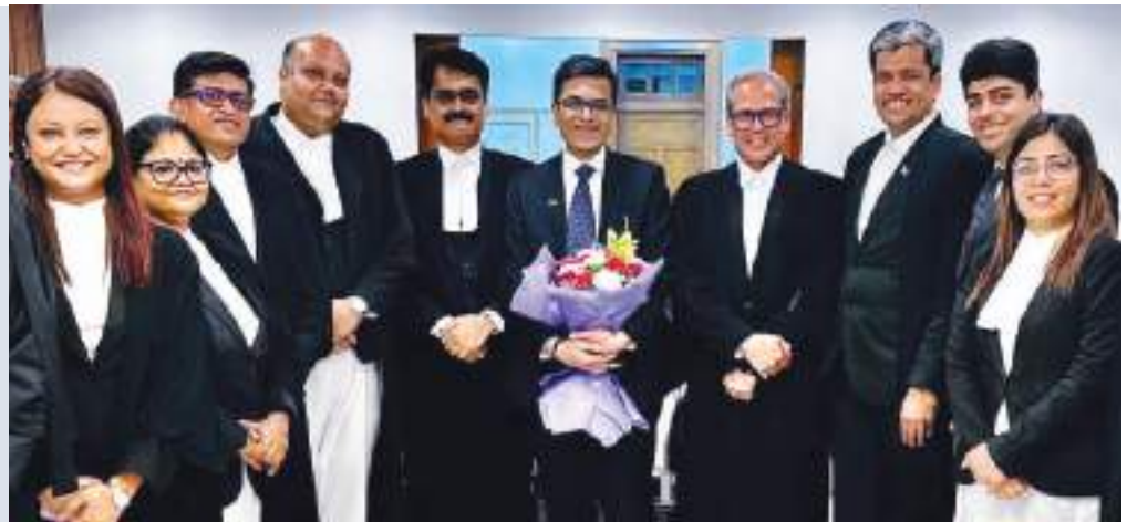
2 May 2024, the newly elected Executive Committee of SCAORA presents a bouquet to the Chief Justice of India, Dr D Y Chandrachud