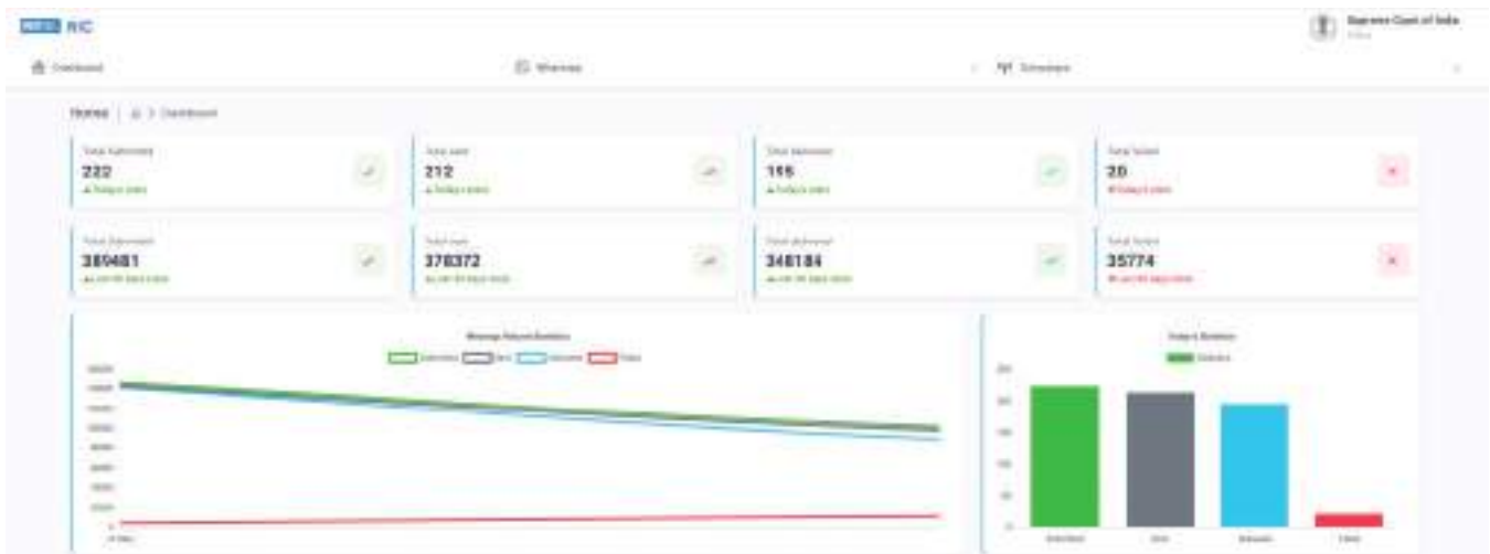
Screenshot of the data of the automated messages sent through WhatsApp