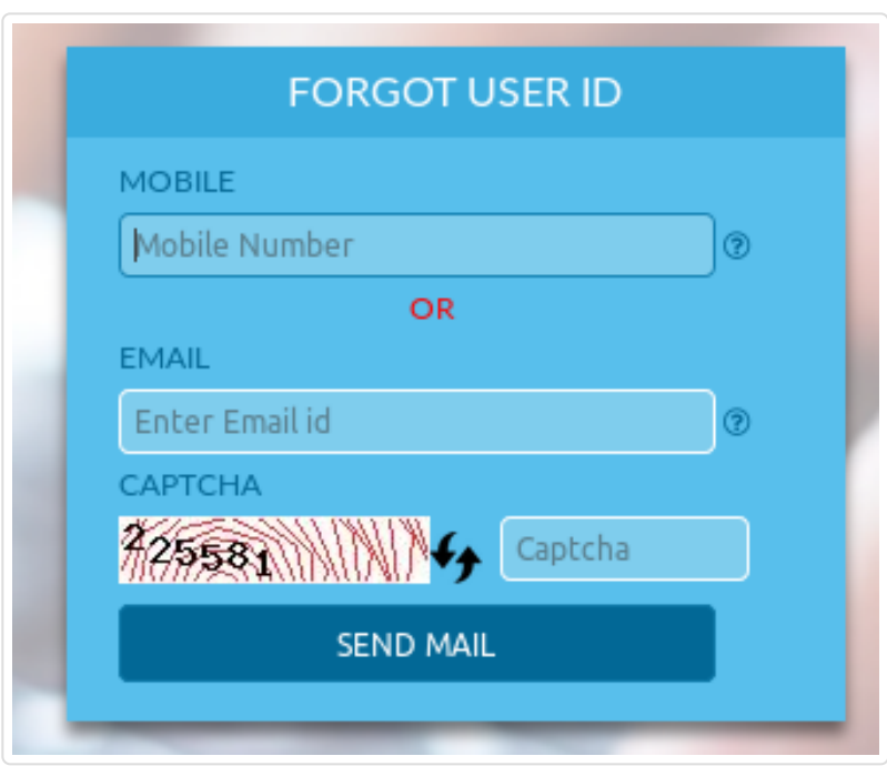
Fig. 4.1 - Forgot User-Id

You can now login into efiling application with your User-Id received on your registered email-id and password.