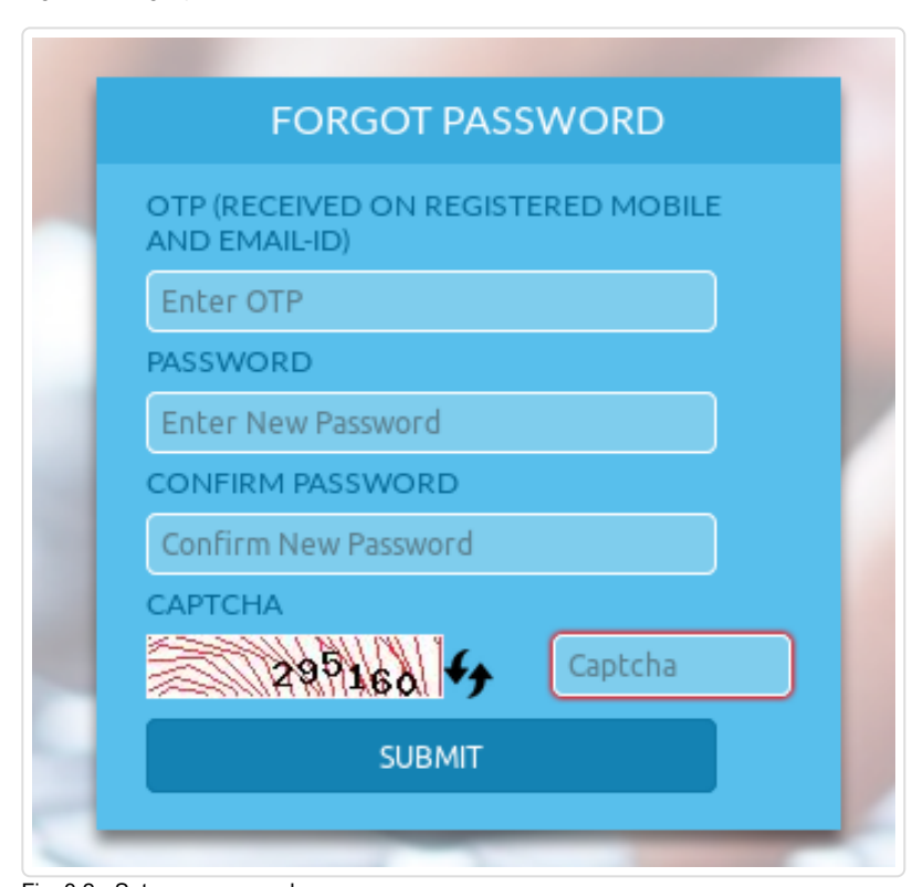
Fig. 3.2 - Set new password screen