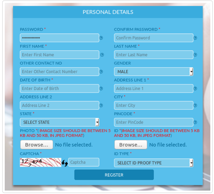
Fig 2.3 Personal Detail Form