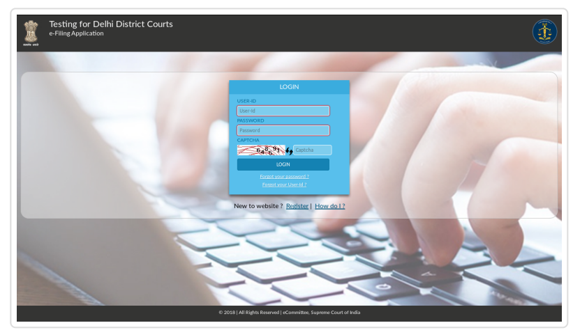
Fig. 1 - Login Screen of e-filing application

Registered users can access their efiling account by entering their login credentials (user-id and password) and correct captcha code on login screen (Fig. 1) of the application and clicking ' Login ' button.