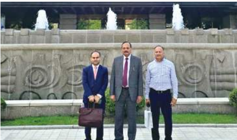
27 August 2024, Justice Surya Kant, at Korea Legislation Research Institute (KLRI), where he spoke on the topic, ‘Cross Border Challenges in Insolvency and Bankruptcy Law’ in “KLRI Programme” Sejong, South Korea