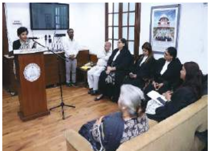
27 August 2024, Justice Hima Kohli receives a farewell from the executive members of the SCAORA on the occasion of her retirement