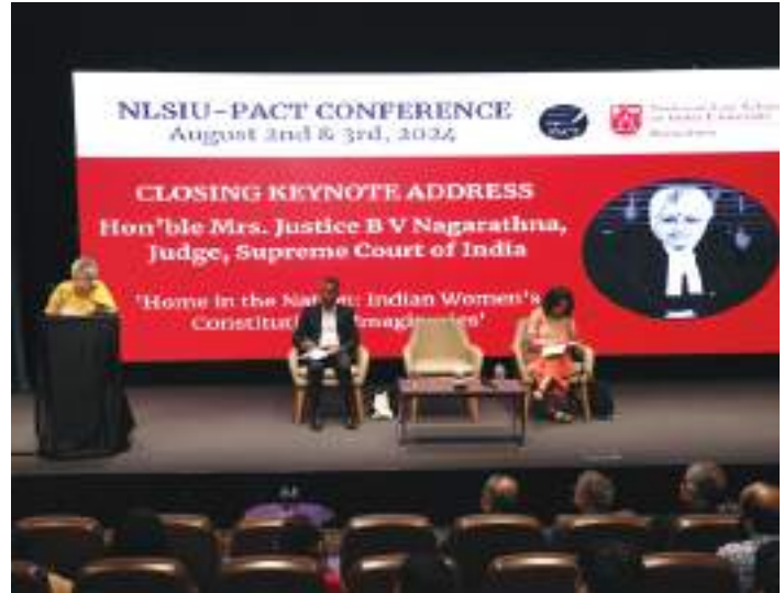
3 August 2024, Justice B V Nagarathna delivers lecture on 'Home in the Nation: Indian Women's Constitutional Imaginaries' at NLSIU-PACT Conference, organised by National Law School of India University, Bengaluru as part of the 'Pluralist Agreement and Constitutional Transformation (PACT) Project' at Prestige Falcon, Brunton Road, Bengaluru